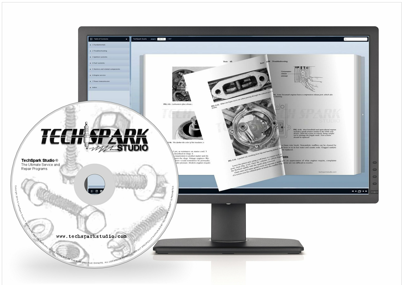
Image: A digital service manual open on a laptop screen, demonstrating the flip-book interface with detailed diagrams and text.