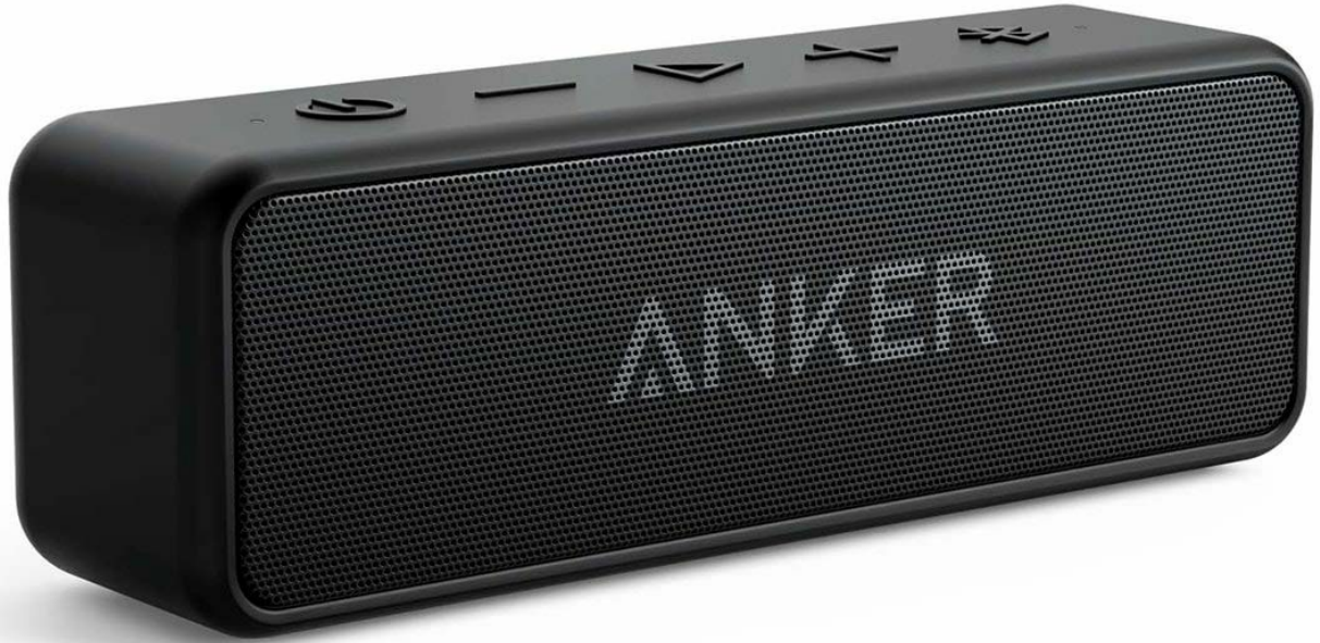
Front view of the Anker Soundcore 2 speaker, showcasing its compact design and speaker grille.