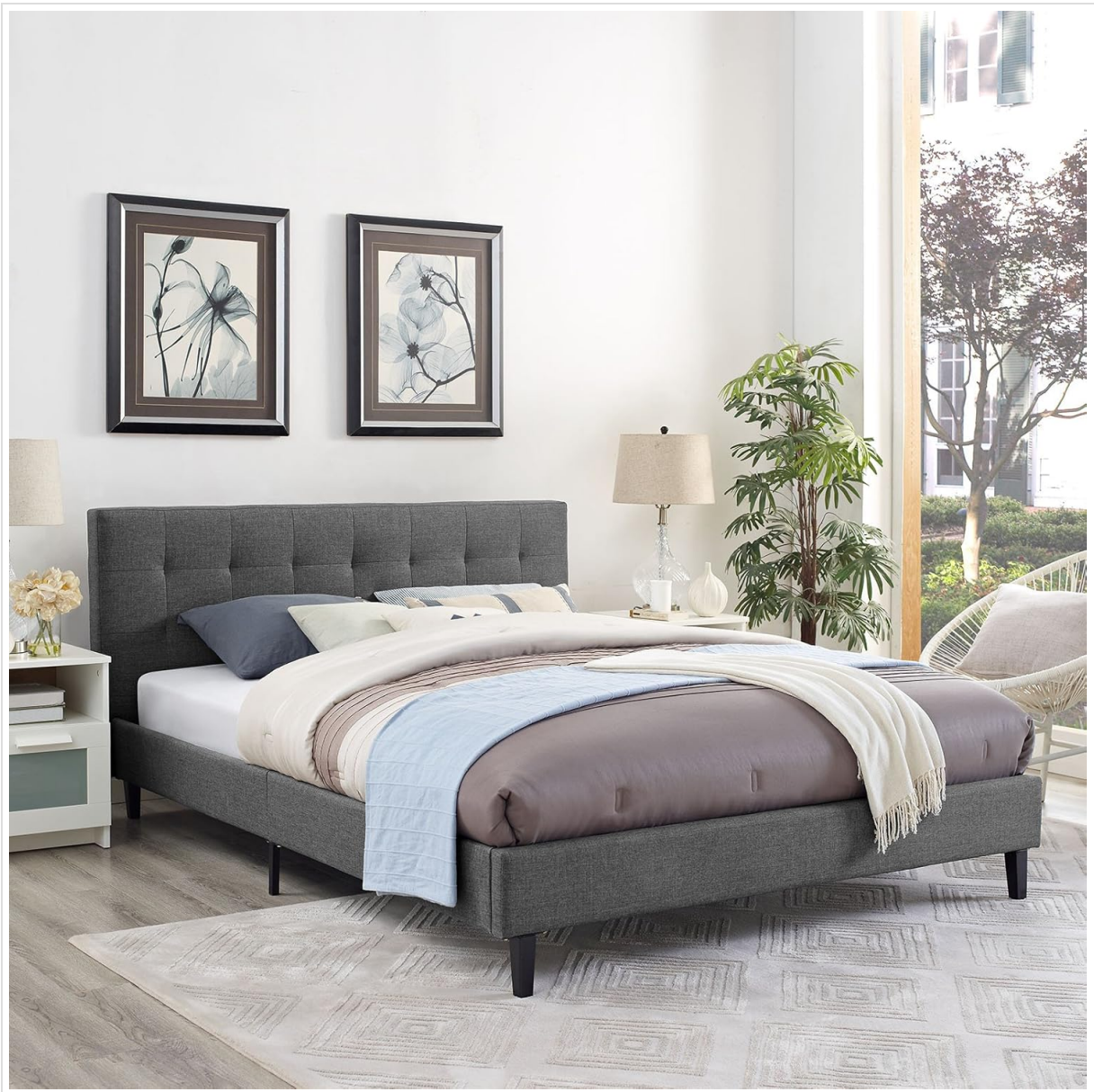
Image: The Modway Linnea Upholstered Queen Platform Bed, showcasing its elegant design and grey fabric upholstery in a bedroom setting.