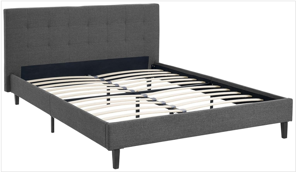
Image: Another perspective of the bed frame's slat system, highlighting the individual wooden slats and the sturdy support legs that contribute to the bed's overall strength.