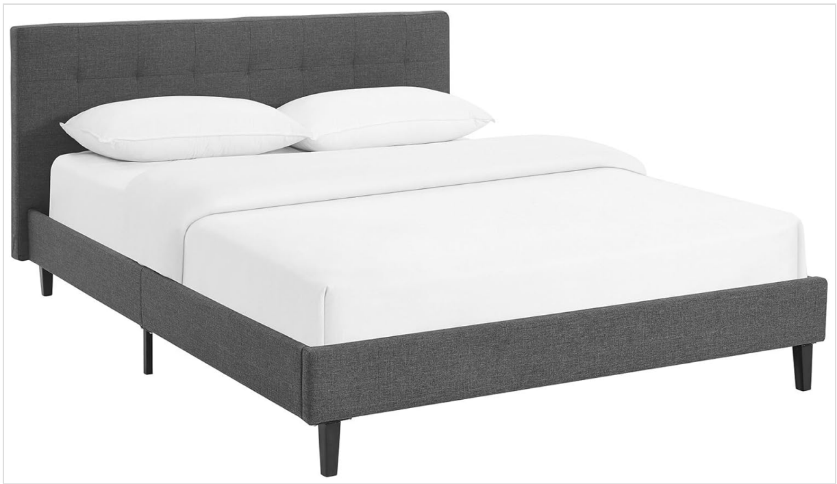
Image: The Modway Linnea Platform Bed fully assembled with a mattress and bedding, illustrating its functional use in a bedroom.