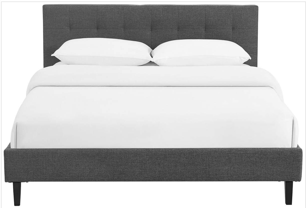
Image: A front-facing view of the Modway Linnea Platform Bed, showcasing the upholstered headboard and the mattress resting on the frame.