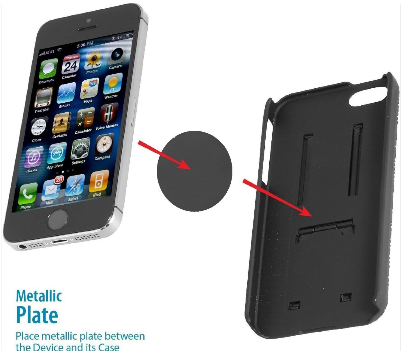
Figure 2.1: Metallic plate for smartphone attachment.

This image illustrates the metallic plate that adheres to your smartphone or its case, enabling magnetic attachment to the car mount.