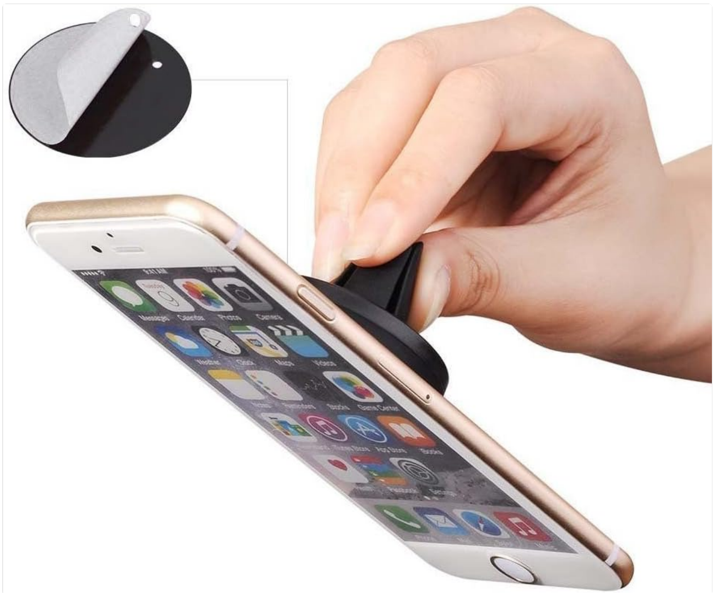
Figure 3.1: Applying the metallic plate to a smartphone.

This image demonstrates the process of attaching the metallic plate to the back of a smartphone, which is essential for the magnetic mount to function.