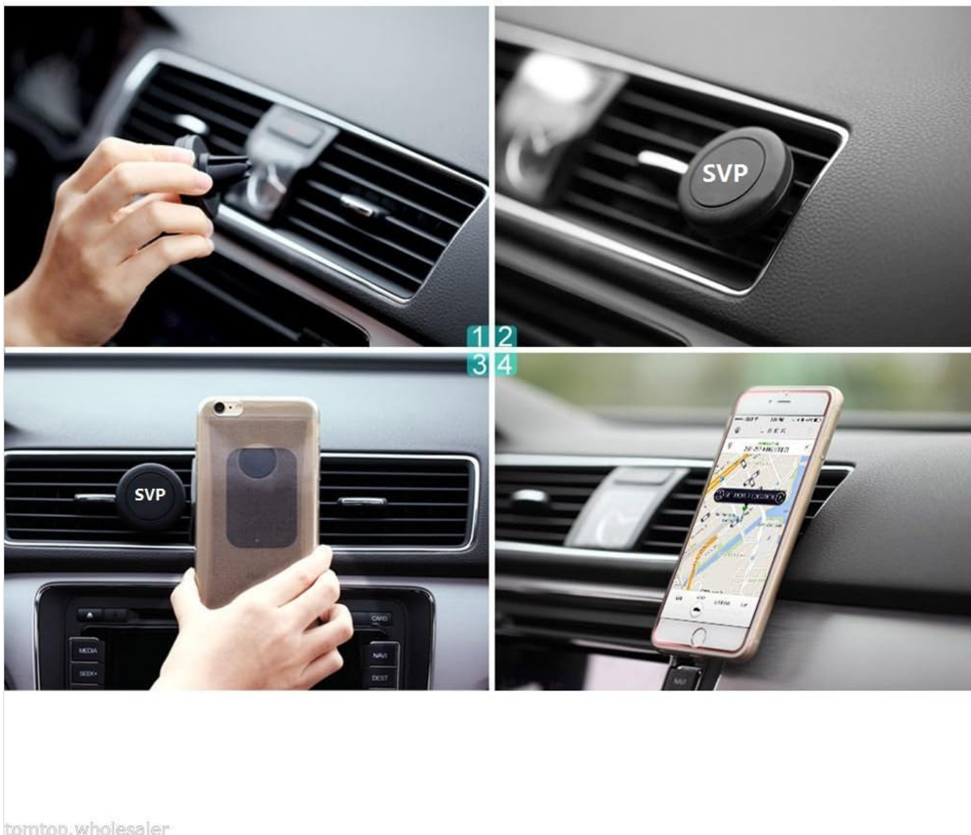
Figure 4.1: Step-by-step usage of the magnetic car mount.

This collage illustrates the full process from attaching the mount to the vent, securing the phone, and adjusting its position for navigation or media viewing.