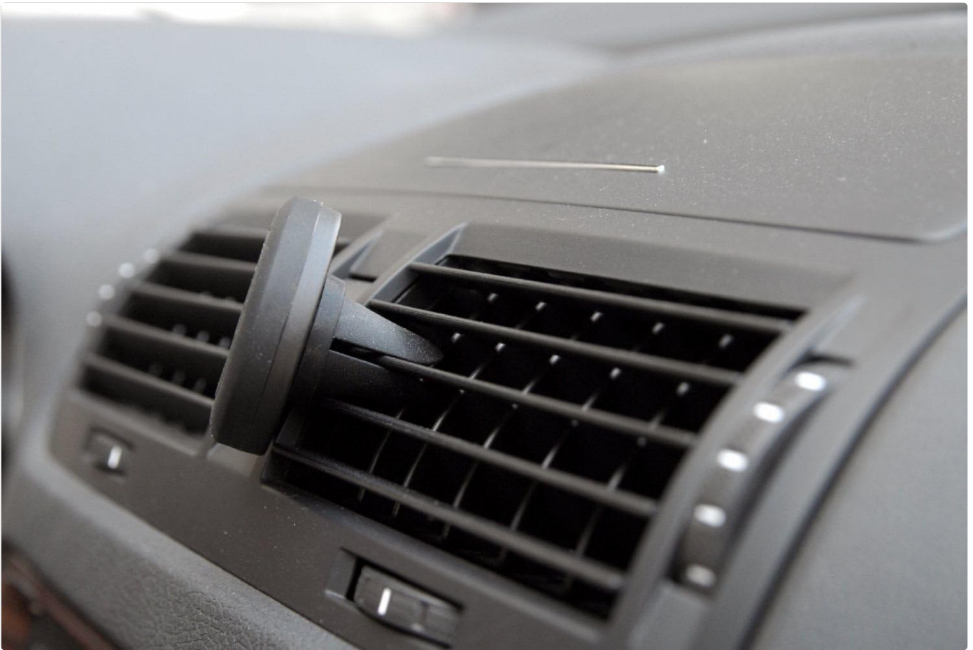
Figure 3.3: Side view of the car mount installation.

A side perspective of the car mount demonstrates its low-profile attachment to the air vent, ensuring minimal obstruction.