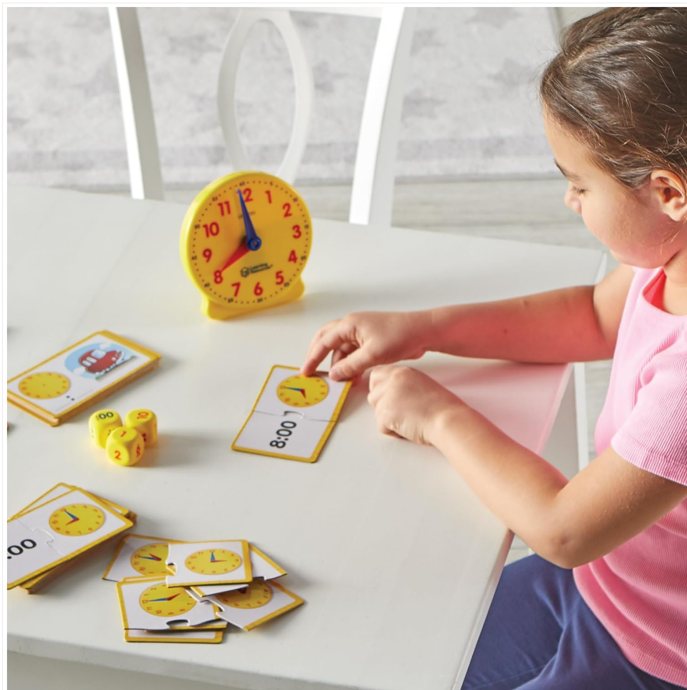
Figure 6: Multiple puzzle cards laid out for a matching activity.