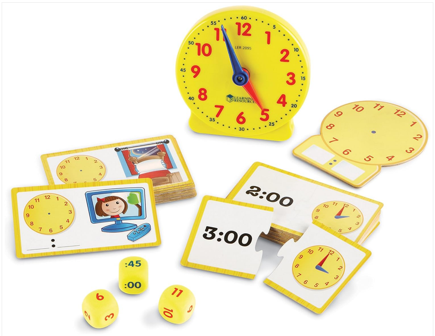
Figure 1: Overview of the Learning Resources Time Activity Set components.