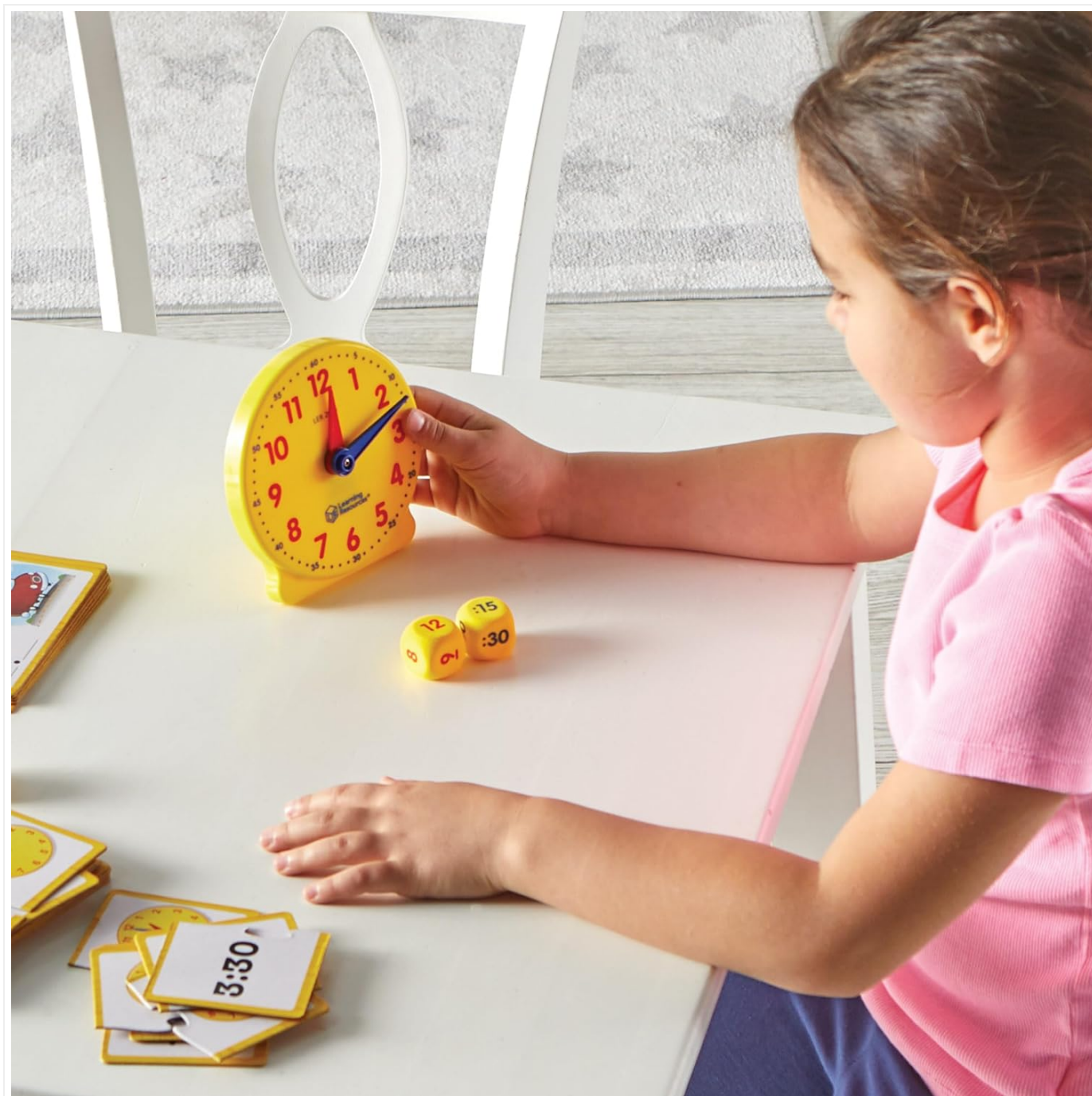
Figure 3: A child setting the time on the teaching clock.