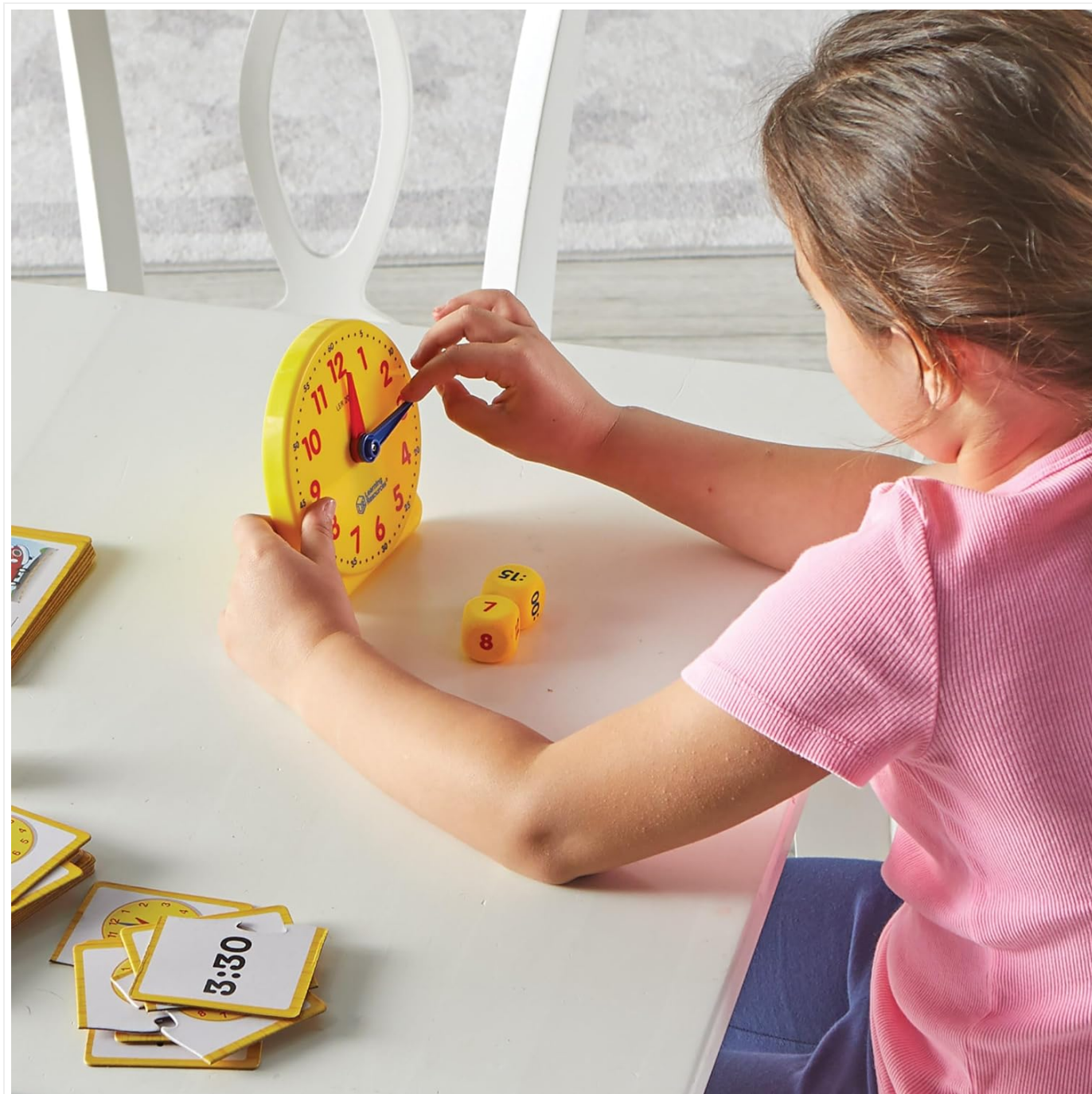
Figure 4: Close-up of a child adjusting the clock hands.