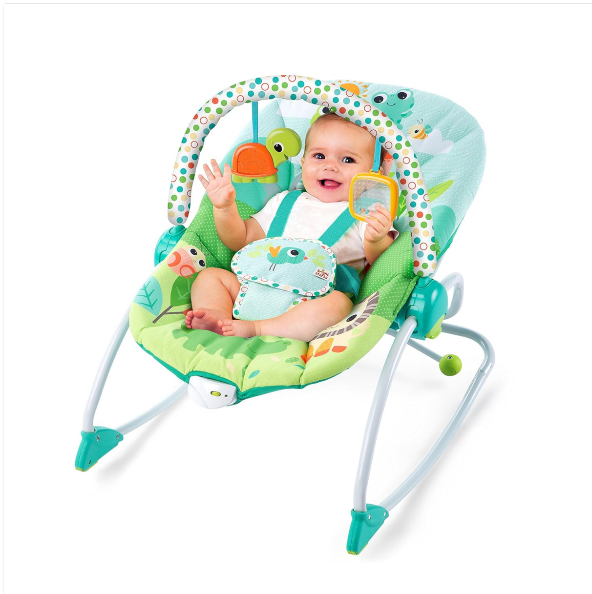
Figure 1: Fully assembled rocker, ready for use.