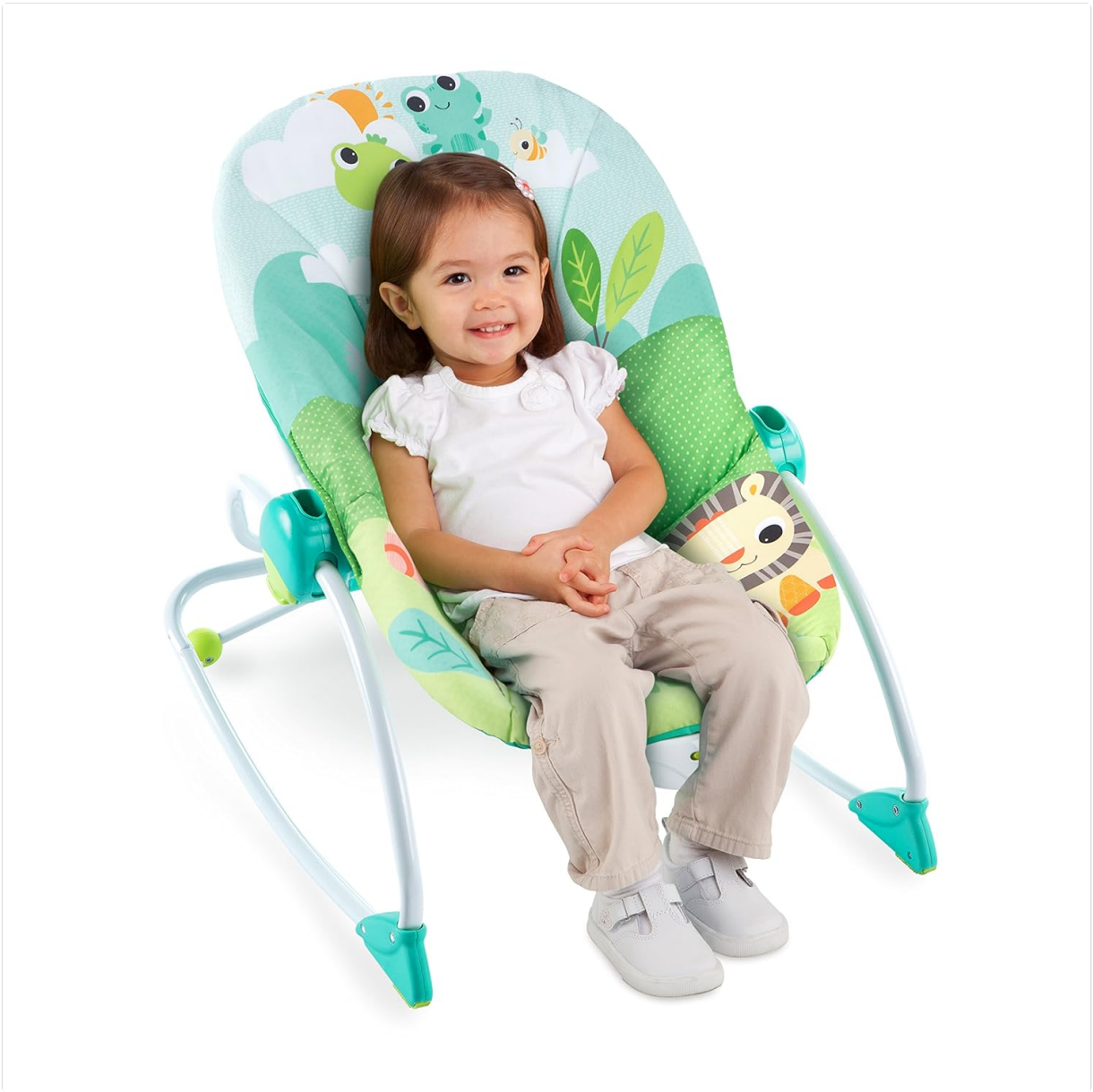
Figure 5: Toddler using the product in stationary seat mode.