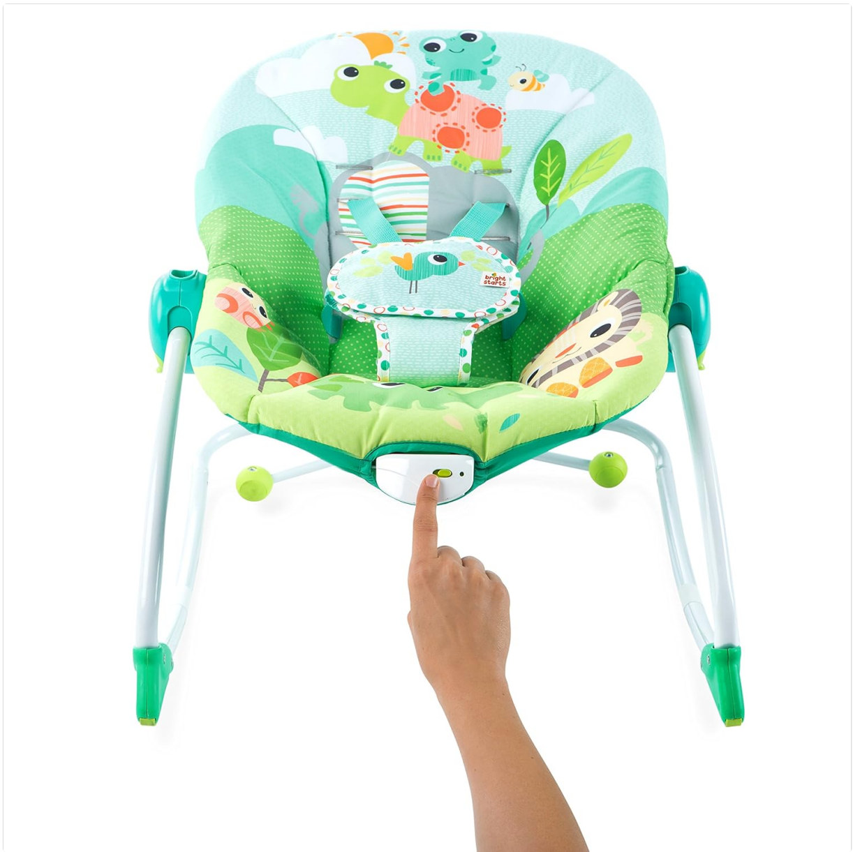
Figure 3: Activating the soothing vibration feature.