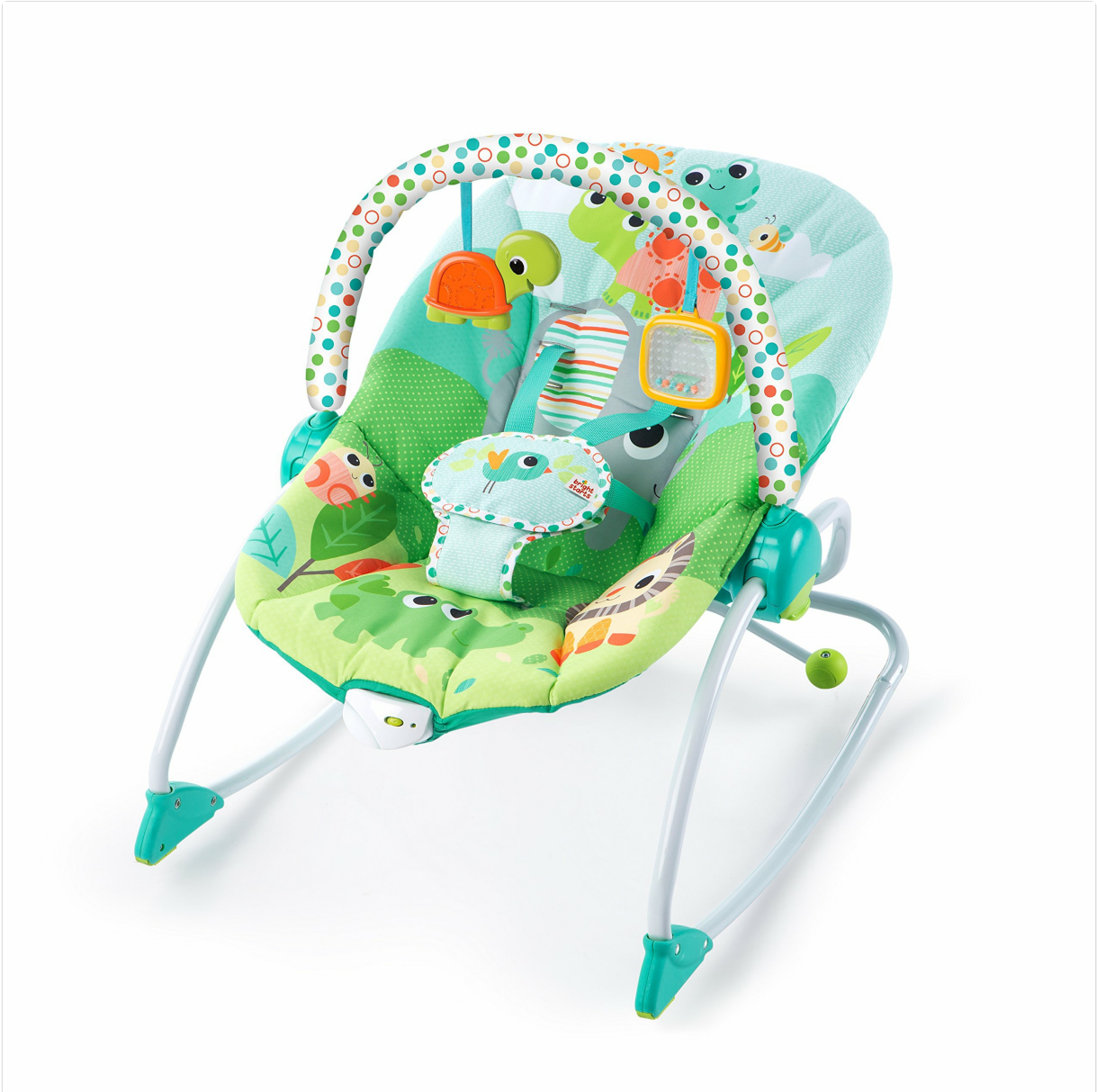
Figure 2: Infant in rocker mode with toy bar.