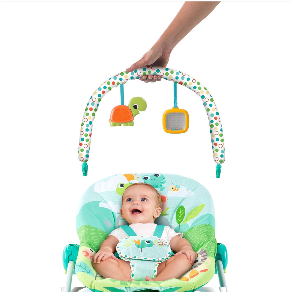
Figure 4: Removing the toy bar for easy access.