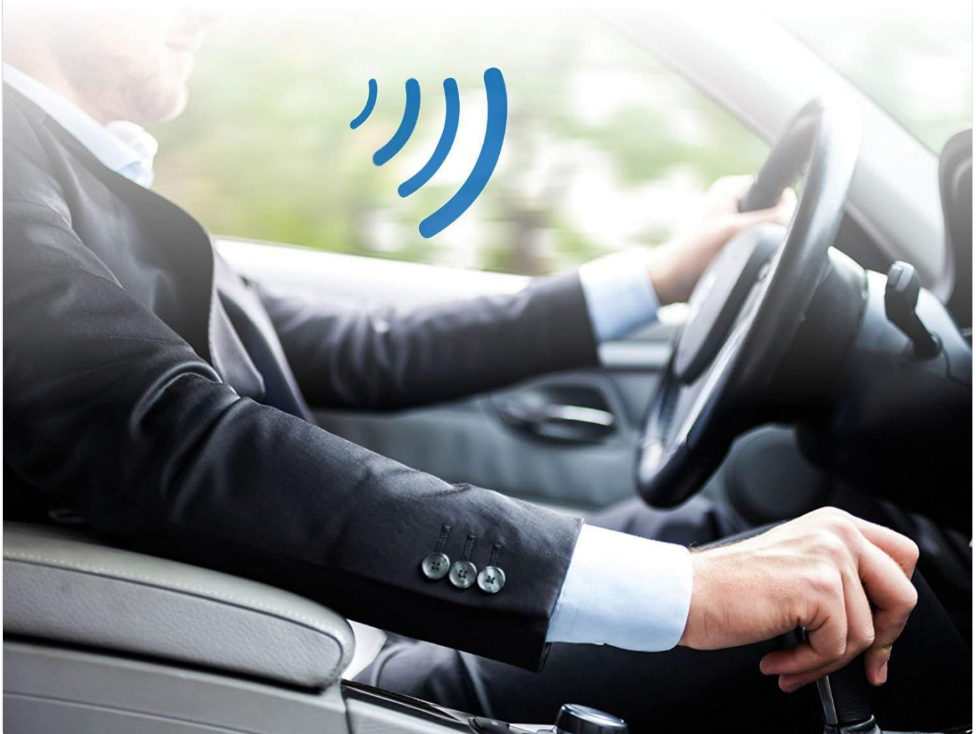
Image: Using voice commands with the BK01.