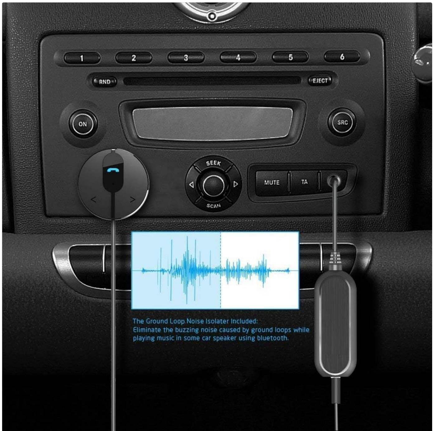
Image: Ground Loop Noise Isolator connection for noise elimination.