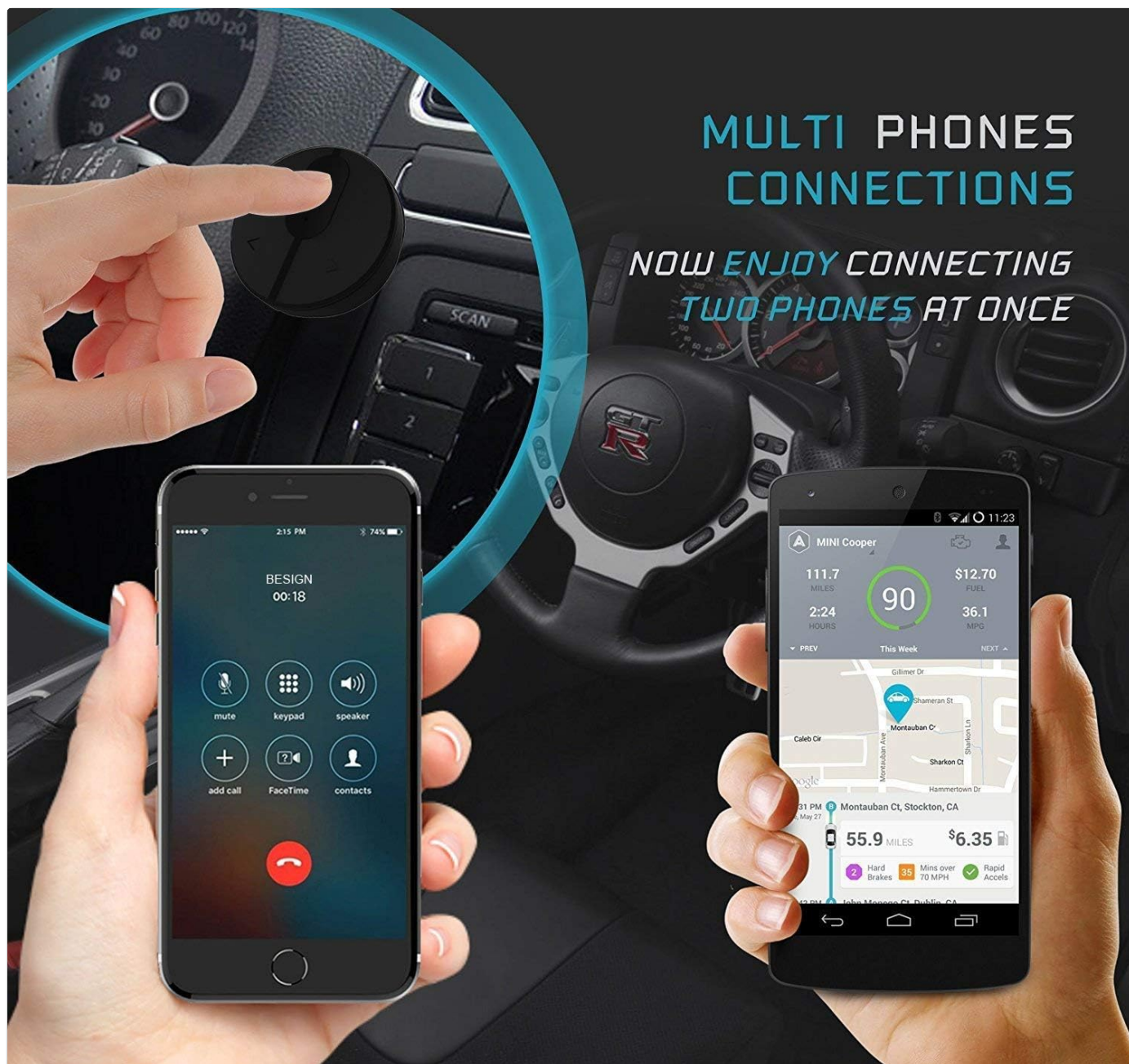
Image: Multi-phone connection capability.