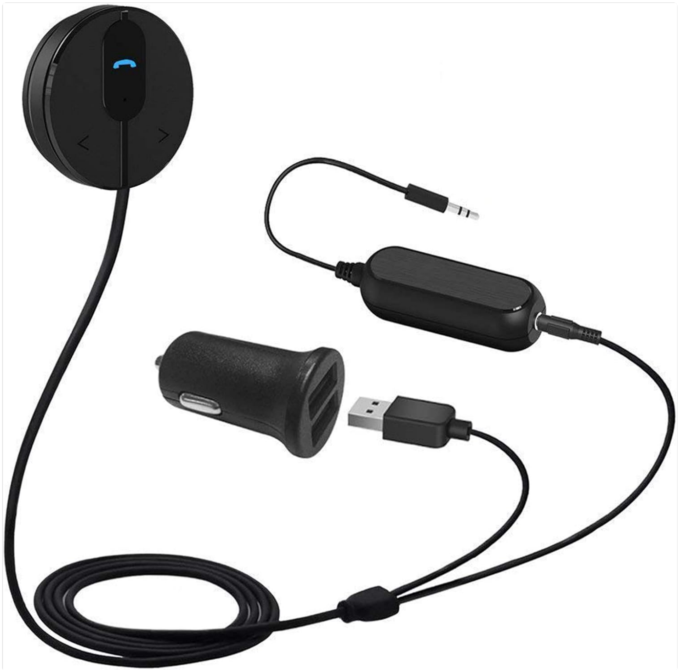
Image: Overview of the BESIGN BK01 Bluetooth Car Kit.