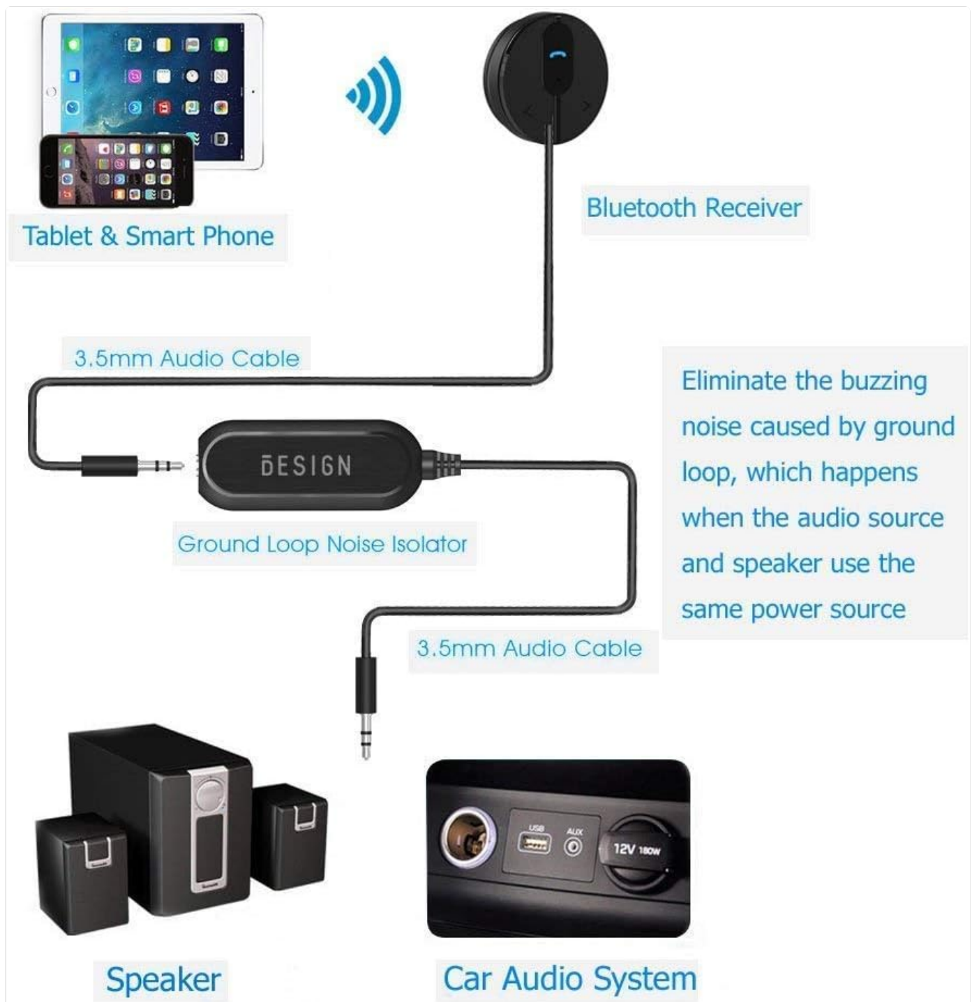
Image: Contents of the BESIGN BK01 Bluetooth Car Kit package.