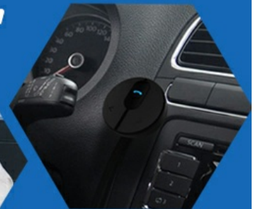
Image: Step-by-step installation guide for the BK01.