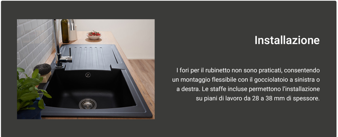
Figure 4.5: Installation diagram for the sink.

Apply a bead of silicone sealant around the edge of the countertop cutout. Carefully lower the sink into the opening. Ensure the sink is level. Use the included mounting clamps to secure the sink firmly to the underside of the countertop. The clamps are designed for countertops between 28 mm and 38 mm thick.