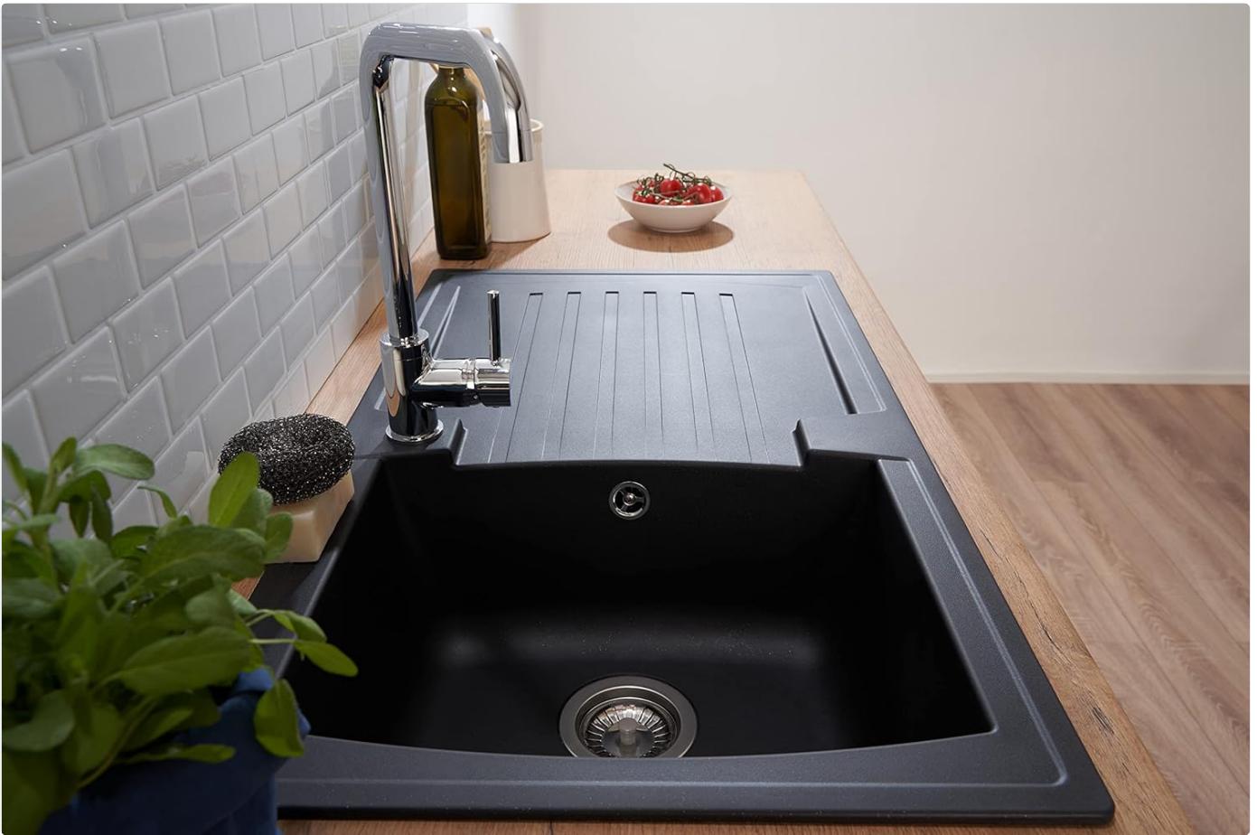
Figure 5.1: Sink in a typical kitchen environment.