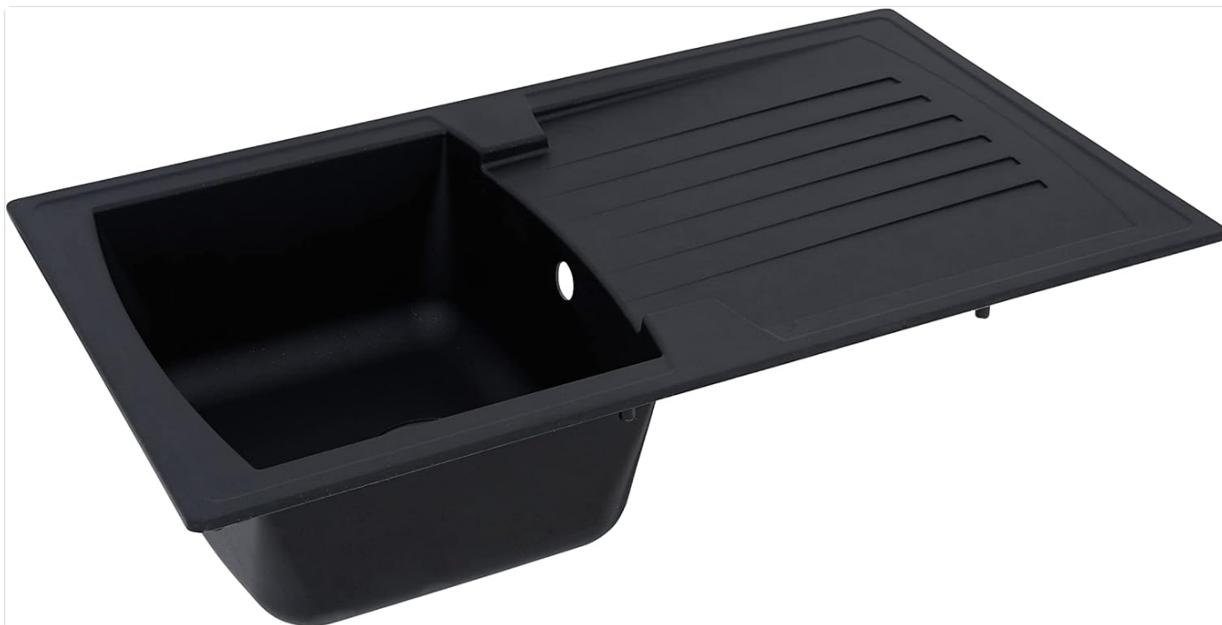
Figure 6.1: Detail of the Mineralite surface texture.