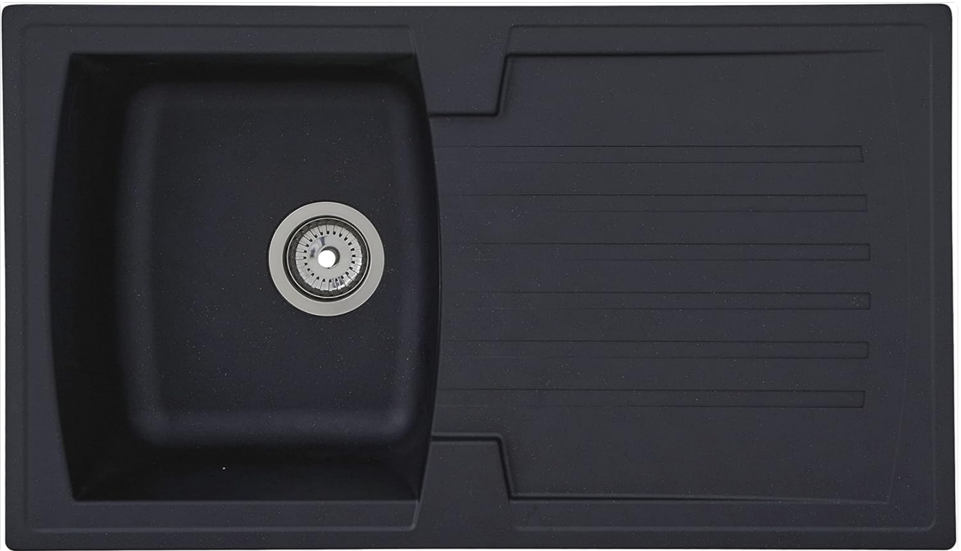
Figure 2.1: Top-down view of the Respekta Boston Mineralite Sink.