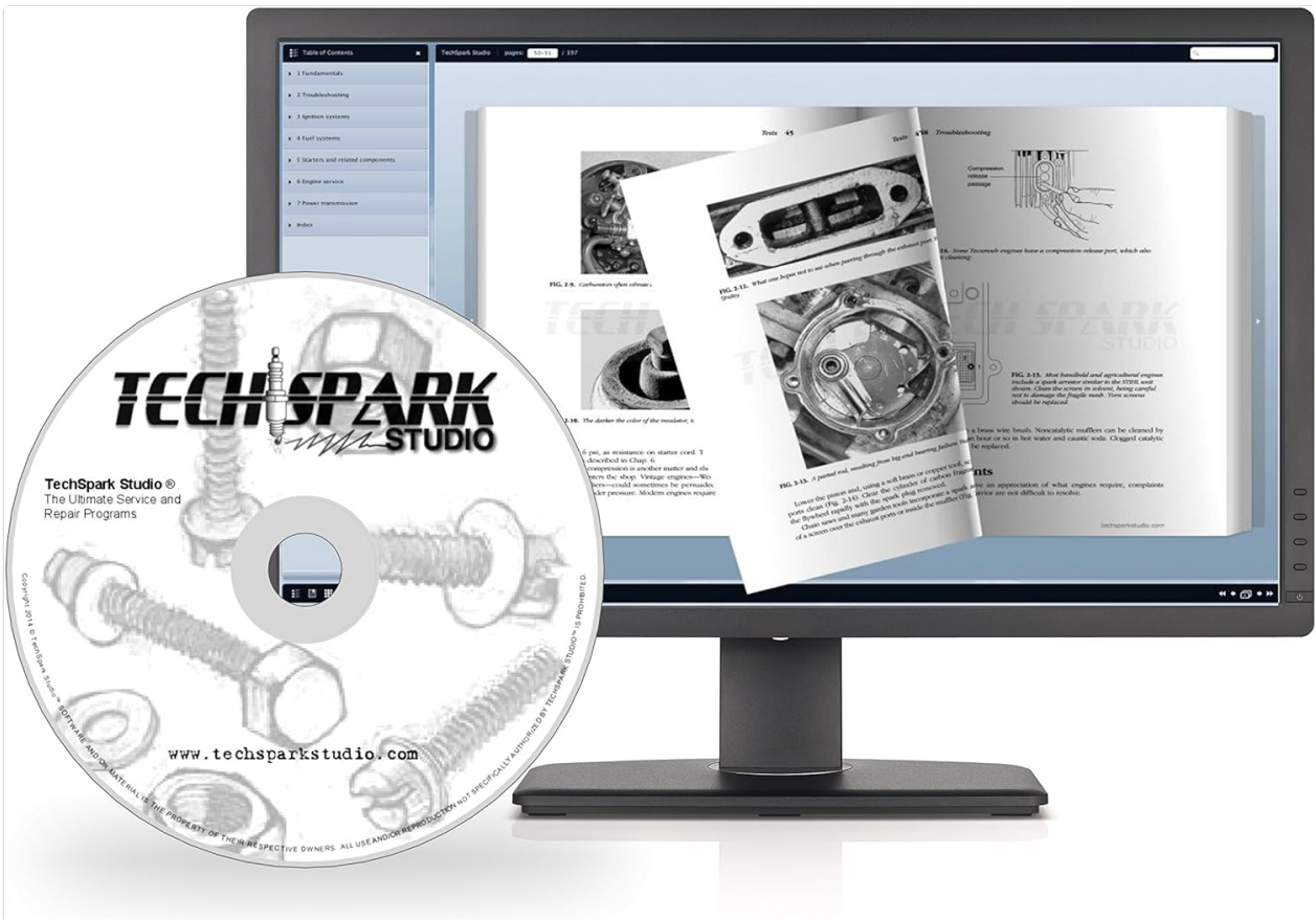
This image displays the TechSpark Studio CD-ROM alongside a computer monitor, illustrating the digital format of the service and repair manual. The monitor shows the interactive interface with a page from the manual open, demonstrating the user experience.