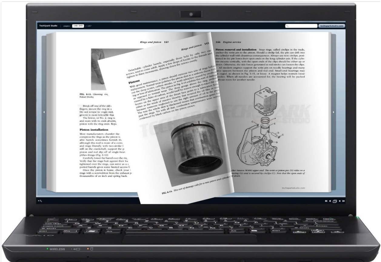
A laptop screen showcases the TechSpark Studio digital service manual in action, highlighting its portability and ease of access on a personal computer. The manual's 'flipping book' interface is visible, providing a realistic representation of a physical manual.