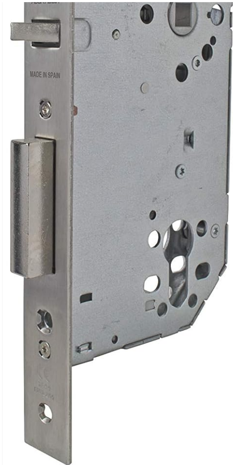
Figure 1: This image displays the primary components of the Tesa Assa Abloy 403050AI Mortise Lock, showing the main lock mechanism, the faceplate, and the escutcheon for the Euro profile cylinder.