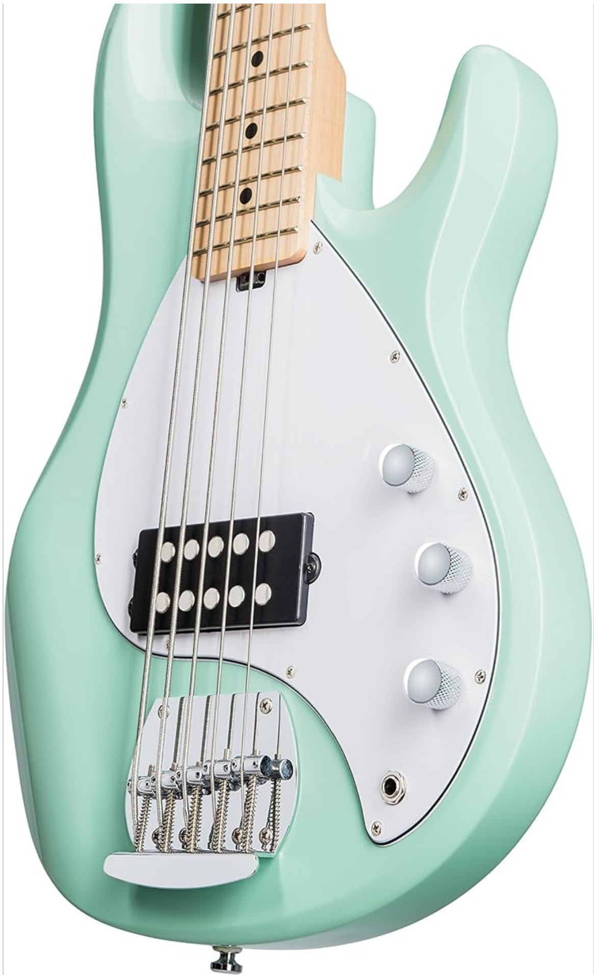
Image: Detailed view of the bass's control knobs (volume, treble, bass) and the bridge assembly.