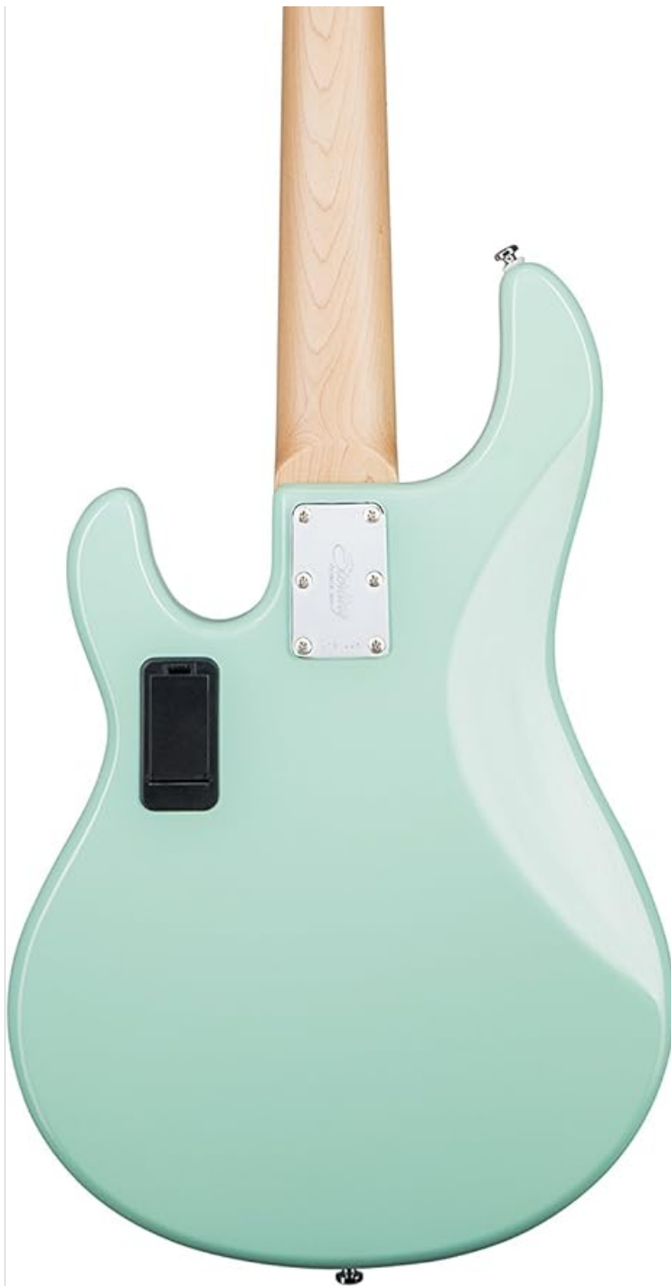
Image: Full back view of the Sterling by Music Man Ray5 StingRay Bass, illustrating the smooth body finish and neck attachment.