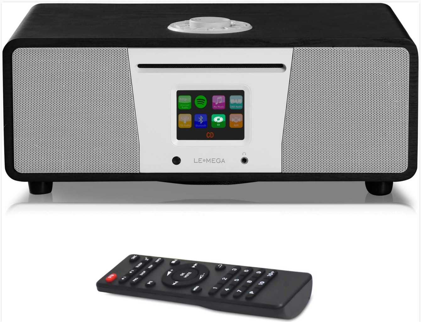
Figure 1: Front view of the LEMEGA M4+ Hi-Fi system with the included remote control. The unit features a central display, CD slot, and control buttons.