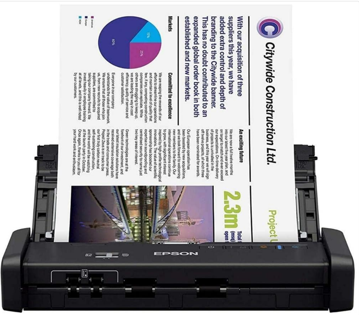
Image: The Epson DS-320 Mobile Scanner actively scanning a document.