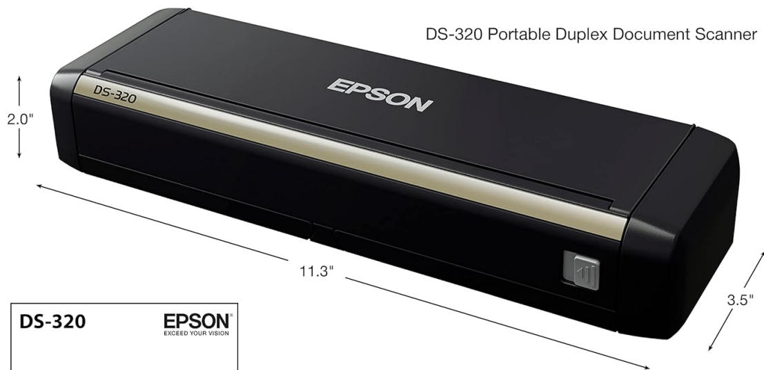
DS-320 Portable Duplex Document Scanner