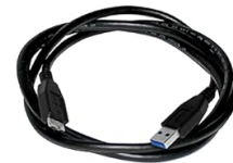
SuperSpeed USB Cable 1

1 USB power requires USB 3.0 connection port on your computer.