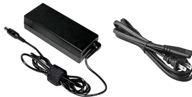
AC Adapter and Power Cable