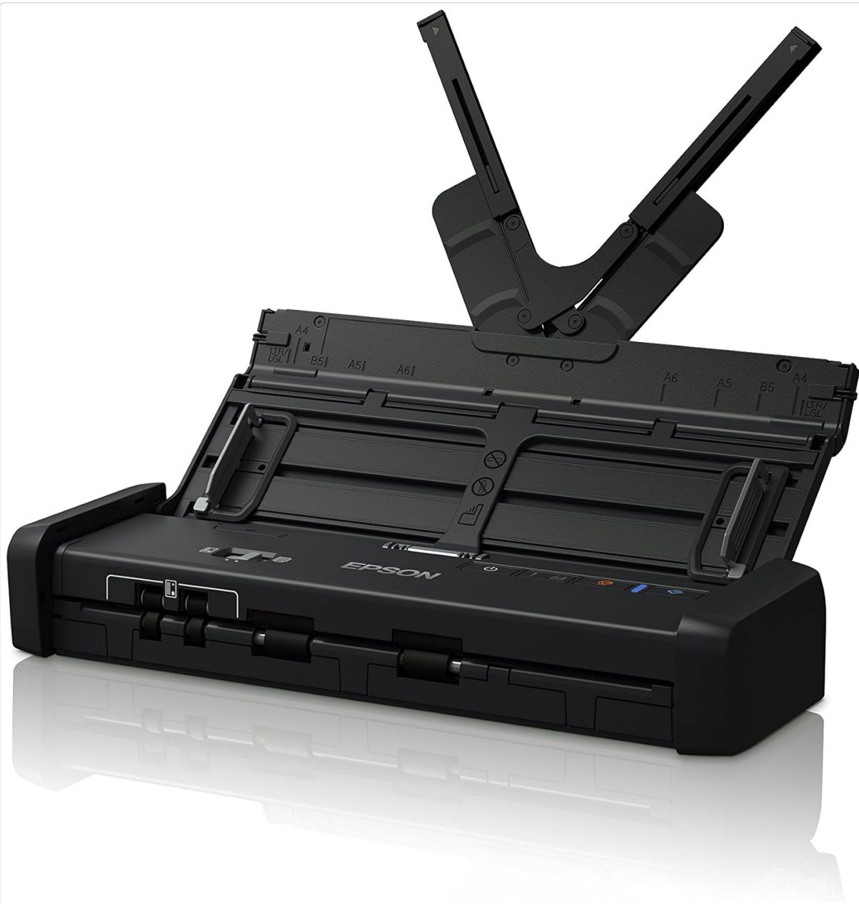
Image: The Epson DS-320 Mobile Scanner with its Automatic Document Feeder (ADF) extended, ready for document loading.