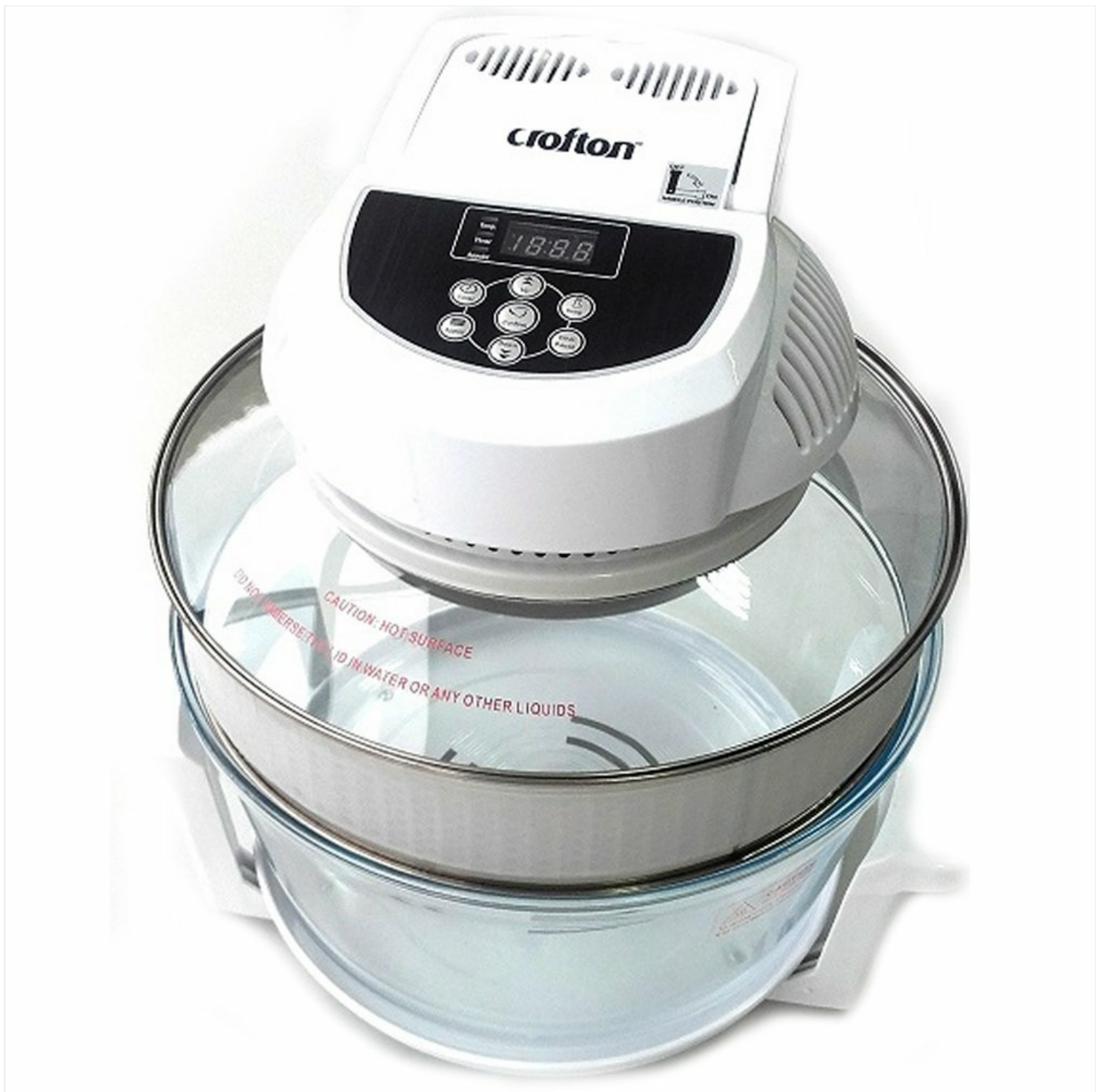
Image: The digital control panel of the Crofton KHC617D Halogen Oven, featuring a digital display for temperature and timer, along with buttons for Timer, Appoint, Up, Down, Temp, Confirm, and Clear/Pause. An 'OFF ON HANDLE POSITION' switch is visible on the top right.