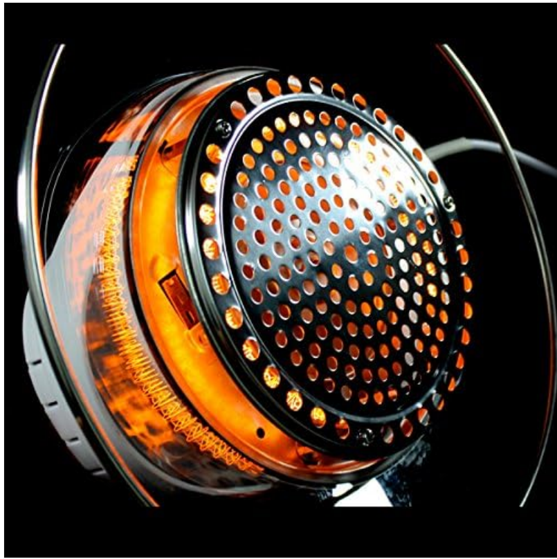
Image: A close-up view of the halogen heating element and fan assembly, located in the lid of the oven, responsible for generating heat and circulating hot air.