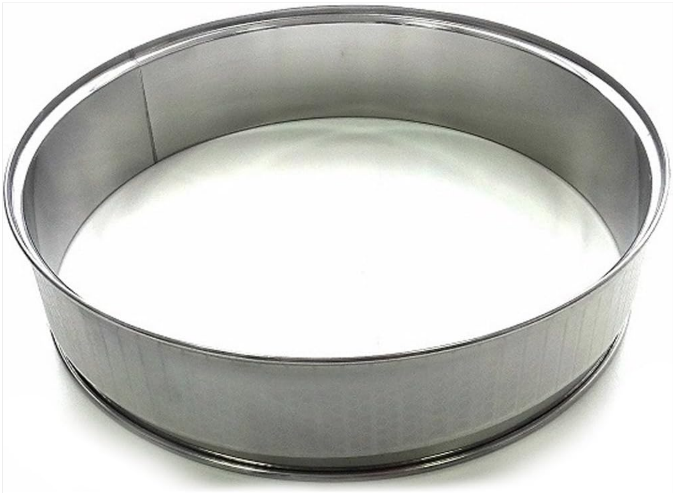
Image: A stainless steel extension ring, used to increase the cooking capacity of the halogen oven.