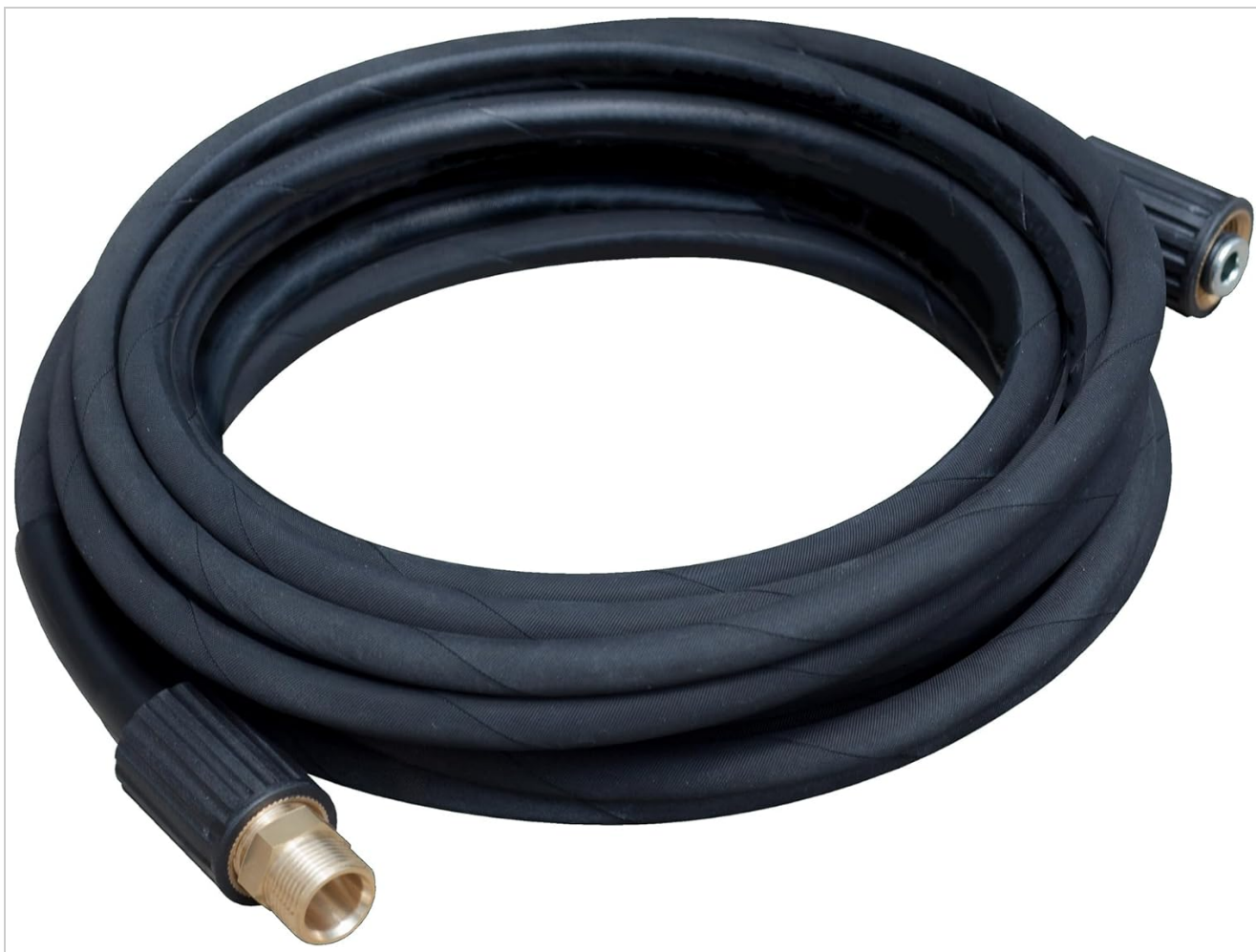
Image: The Sun Joe SPX-25HD 25 Ft Heavy-Duty Pressure Washer Extension Hose, coiled, showing both connector ends.

This manual provides instructions for the safe and effective use of the Sun Joe SPX-25HD 25 Ft Heavy-Duty Pressure Washer Extension Hose. This hose is designed to extend the reach of compatible pressure washers, allowing for greater flexibility during cleaning tasks. Please read this manual thoroughly before installation and operation to ensure proper use and to prevent potential hazards.