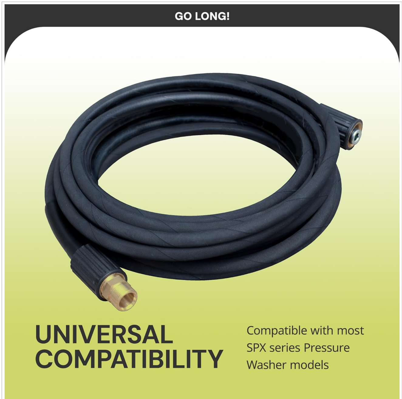
Image: The Sun Joe SPX-25HD hose illustrating its universal compatibility with most SPX series pressure washer models and M22-15mm connections.

If you are uncertain about compatibility, it is recommended to use a 15-to-14 mm adapter for pressure washer guns with 14mm male nubs.