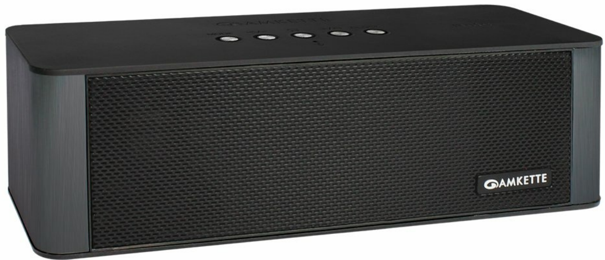
Figure 1: Front view of the Amkette Trubeats S50 speaker, showing the speaker grille and LED display.