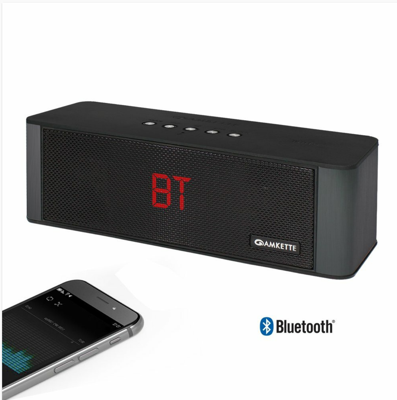
Figure 4: Speaker in Bluetooth pairing mode, indicated by 'BT' on the display.