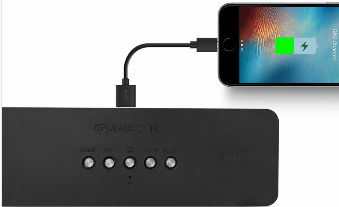
Figure 8: Speaker providing power to a smartphone through its USB Host port.

The Amkette Trubeats S50 can charge your smartphone or other USB-powered devices. Connect your device's charging cable to the USB Host Port on the rear of the speaker. The speaker's internal battery will then supply power to your device.