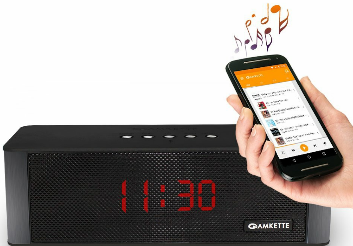
Figure 9: Smartphone displaying the Amkette Trubeats Smart Speaker App interface.

For enhanced control, download the Amkette Trubeats Smart Speaker App from the Google Play Store (for Android phones). The app allows you to: