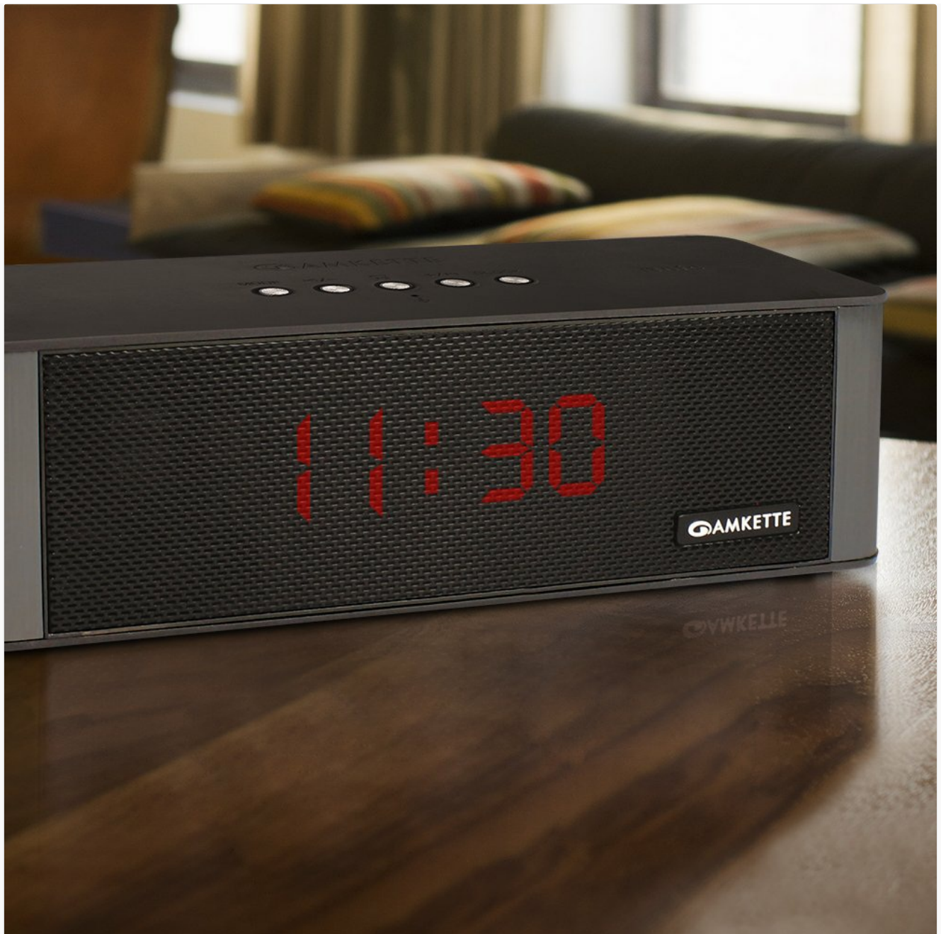
Figure 7: Speaker displaying the current time on its LED screen.