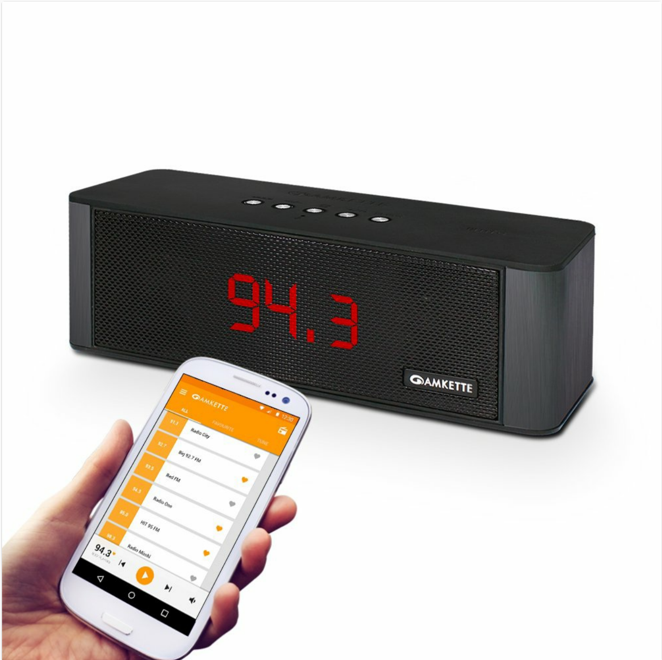
Figure 6: Speaker displaying FM frequency, with app control for station selection.