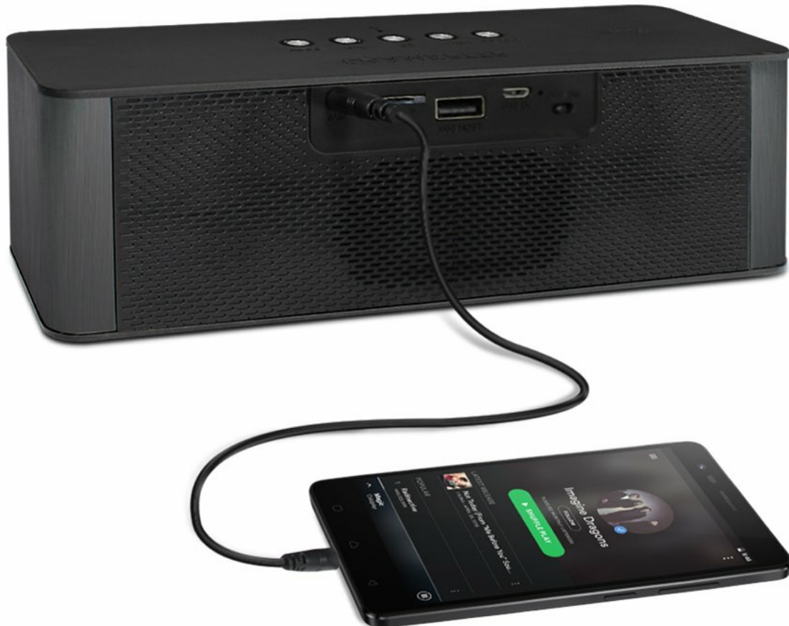
Figure 5: Speaker connected to a smartphone via AUX cable for wired audio playback.