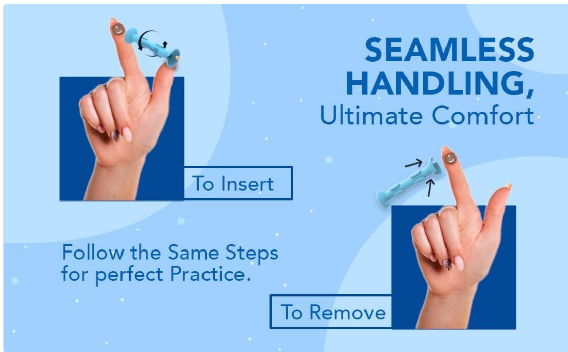
Image Description: An image demonstrating seamless handling for both insertion and removal. One hand holds the OptiWand to insert a lens, while another hand demonstrates using the tool to remove a lens, emphasizing the gentle action.