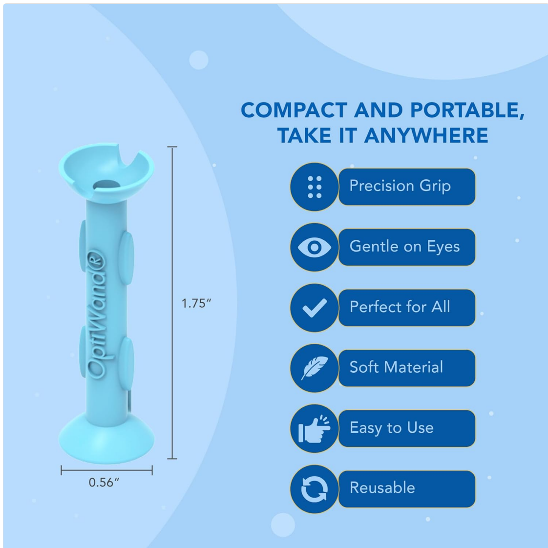
Image Description: A light blue OptiWand tool shown vertically with measurement lines indicating a length of 1.75 inches and a width of 0.56 inches. Accompanying text lists features like Precision Grip, Gentle on Eyes, Perfect for All, Soft Material, Easy to Use, and Reusable.