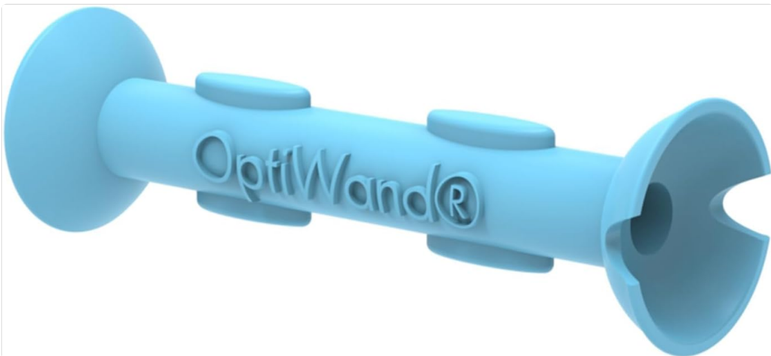
Image Description: A light blue OptiWand tool, cylindrical with finger grips and two distinct ends: one circular for insertion and one with a pincher design for removal. The brand name "OptiWand" is embossed on the side.

This manual provides comprehensive instructions for the safe and effective use of your OptiWand Portable Soft Contact Lens Removal & Insertion Tool. Designed for ease of use, this silicone device assists in the handling of soft contact lenses, offering a hygienic and precise method for both insertion and removal.