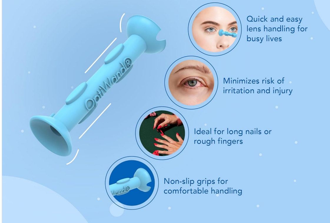
Image Description: An image highlighting the OptiWand's benefits: quick and easy lens handling, minimized risk of irritation, ideal for long nails or sensitive fingers, and non-slip grips for comfortable handling. The OptiWand tool is shown prominently.

Convenient, Precise and Safe for Effortless Lens Application and Removal