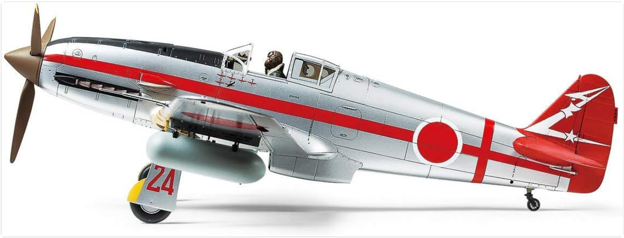
Figure 8: Detailed cockpit interior.