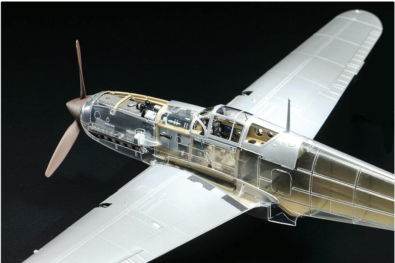
Figure 7: Internal details visible through a clear fuselage section.