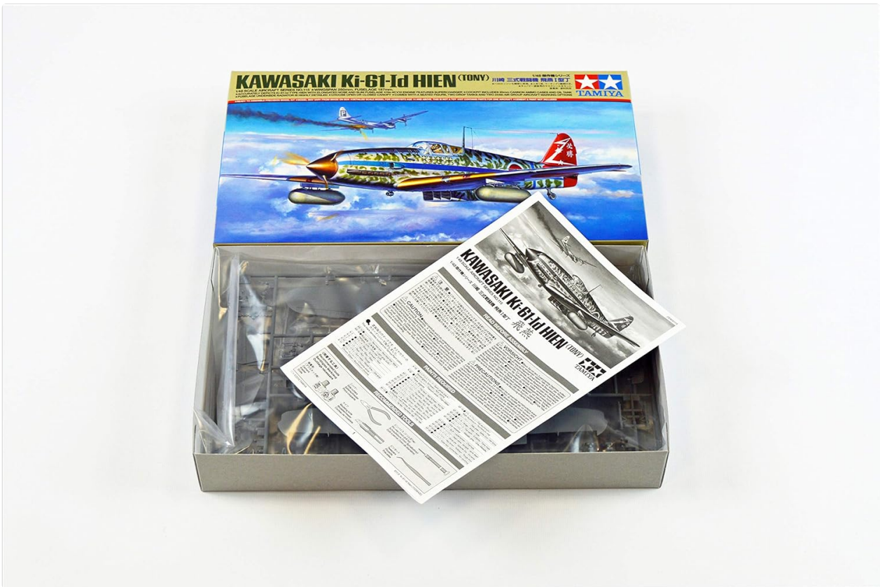
Figure 1: Contents of the Tamiya 1/48 Kawasaki KI-61-ID Hien model kit, showing sprues, decals, and the instruction manual.