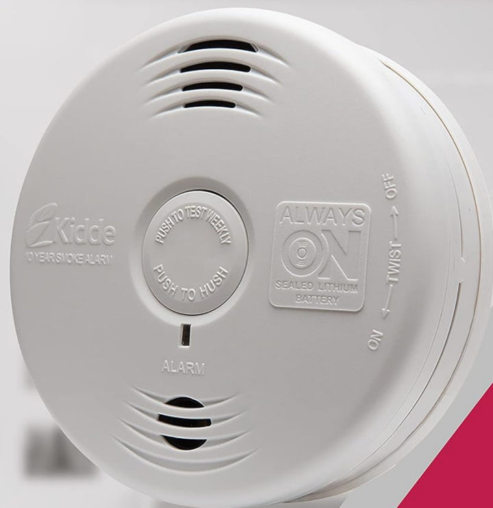
Figure 1: Front view of the Kidde P3010B Smoke Alarm.