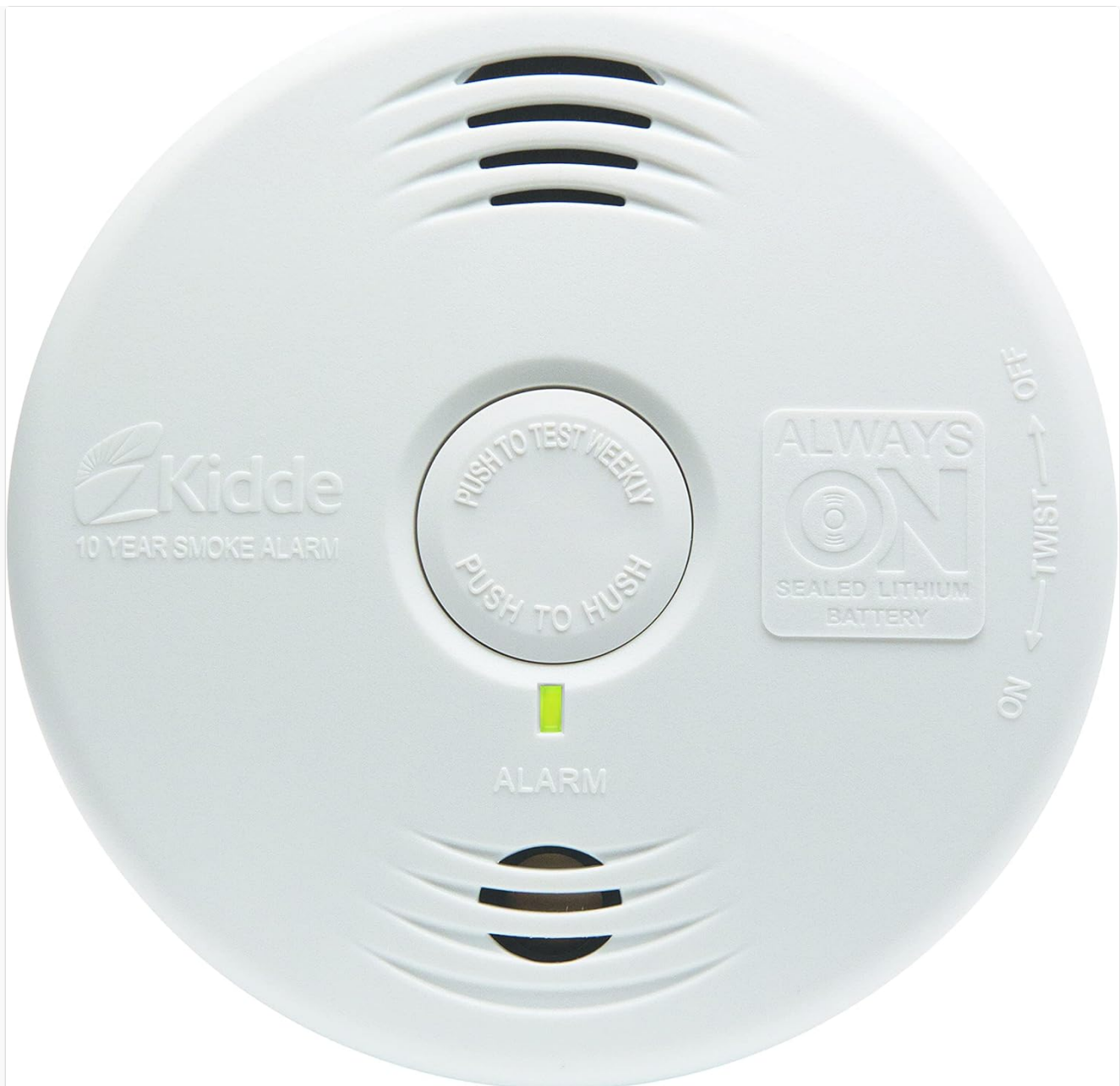
Figure 4: The Test-Hush button on the smoke alarm.