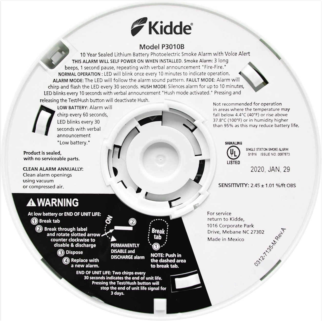
Figure 5: Detailed view of the alarm's back, including end-of-life instructions.

After approximately 10 years of operation, the alarm will emit an end-of-life chirp, indicating that the unit needs to be replaced. This chirp signifies that the battery and sensor have reached the end of their useful life. Replace the entire unit promptly.