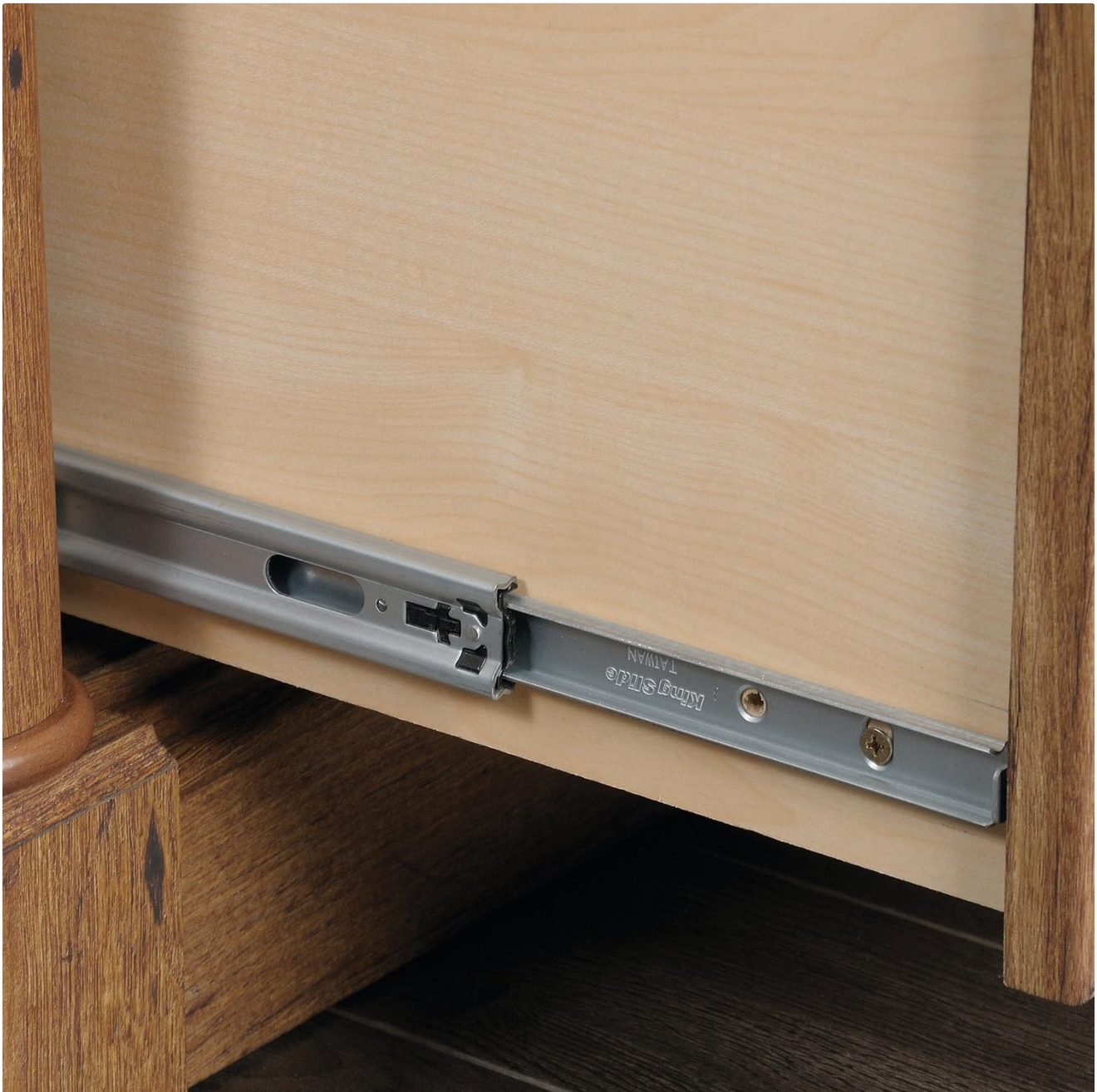
Image: A close-up of the full-extension drawer slide mechanism, illustrating its construction and smooth operation.