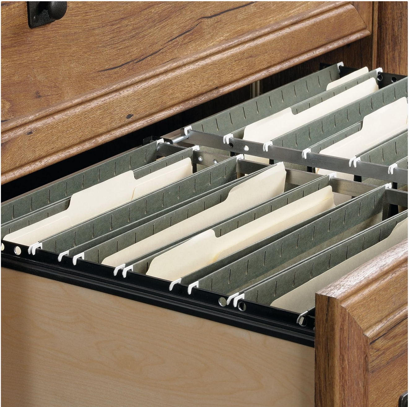
Image: A detailed view inside an open drawer, highlighting the metal rails designed to hold letter, legal, or European size hanging files.