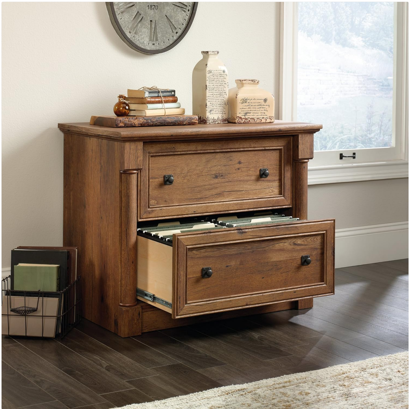
Image: The file cabinet with its top drawer partially open, revealing hanging file folders inside, demonstrating its filing capacity.