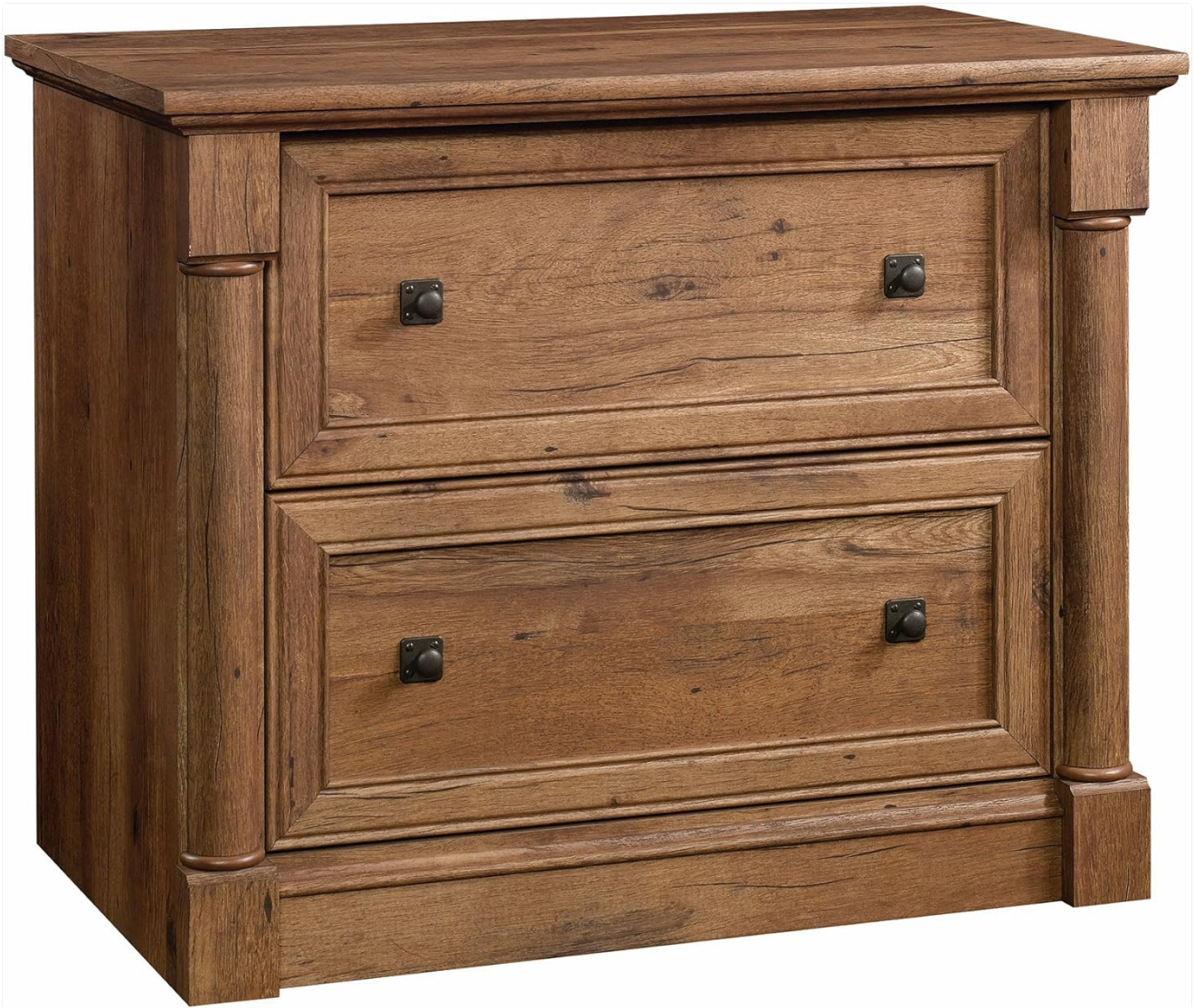
Image: The Sauder Palladia 2-Drawer Lateral File Cabinet, showcasing its Vintage Oak finish and two drawers.