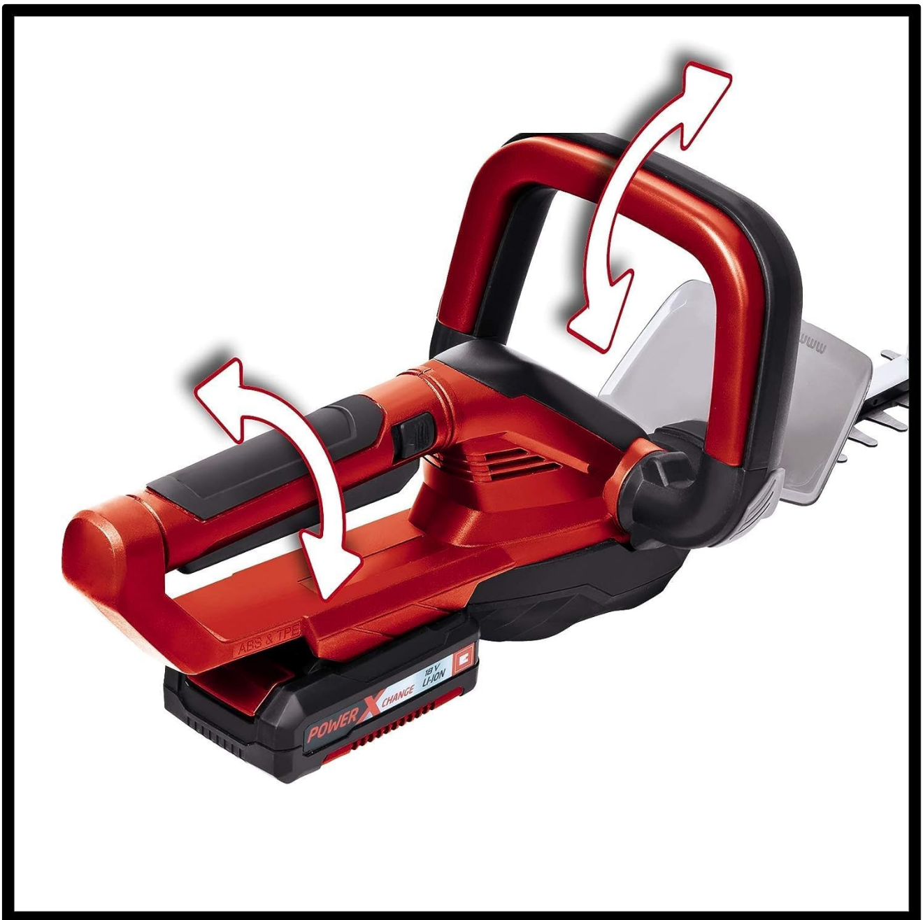
Figure 3.2: Detail of the two-hand safety switch and the rotating rear handle, allowing for comfortable vertical and horizontal cutting.