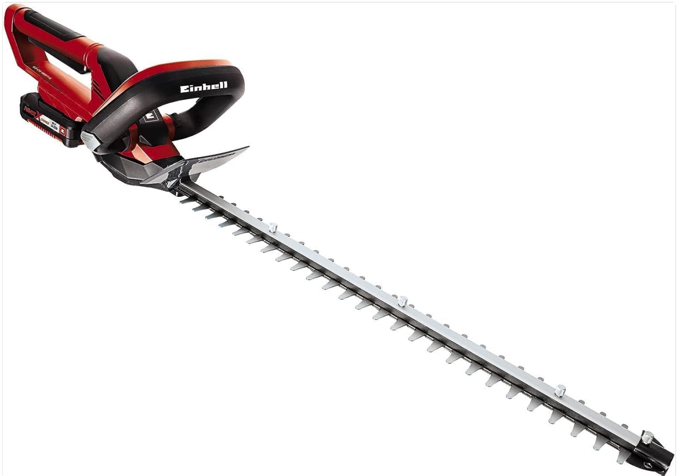
Figure 3.1: The Einhell GE-CH 1855/1 Li Cordless Hedge Trimmer, showcasing its ergonomic design and long cutting blade.

Familiarize yourself with the components of your Einhell Cordless Hedge Trimmer before operation.