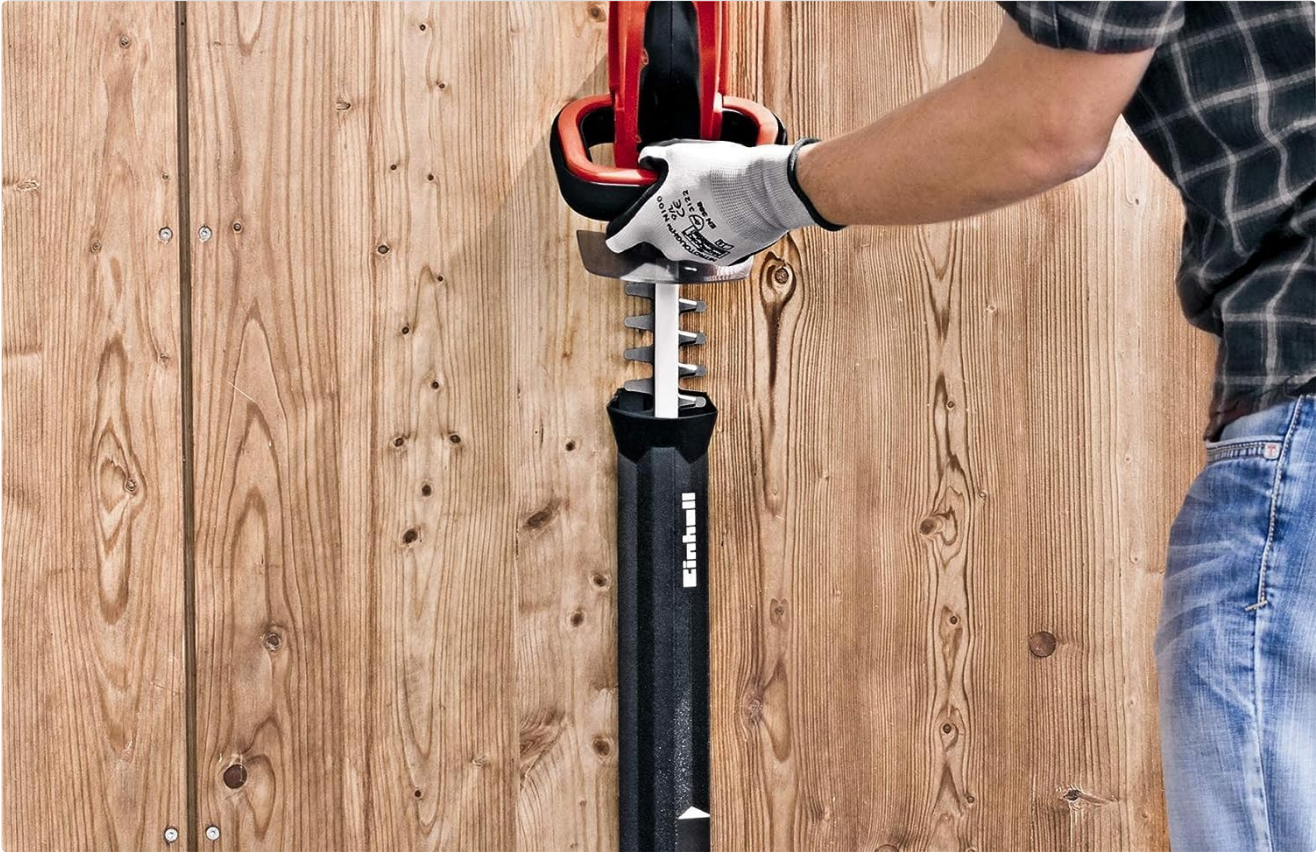
Figure 6.1: Storing the hedge trimmer using its integrated wall mount holder.