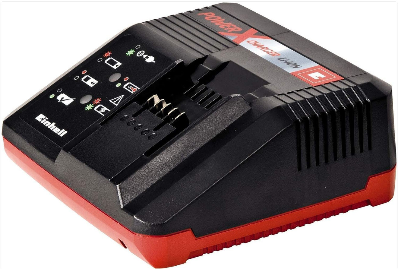
Figure 4.1: The Einhell Power X-Change Fast Charger.