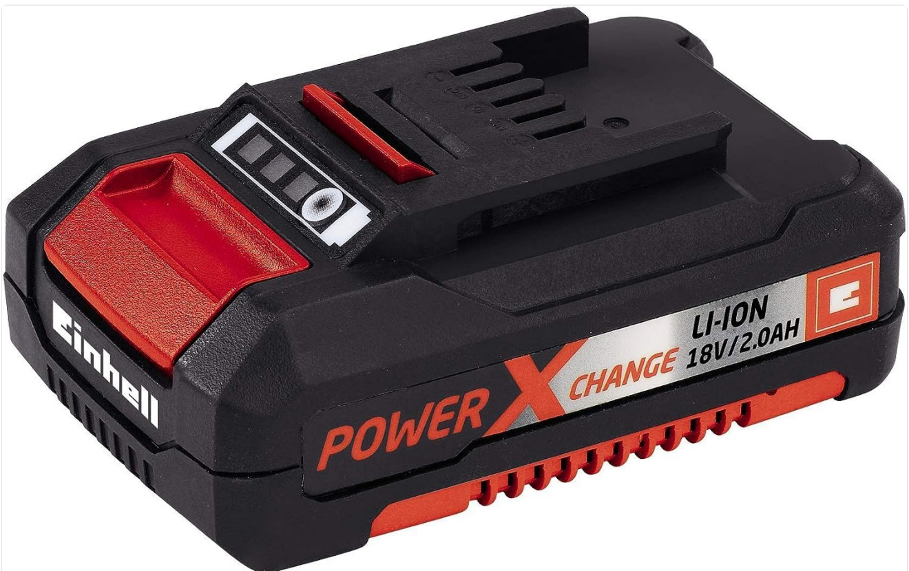
Figure 4.2: The Einhell Power X-Change 18V Lithium-Ion Battery.