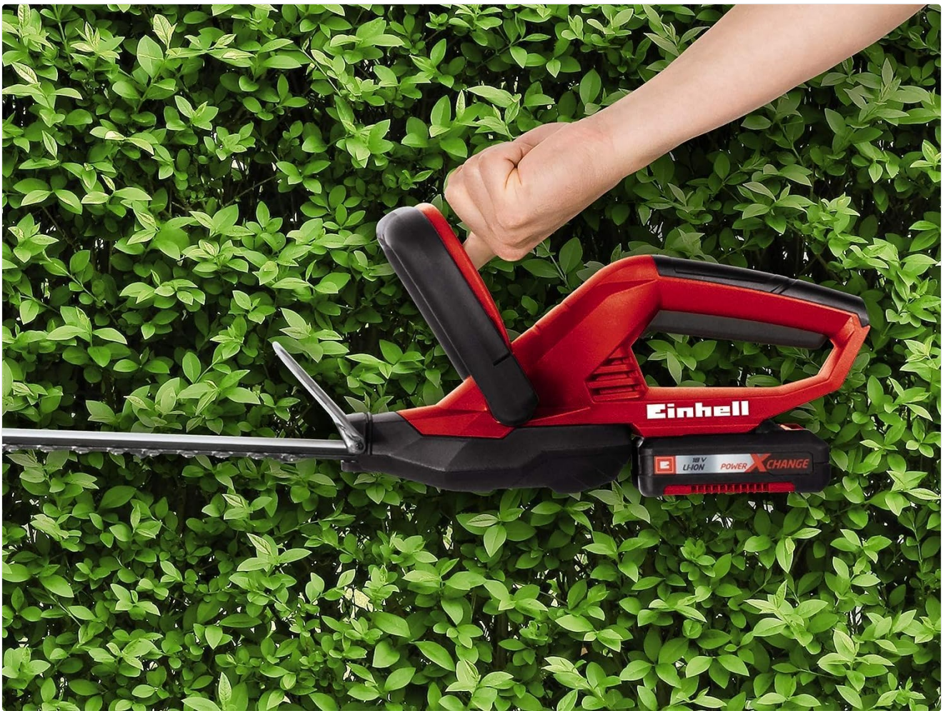
Figure 5.1: Proper technique for trimming a hedge with the Einhell cordless hedge trimmer.