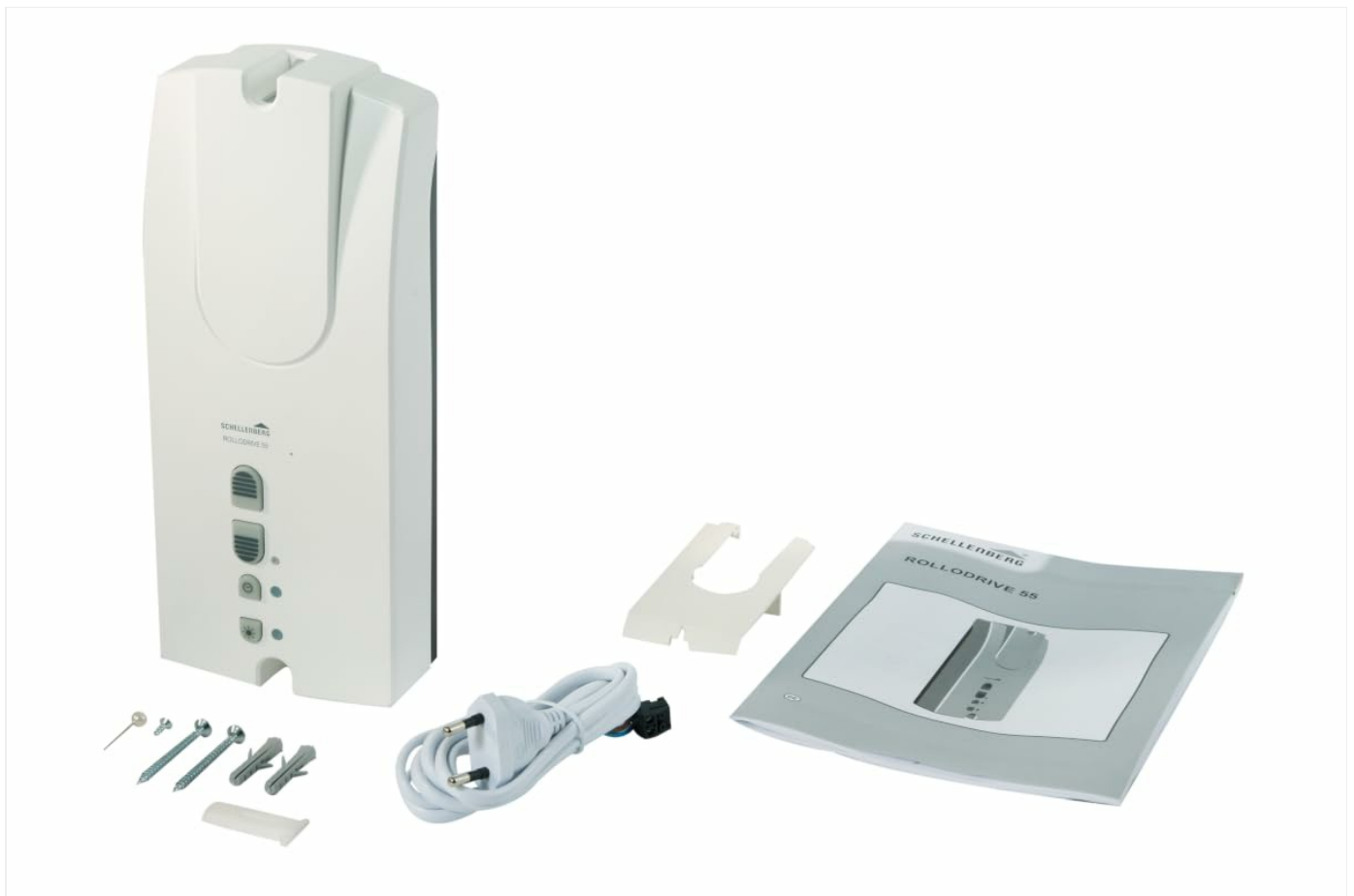
Image: Contents of the Rollodrive 55 package, including the winder unit, power cable, adapters, and mounting hardware.