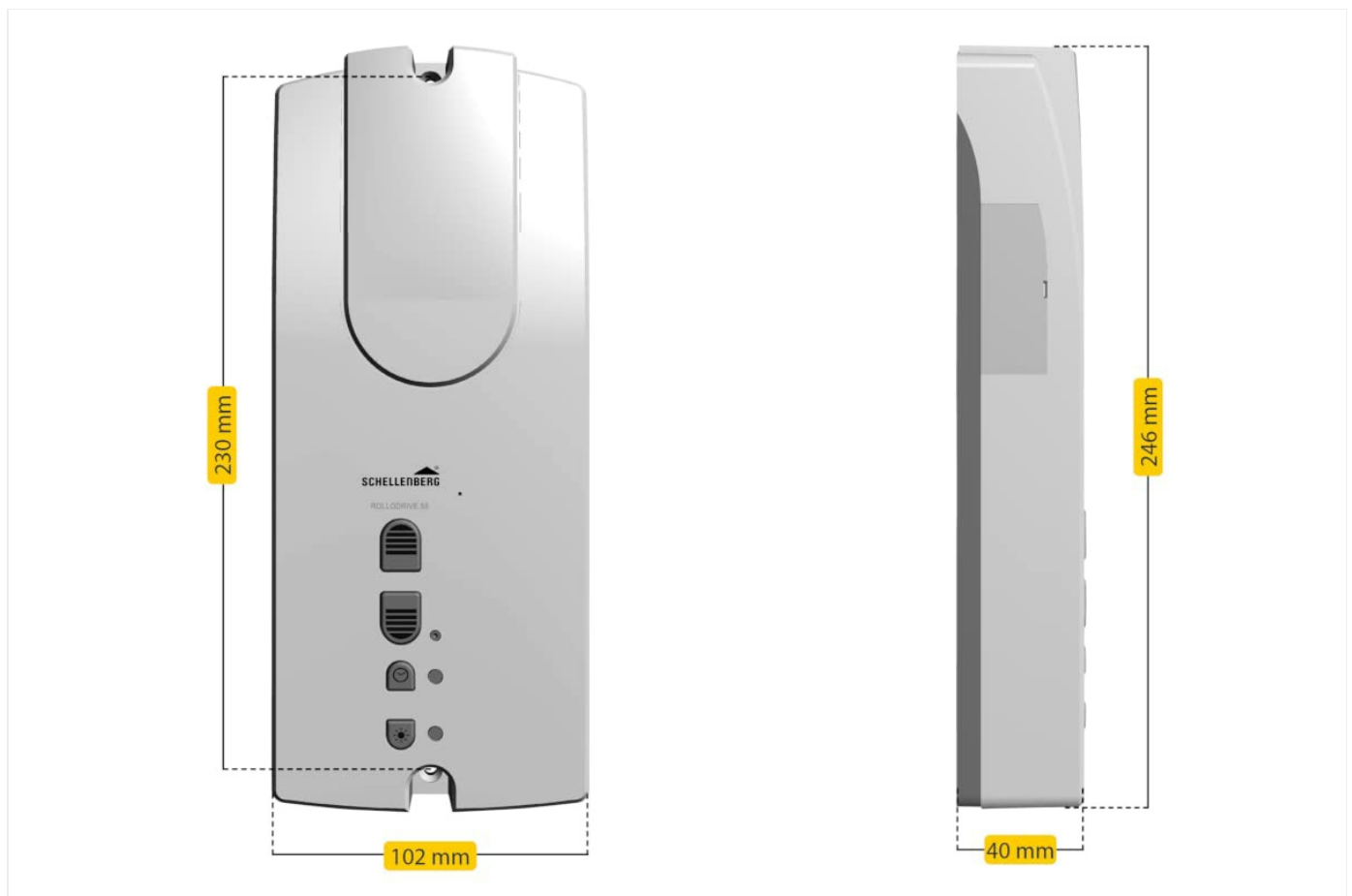
Image: Technical drawing showing the dimensions of the Rollodrive 55, including a 230 mm hole spacing.