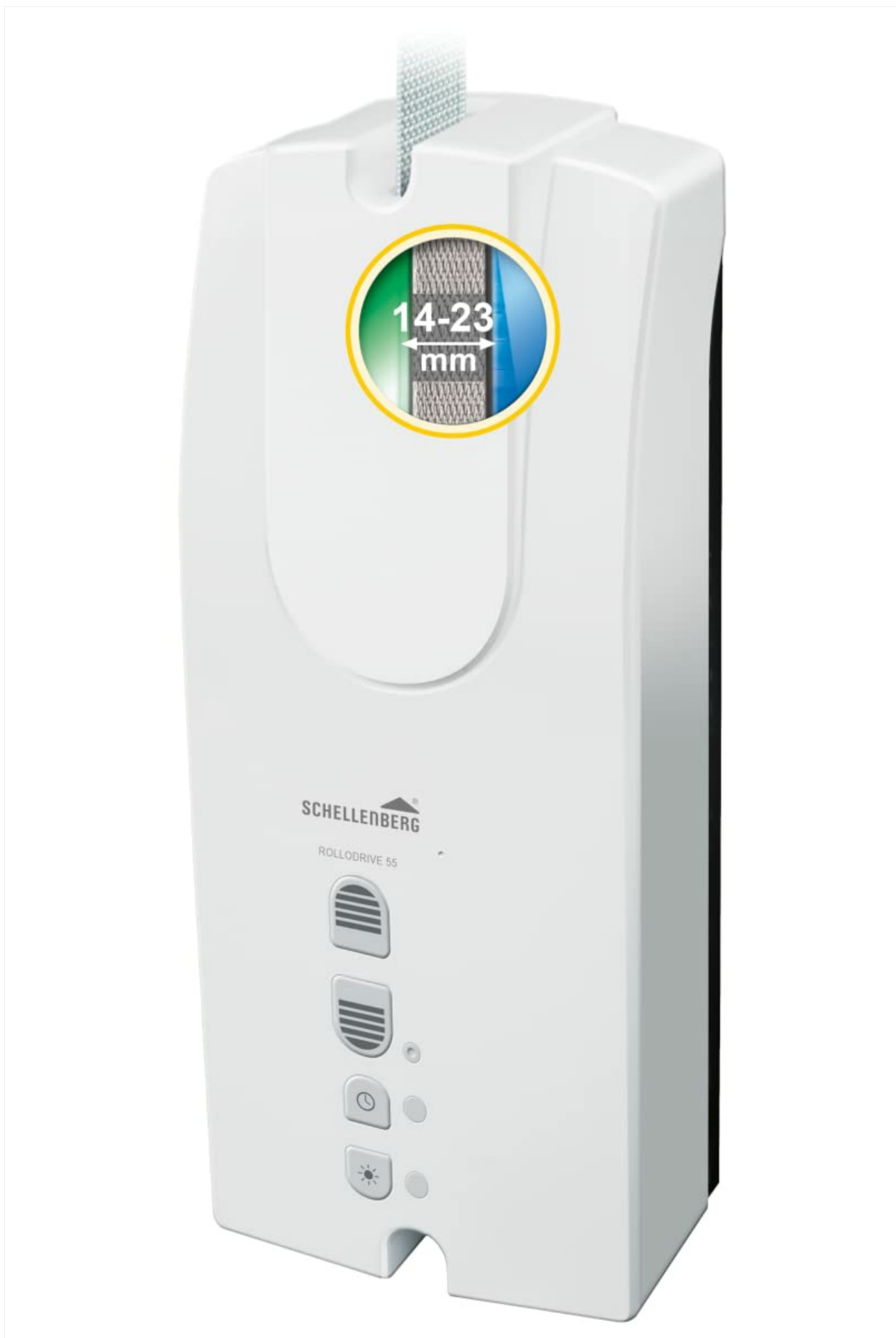
Image: Front view of the Rolldrive 55, highlighting compatibility with 14-23 mm strap widths.