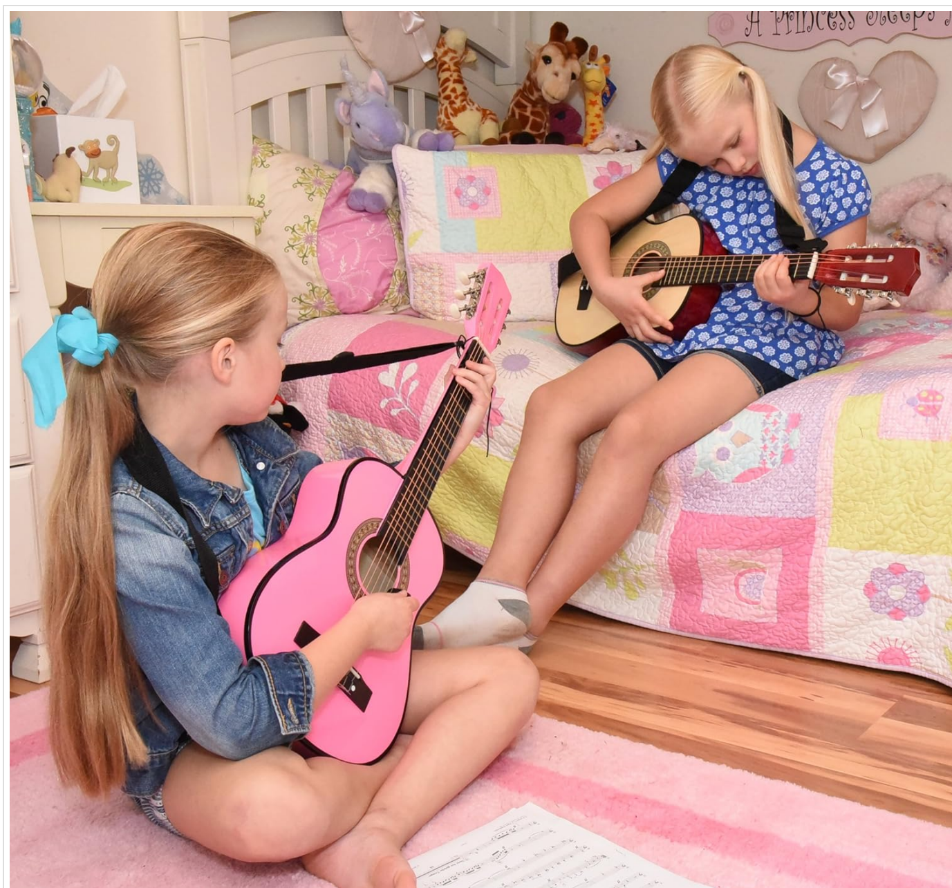
Figure 5: Children learning to play classical guitars.