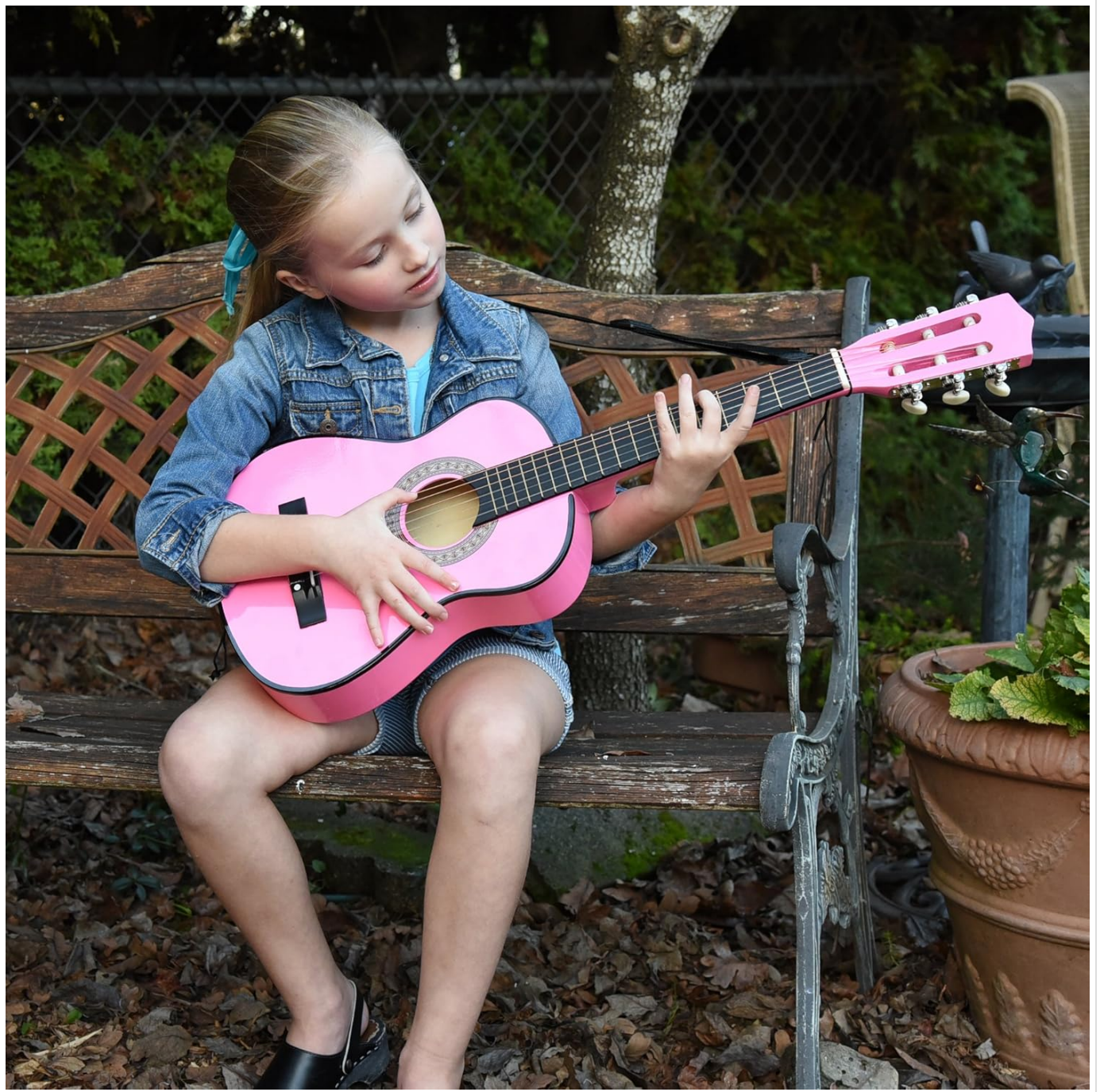
Figure 4: Example of a comfortable playing posture.