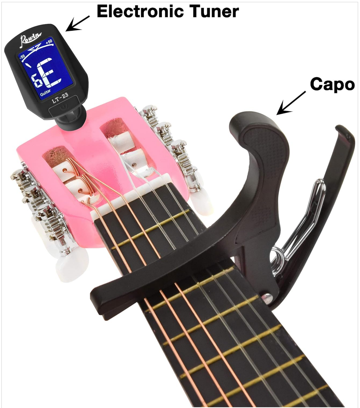
Figure 2: Proper placement of the electronic tuner on the headstock and the capo on the fretboard.