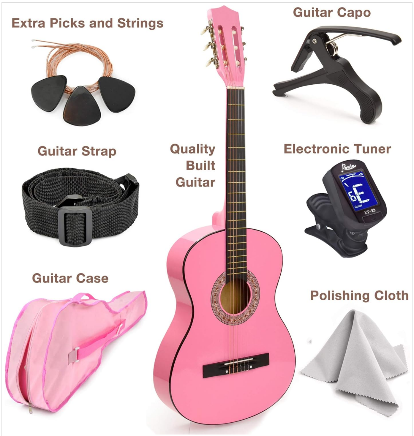
Figure 1: Included accessories with the Master Play 30-inch Classical Guitar.