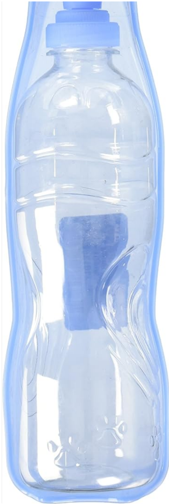
Image 1: The PAWISE Portable Pet Water Bottle in its compact, folded state, ready for transport. The clear bottle is encased in a light blue plastic holder with a loop at the top for carrying.