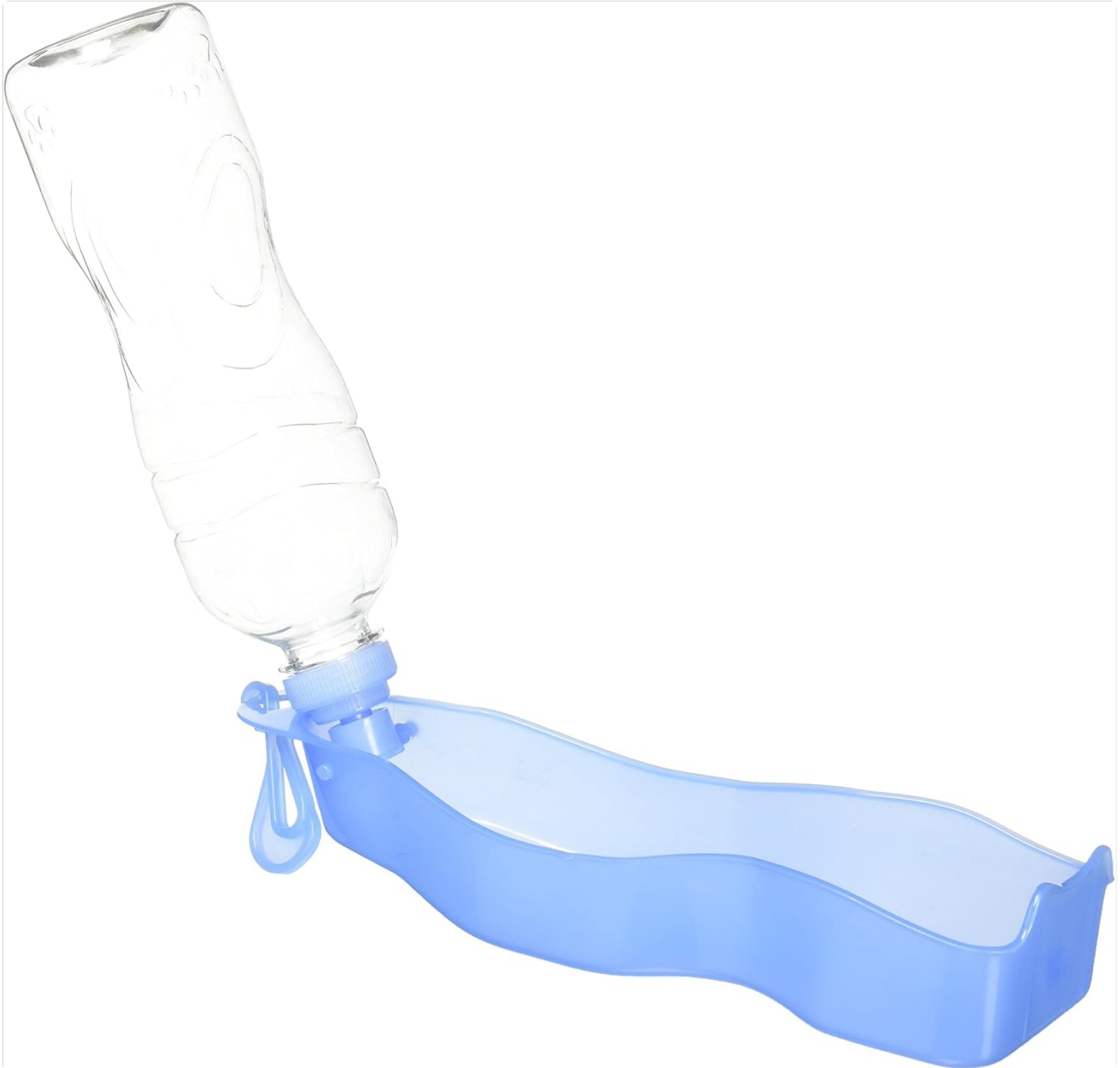
Image 2: The PAWISE Portable Pet Water Bottle unfolded, showing the clear water bottle tilted into the light blue trough-shaped bowl, ready for a pet to drink.