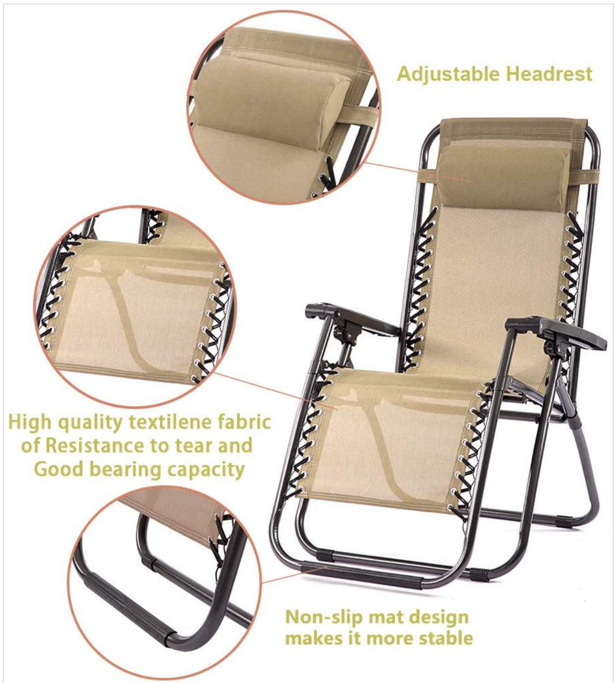
Figure 3: Detailed view of chair features, including the adjustable headrest and fabric.