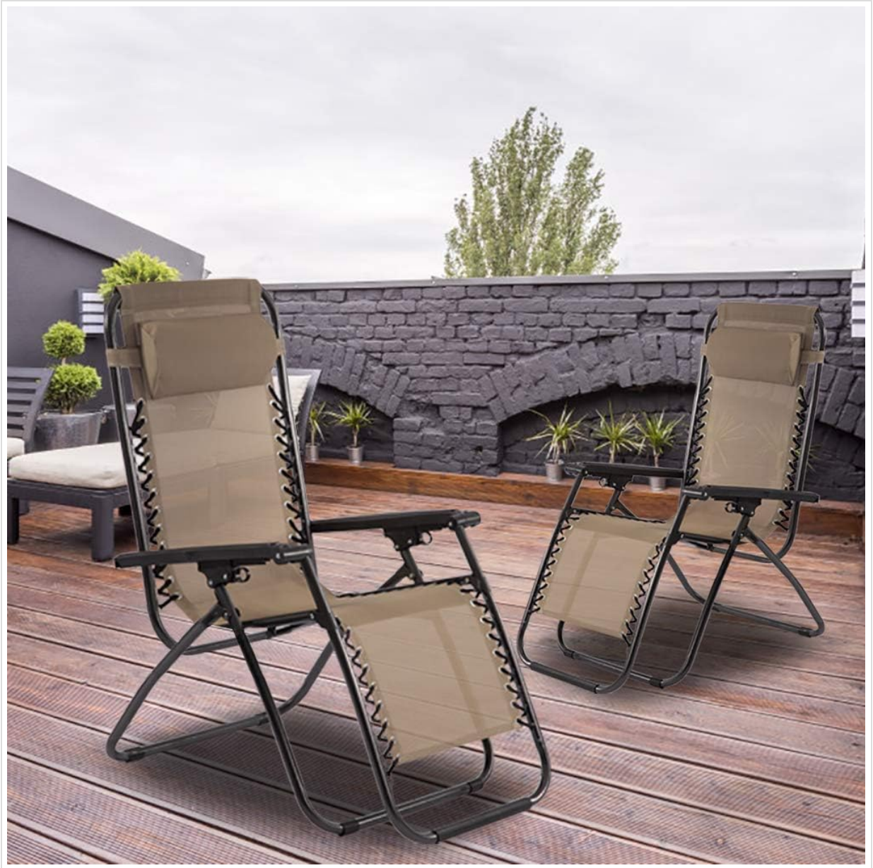
Figure 1: Two FDW Zero Gravity Chairs ready for use on a patio.