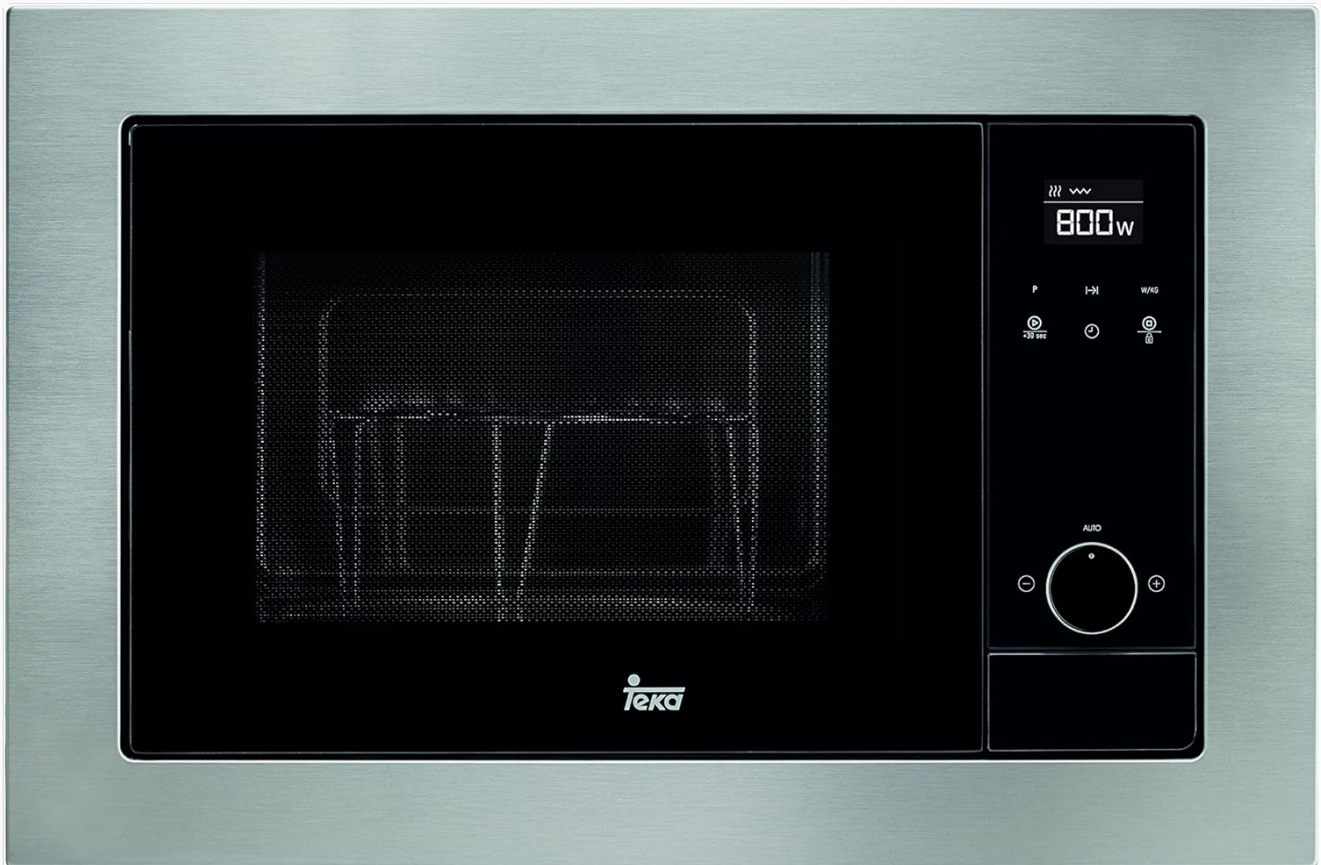
Image: Front view of the Teka MS 620 BIS integrated microwave with grill, showing the control panel on the right and the oven door with a visible interior rack.