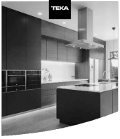
User Manual MS 620 BIS, ML 820 BIS, ML 8200 BIS PL, RU, RO, TR

Kompletna instrukcja obsługi dla kuchenek mikrofalowych Teka MS 620 BIS, ML 820 BIS i ML 8200 BIS. Zawiera informacje o bezpieczeństwie, funkcjach, obsłudze, konserwacji i rozwiązywaniu problemów.