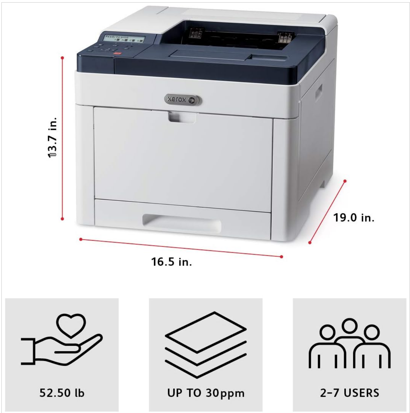
Figure 2: Key dimensions of the Xerox Phaser 6510/DN printer.