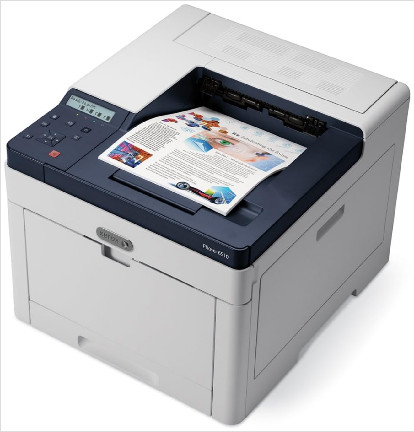
Figure 1: Front view of the Xerox Phaser 6510/DN Color Printer.

to your computer or network. Follow the on-screen prompts on the printer's display for initial configuration, including language and network settings. Install the toner cartridges as described in the Maintenance section.