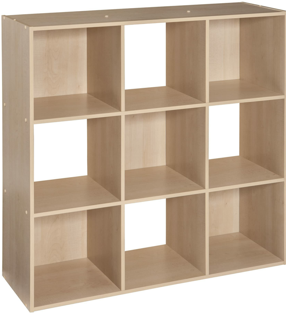
Image: The ClosetMaid Cubeicals 9-Cube Storage Shelf Organizer in Birch finish, showcasing its use for storing books and fabric bins in a living space.