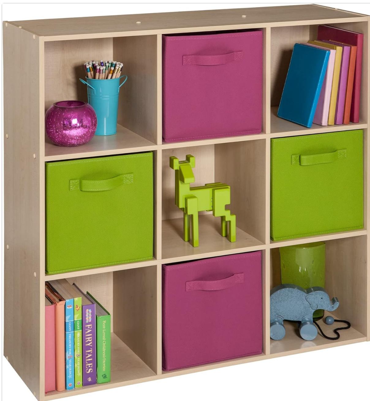
Image: The 9-Cube Organizer integrated into a room setting, demonstrating its capacity for various items including books, decor, and storage bins.