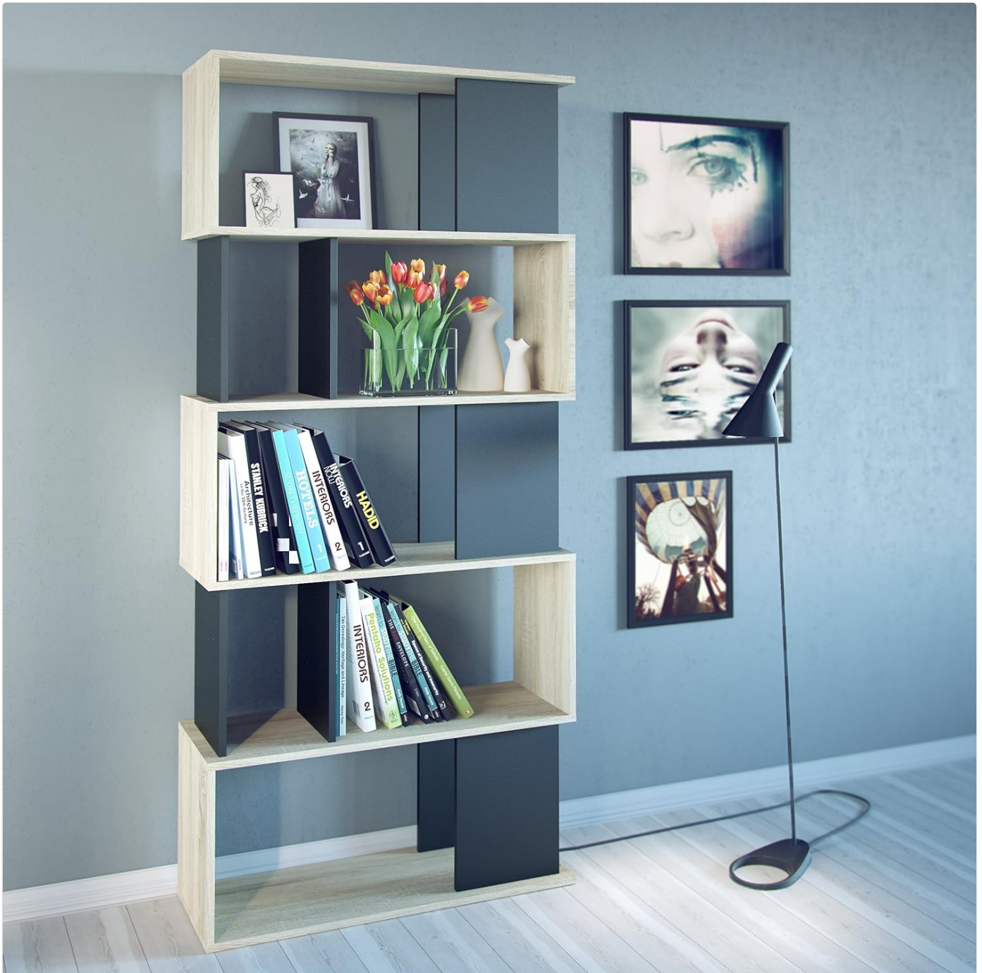
Image: Front view of the assembled bookcase, illustrating its seven shelves and unique S-shape.