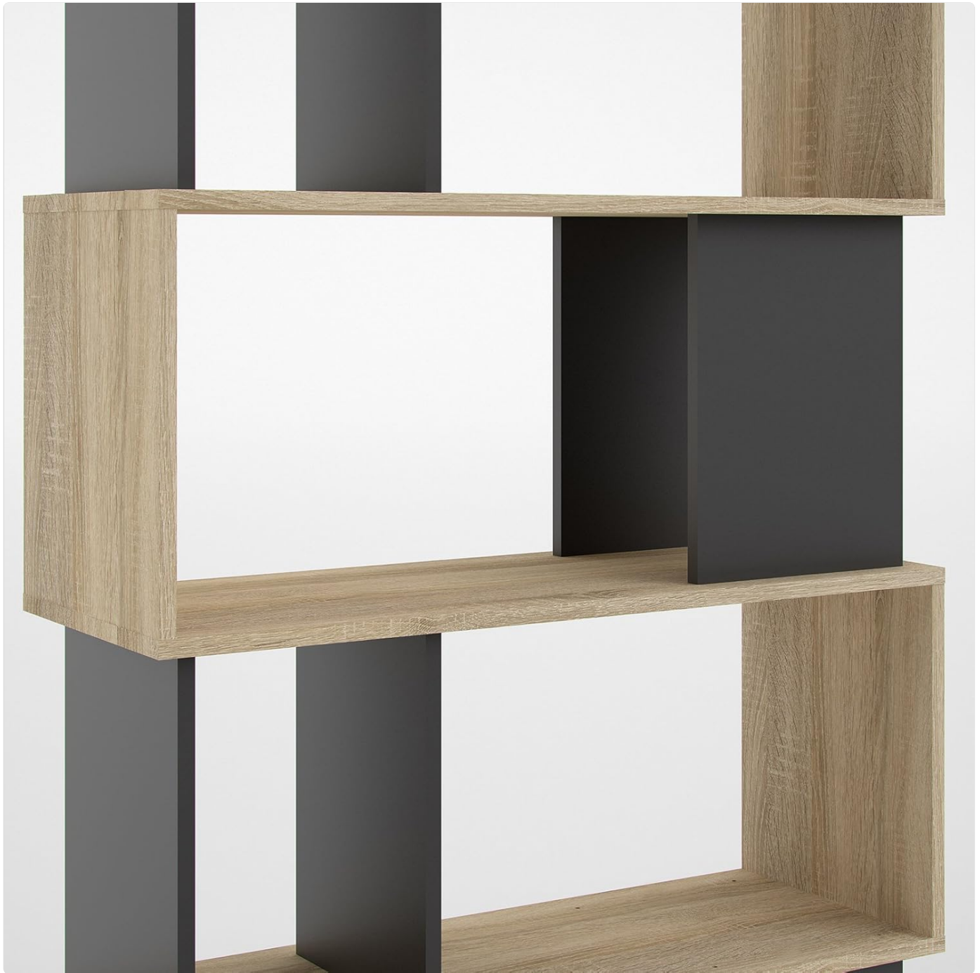
Image: A detailed view of the shelves, demonstrating the construction and space available for items.