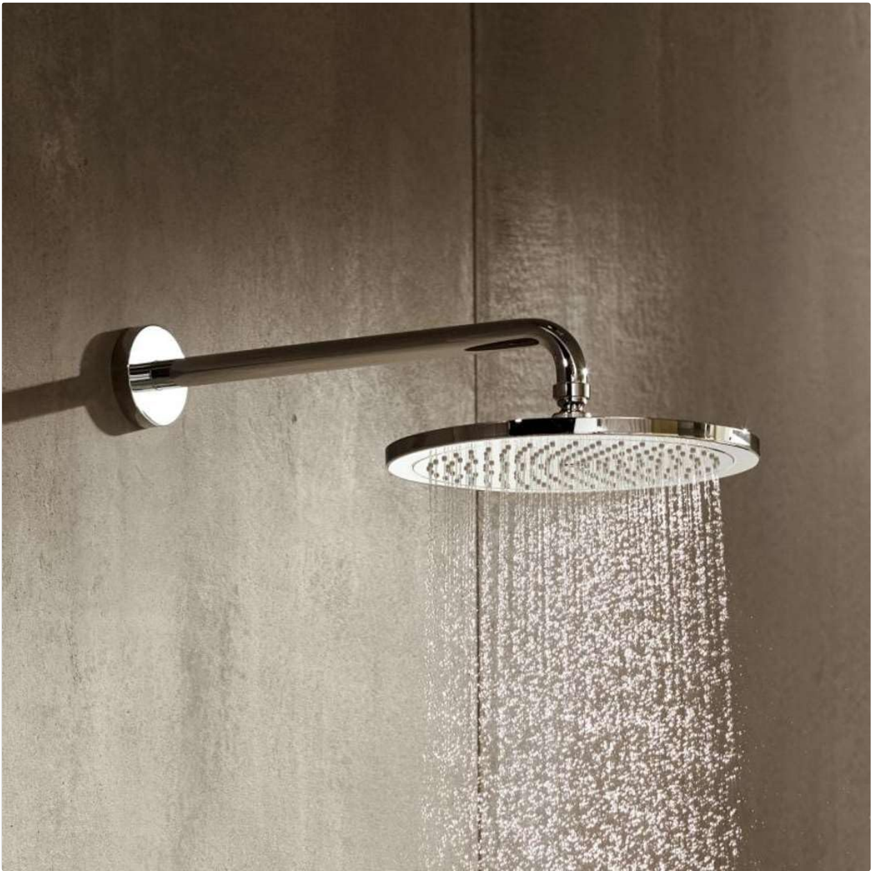
The hansgrohe Cromo 280 Air Overhead Shower in operation, delivering a wide, even spray of water from a wall-mounted arm.