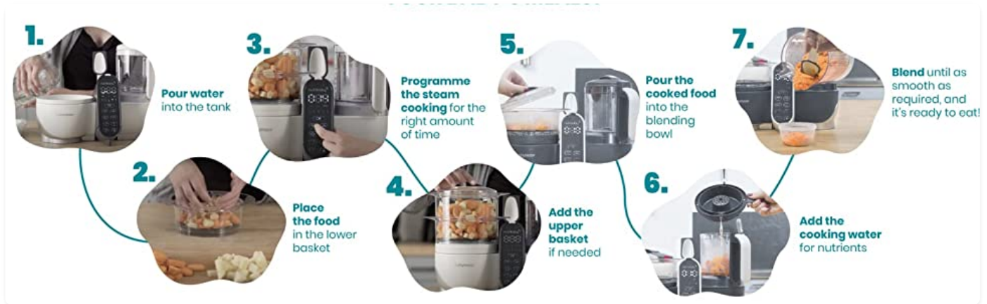
Image: A visual guide illustrating the 7-step process of preparing baby food with the Nutribaby Plus, from adding water to blending.