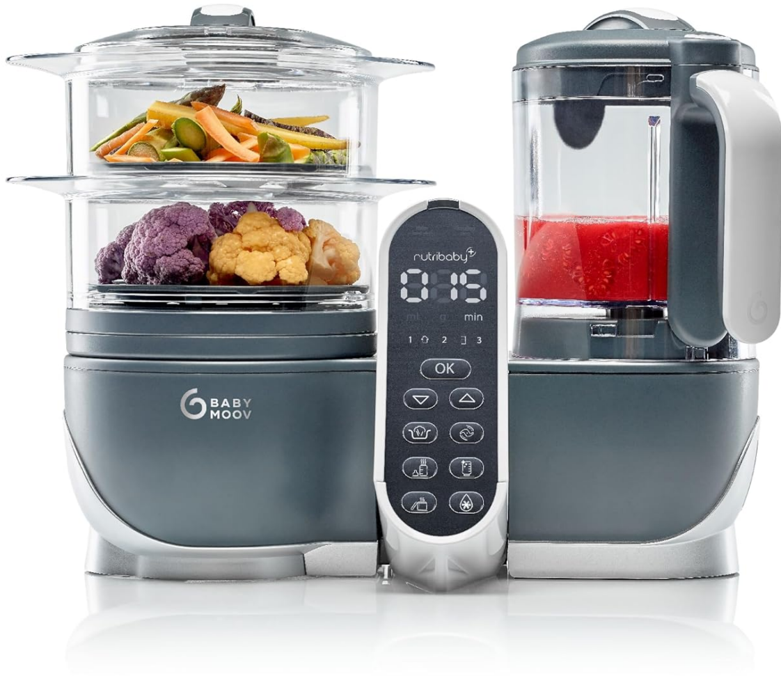
Image: The Babymoov Nutribaby Plus, showcasing its steaming and blending capabilities with fresh ingredients.