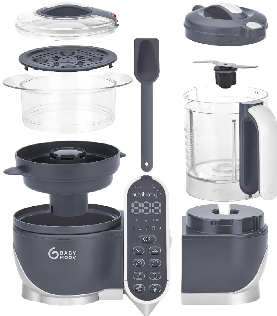
Image: An exploded diagram showing all the detachable parts of the Nutribaby Plus, including baskets, lids, blending unit, and spatula, for easy assembly and cleaning.

6. Power Connection: Connect the power cord to the unit and then plug it into a suitable electrical outlet (230V).