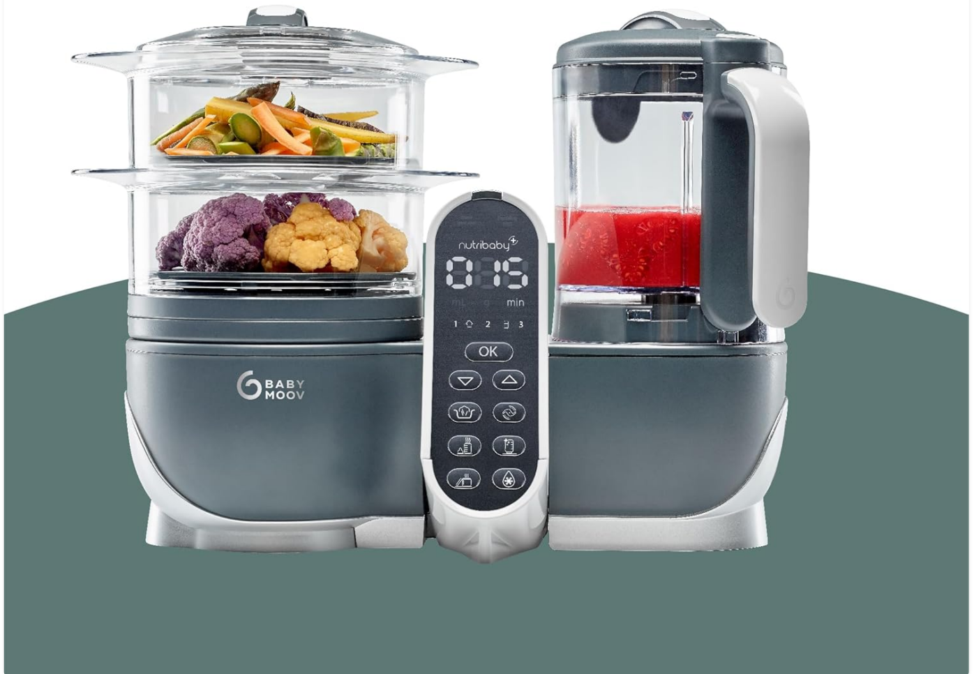
Image: Visual representation of the Nutribaby Plus emphasizing its six distinct functions.