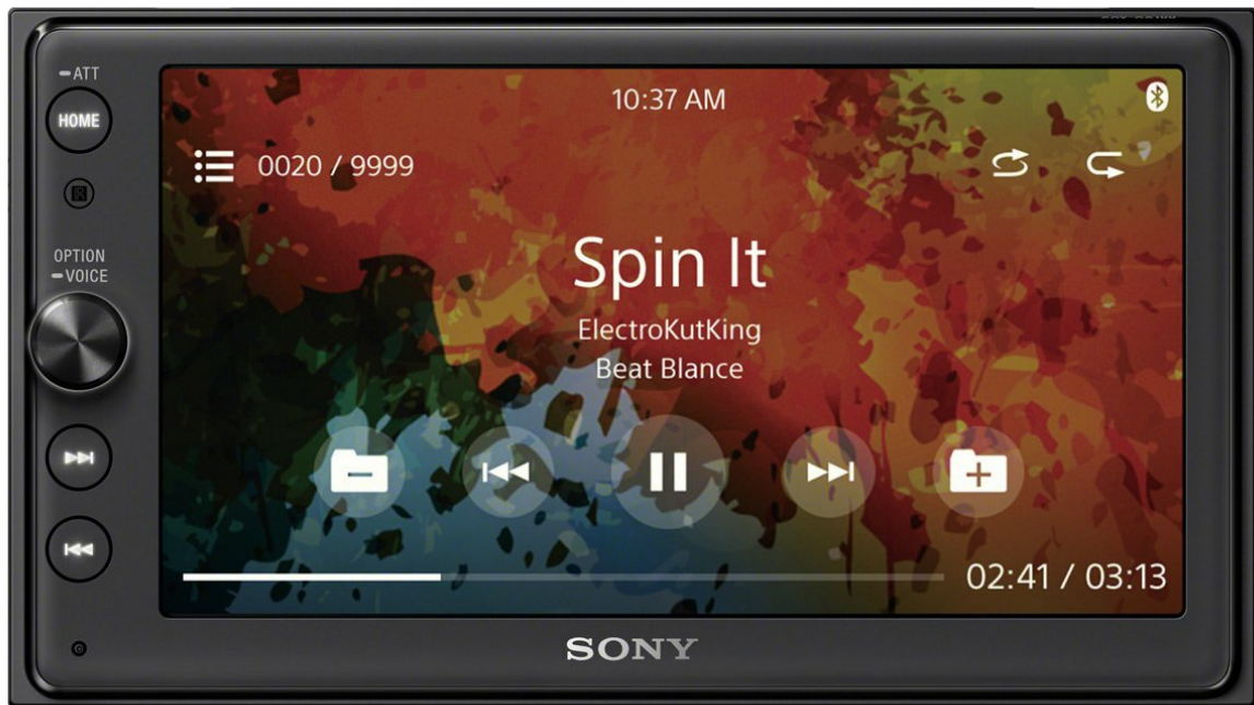
Figure 2.1: Front view of the Sony XAV-AX100 Media Receiver.