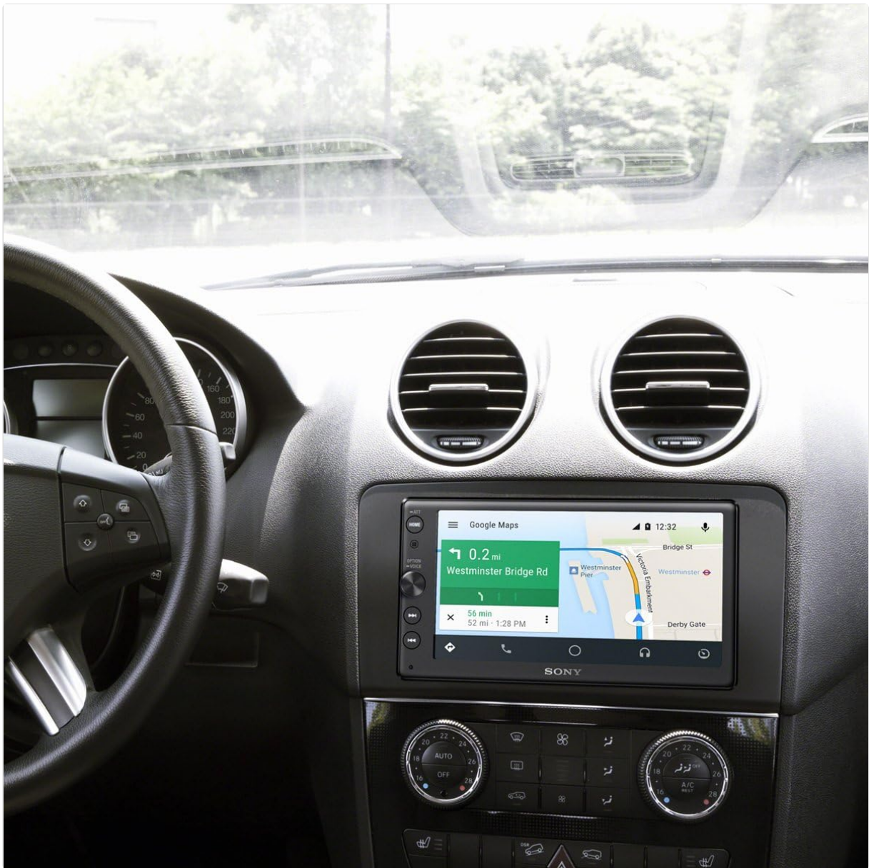
Figure 4.1: Interacting with the touchscreen interface.