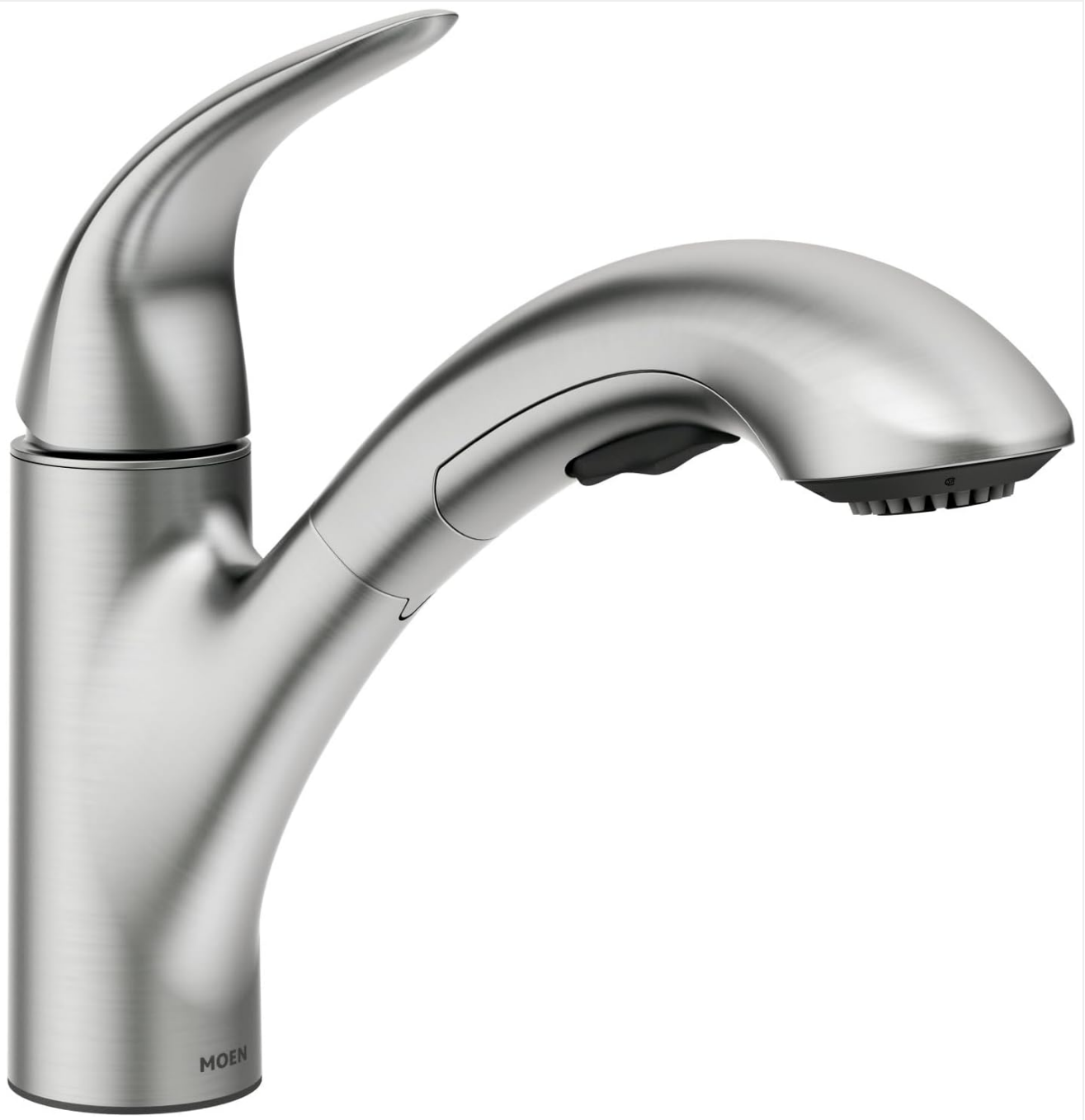
Figure 1: Moen Medina One-Handle Pull Out Kitchen Faucet.