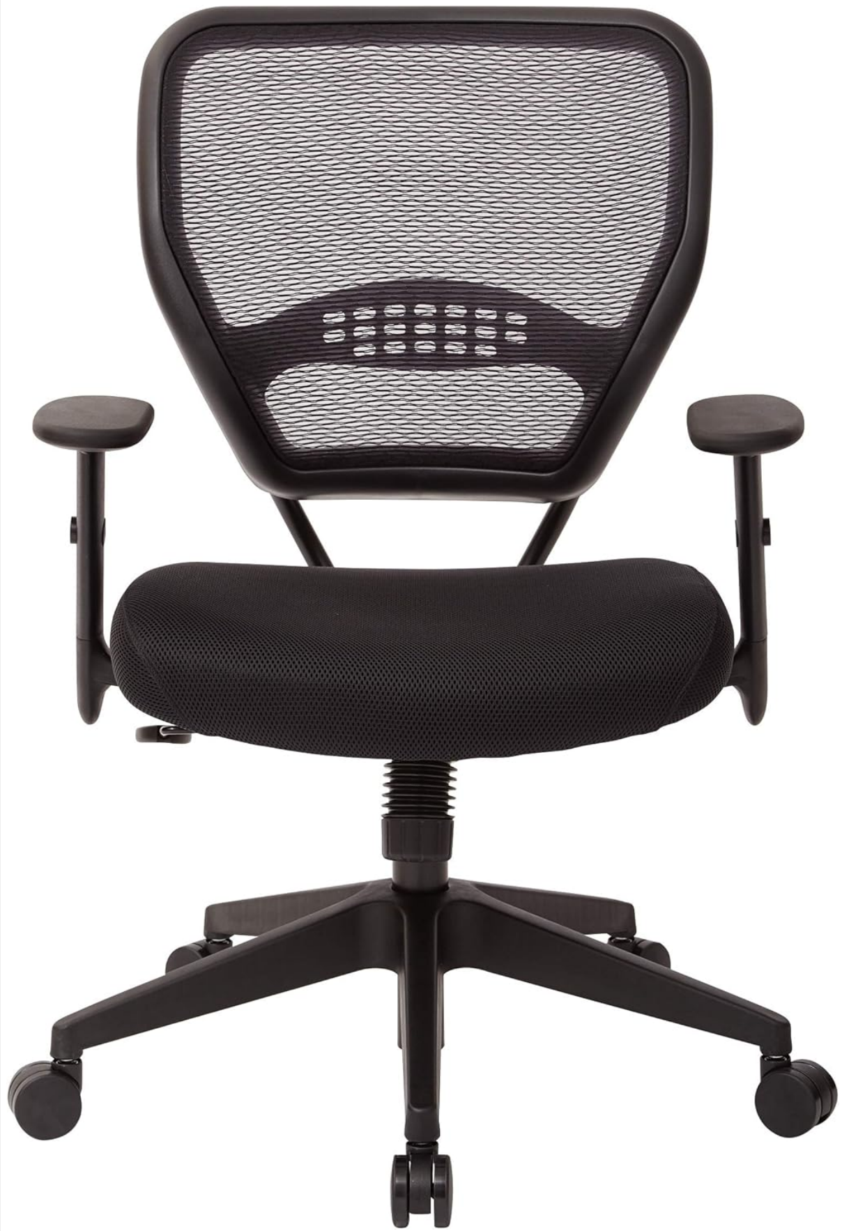
Image: A detailed view of the breathable black Air Grid mesh backrest, emphasizing its texture and design.