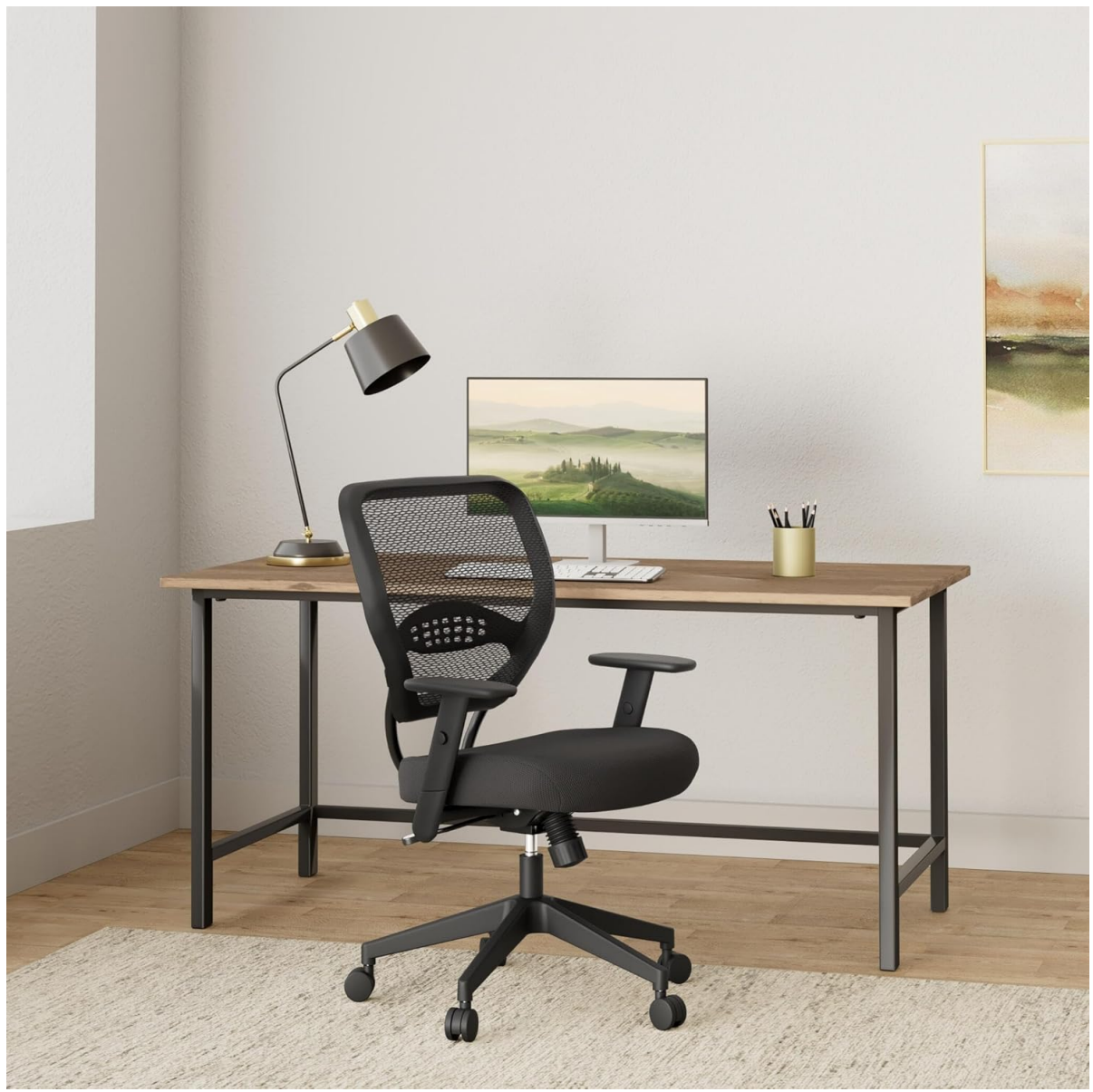
Image: The Space Seating 55 Series office chair, black mesh back and seat, positioned at a desk in an office environment.