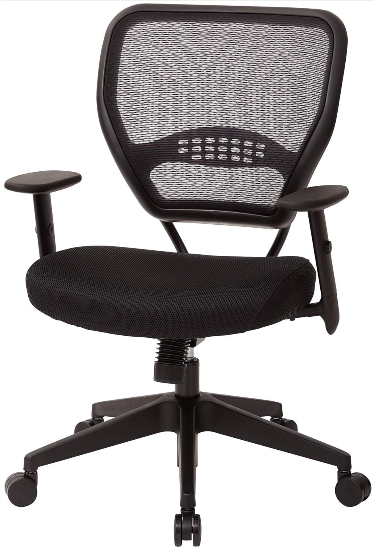
Image: A side view of the chair highlighting the various adjustment levers and knobs for seat height, armrest height, and tilt control.

function, push the lever on the left side beneath the seat (opposite the height adjustment lever) in or out. Pushing it in locks the backrest in an upright position, while pulling it out allows for reclining. The tilt tension knob, usually located at the front center under the seat, can be rotated to increase or decrease the resistance of the recline.