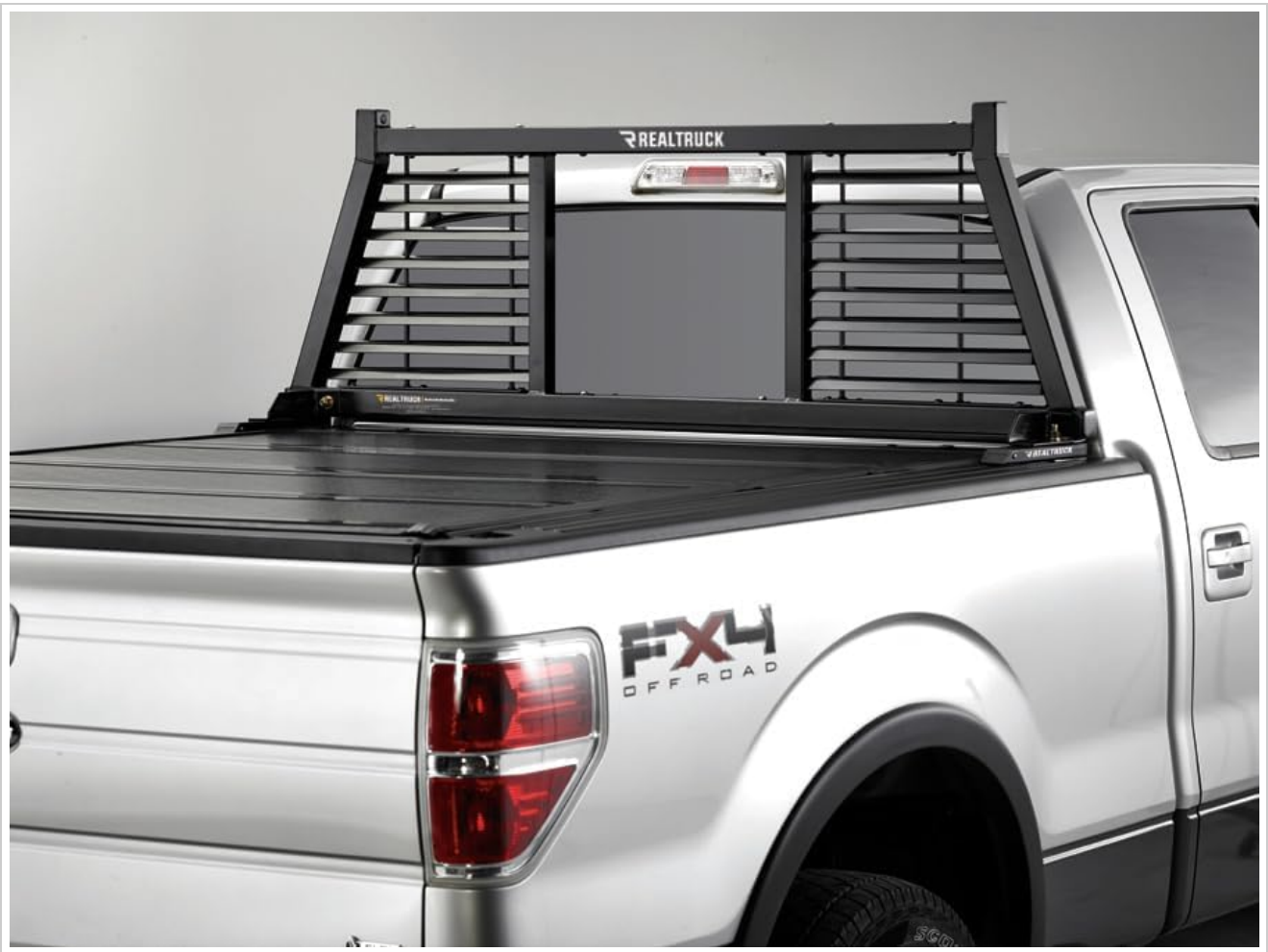
Image 5.1: RealTruck Backrack Half Louvered Rack installed on a truck bed with a tonneau cover.