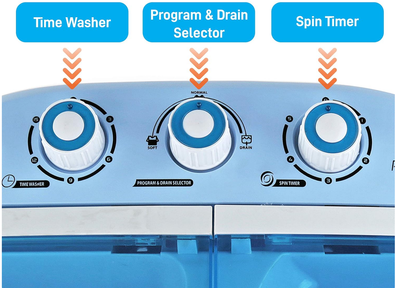
Image: A detailed view of the control panel, highlighting the three rotary knobs: 'Time Washer', 'Program & Drain Selector', and 'Spin Timer'. These controls are used to manage the washing and drying cycles.

Separate timer control settings for washer and spinner