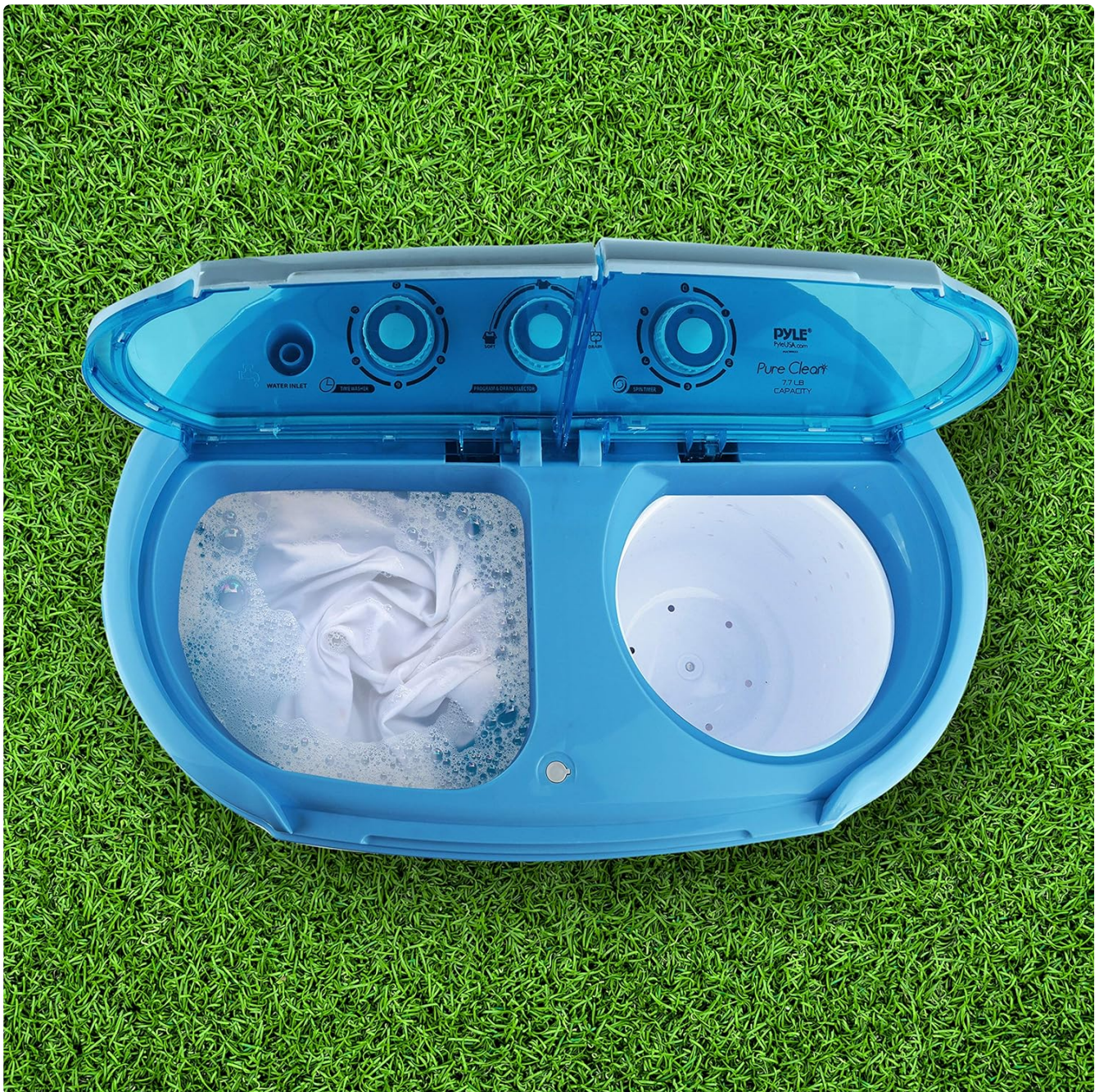
Image: A top-down view of the washing machine in operation, showing clothes being agitated in the wash tub. This illustrates the active washing process.