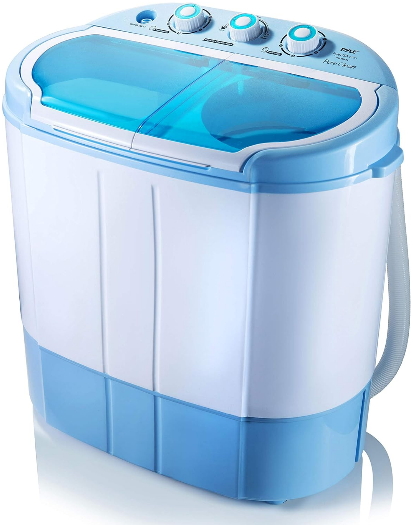
Image: The Pyle Portable 2-in-1 Washing Machine and Spin-Dryer. This compact unit features a blue and white design with two top-loading compartments for washing and spin-drying.