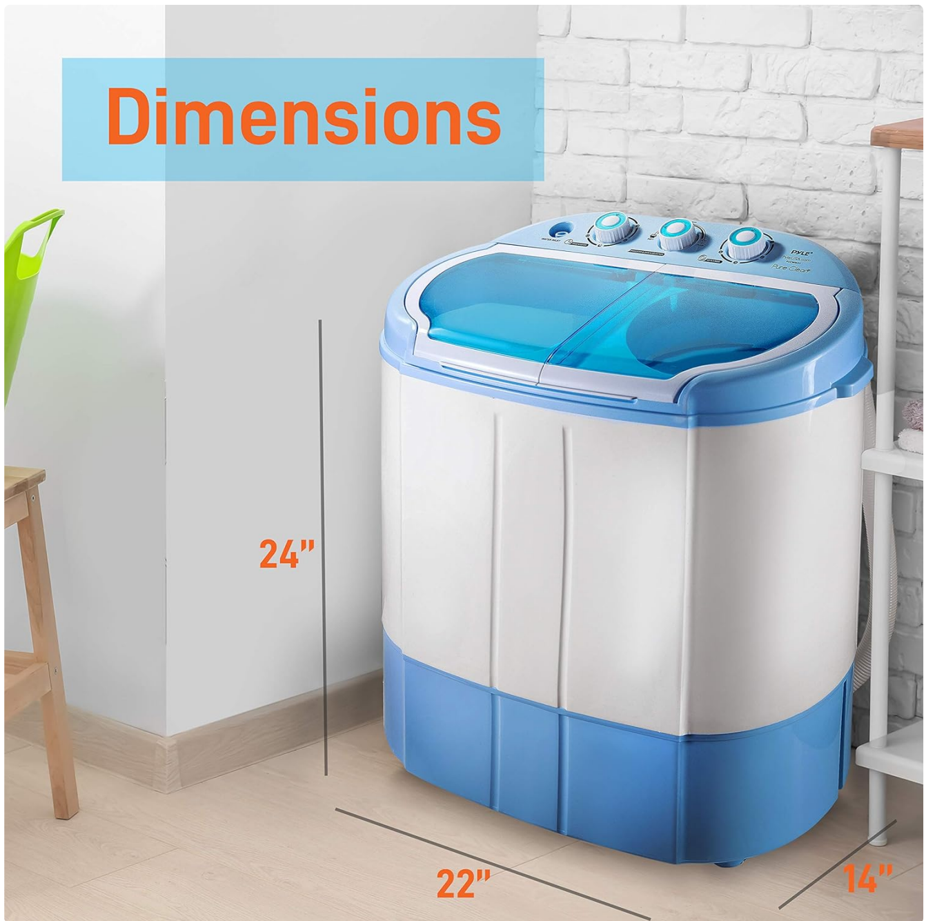
Image: A visual representation of the washing machine's dimensions, indicating its height (24 inches), width (22 inches), and depth (14 inches). This helps in planning placement.