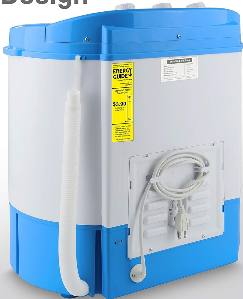
Image: The back of the washing machine, highlighting its energy efficiency label and the location of the drainage hose, which is crucial for proper water disposal.