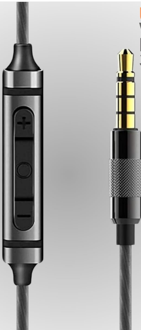
Image: Detailed view of the in-line microphone and volume control unit on the earphone cable.