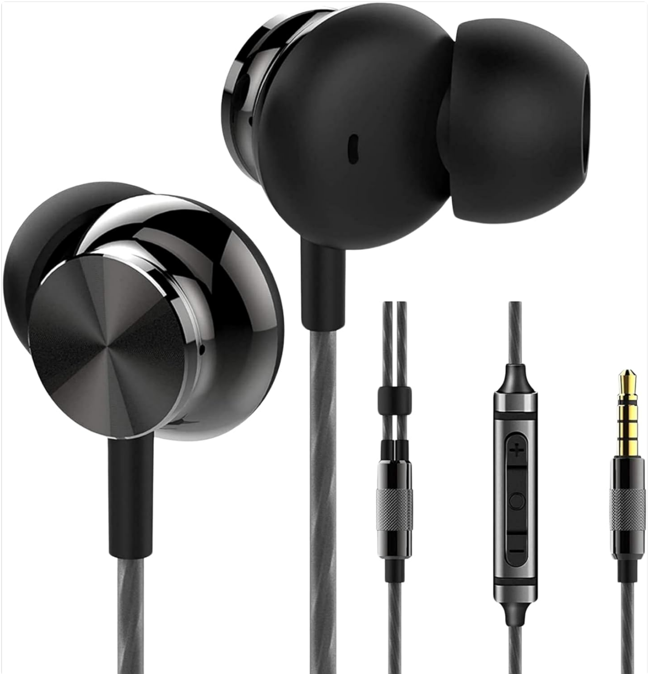
Image: The Betron BS10 Earphones, showcasing their sleek black design with metallic accents.