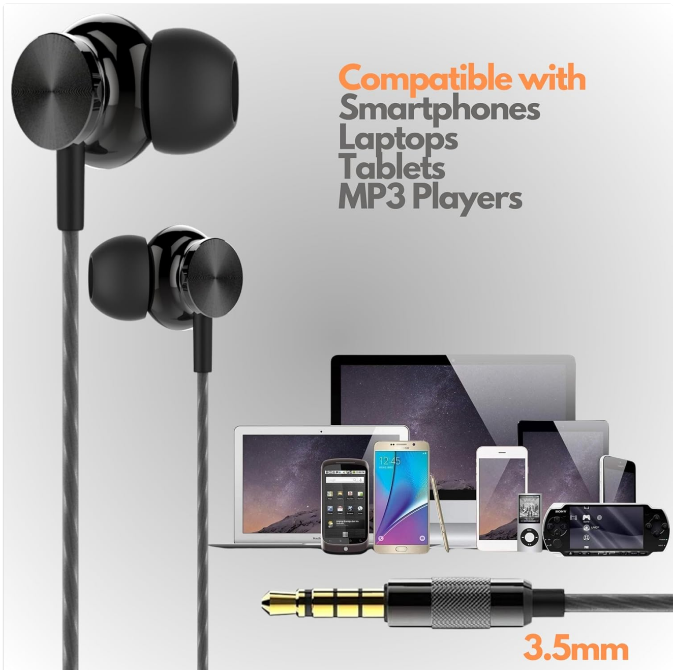
Image: The 3.5mm audio jack of the Betron BS10 Earphones shown alongside various compatible devices like smartphones, tablets, and laptops.