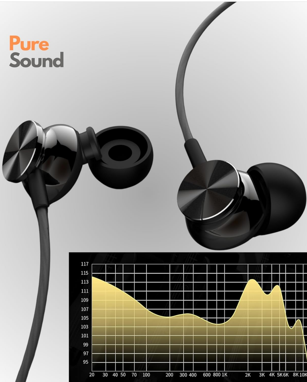
Image: Betron BS10 Earbuds with different sized ear tips, highlighting their noise-isolating design.