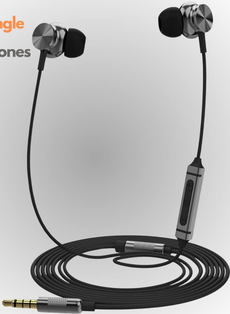
Image: The Betron BS10 Earphones demonstrating their anti-tangle cable design.