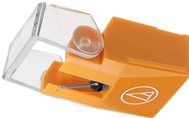
Image 1: The Audio-Technica VMN30EN Elliptical Nude Replacement Turntable Stylus. This image displays the stylus unit, which is orange with a clear protective cover, designed for precise audio reproduction from vinyl records.