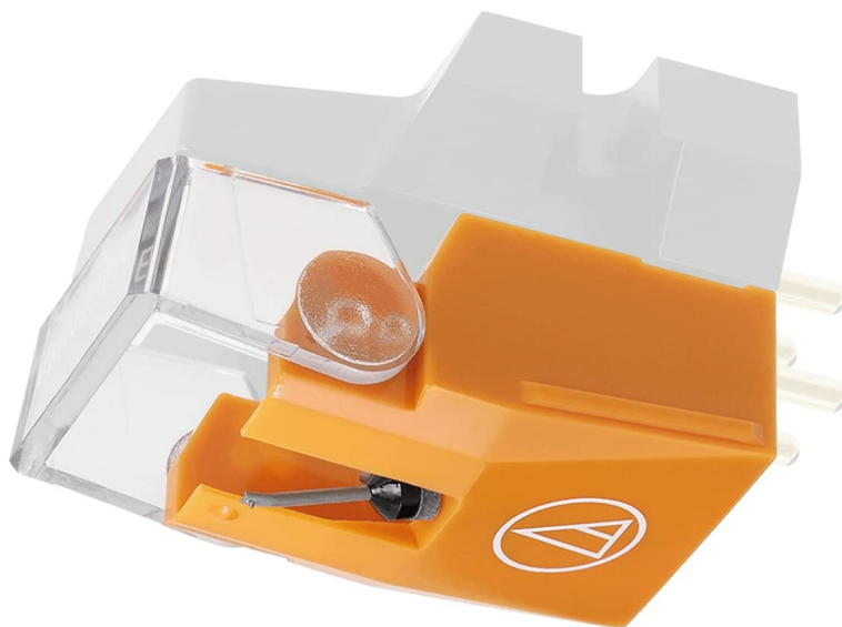
Image 3: A rear view of the VMN30EN stylus, showing the connection points that integrate with the cartridge body. This perspective is useful for understanding the installation mechanism.