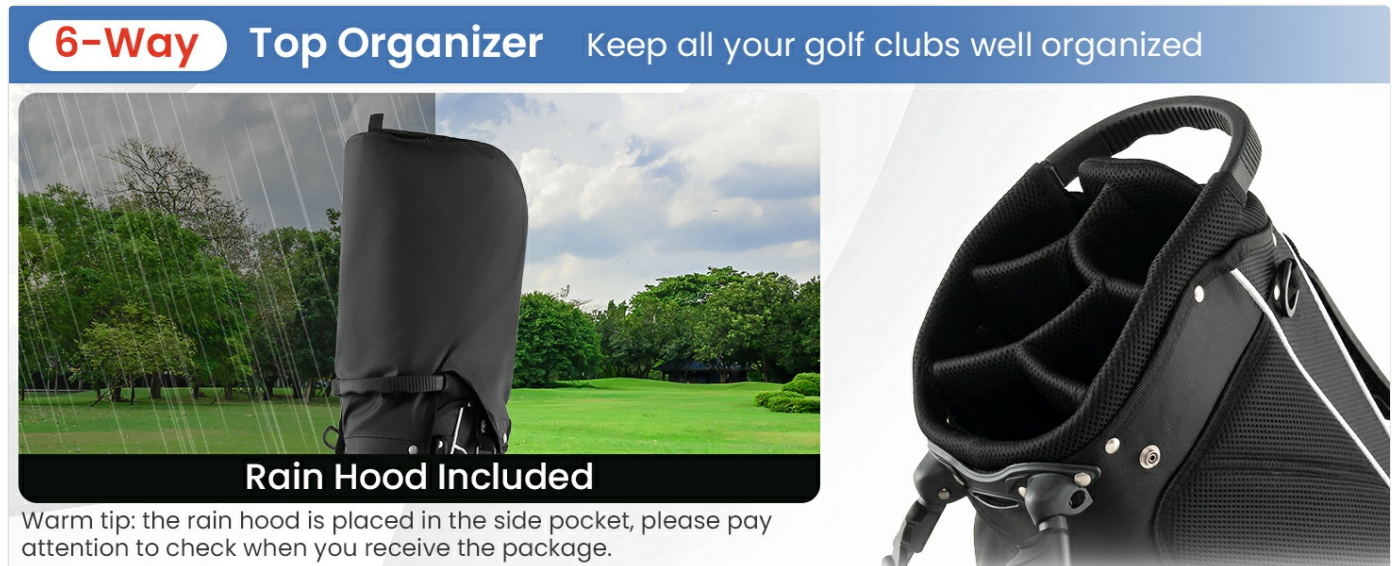
Image: A close-up of the 6-way top organizer for golf clubs and the rain hood.

The bag features a 6-way organizational top divider system. Insert your golf clubs into the individual dividers to keep them separated and protected. This helps prevent clubs from clattering and reduces wear.