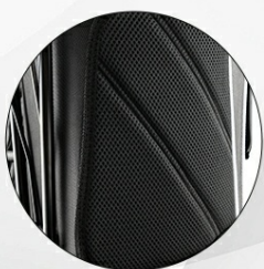
Comfy Hip Cushion