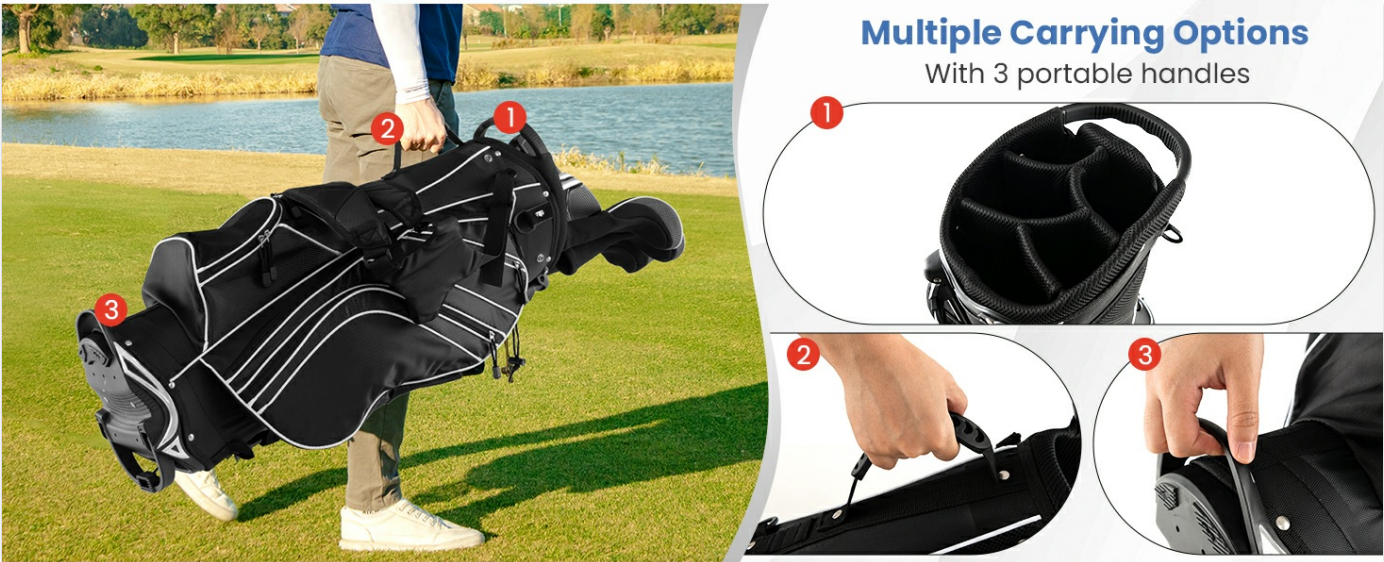
Image: A visual guide to the multiple carrying options, including the top handle, side handle, and shoulder straps.