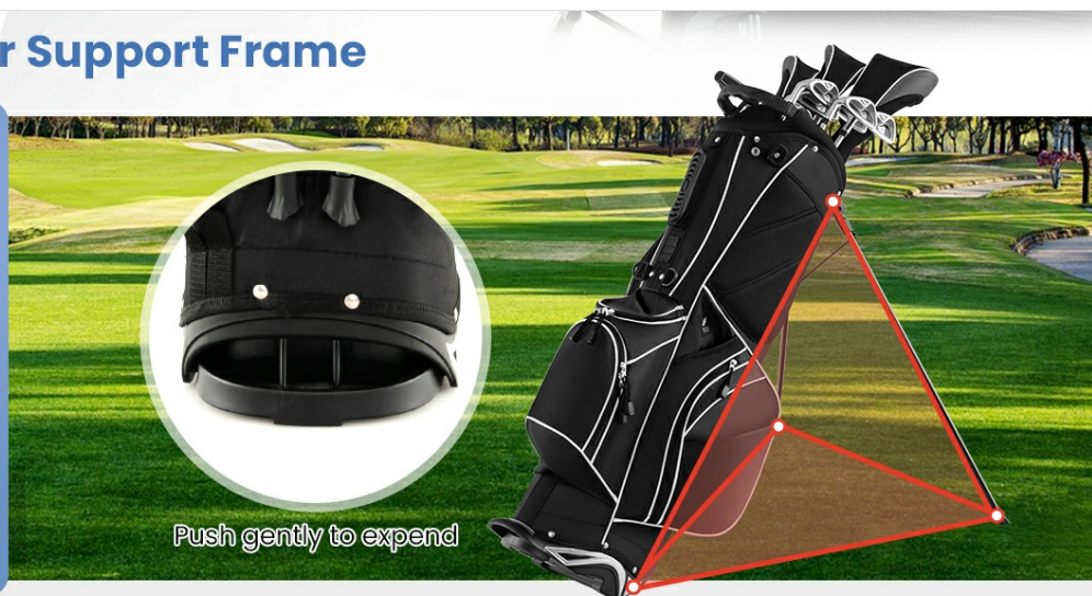
Image: A diagram illustrating the stable triangular support frame of the golf bag when the stand is deployed. The image also shows the base and how to push to extend the legs.

The bag is equipped with a solid base and non-slip feet on the stand legs to prevent sliding and ensure stability on various terrains.