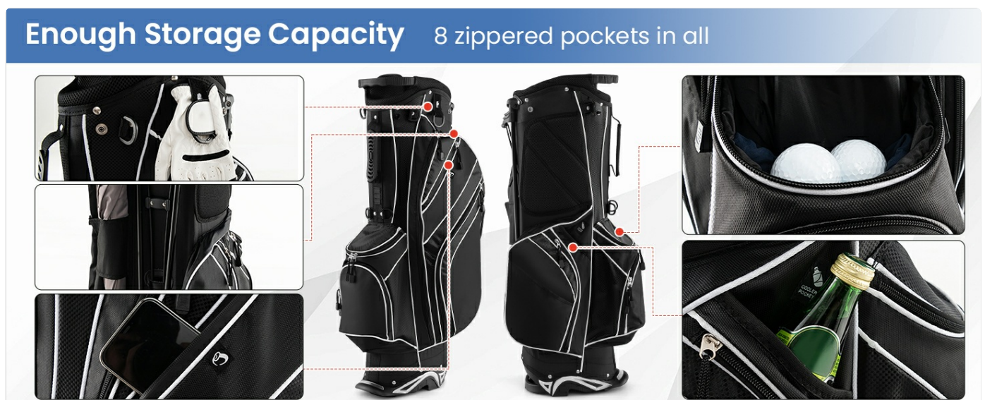
Image: A visual representation of the golf bag's various storage pockets and their locations.