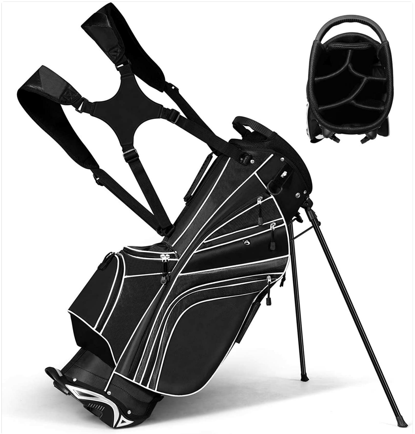
Image: The Tangkula Golf Stand Bag positioned on a golf course, ready for use, with a golfer in the background.