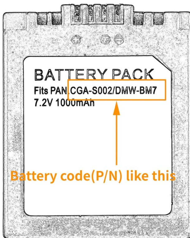
Image: Guide on how to identify the battery code on your battery to ensure compatibility with the charger.

BP-DC5 J, BP-DC5 U, CGA-S002, CGA-S002A, CGA-S002A/1B, CGA-S002E, CGA-S002E/1B, CGA-S006, CGA-S006A, CGA-S006E, CGA-S006E/1B, CGR-S002, CGR-S002E, CGR-S006, CGR-S006A/1B, CGR-S006E, CGR-S006E/1B, CGR-S006GK, DMW-BM7, DMW-BMA7