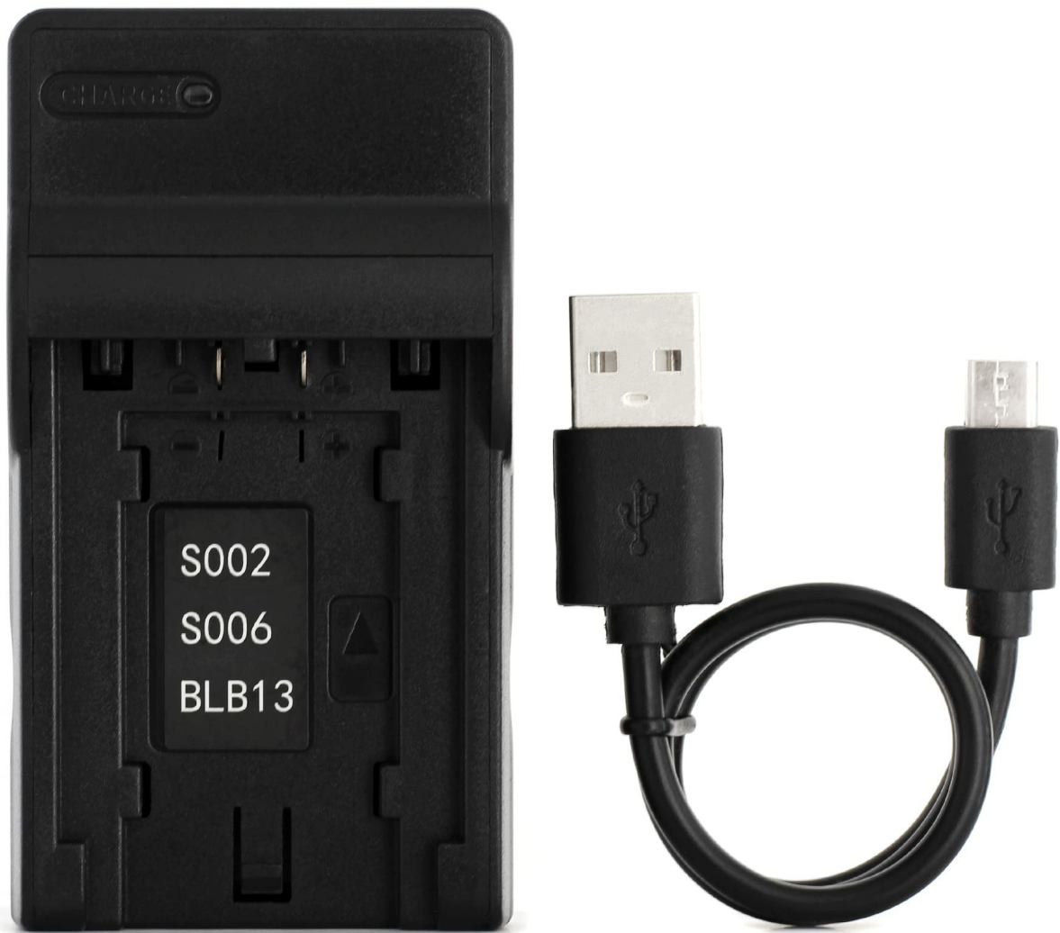
Image: Norifon CGA-S002 USB Charger. This image shows the compact design of the charger.