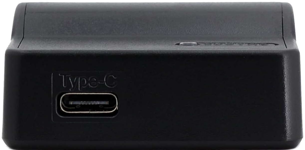
Image: Close-up view of the USB Type-C port on the charger, indicating the connection point.