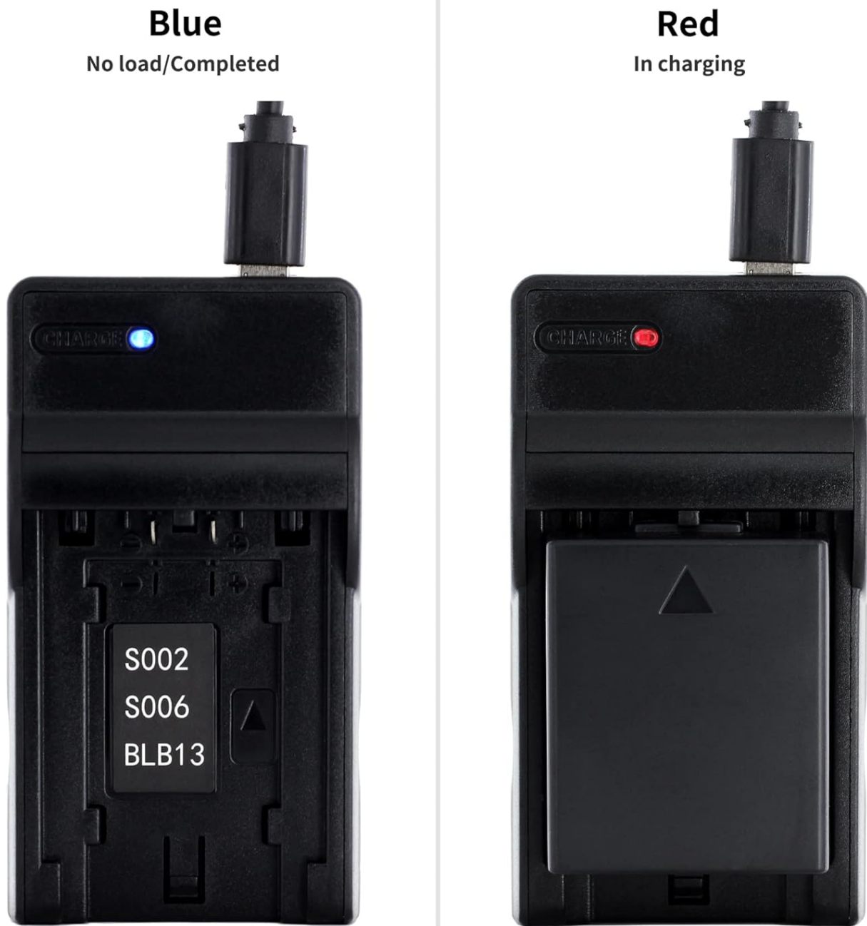
Image: The charger's LED indicator showing a red light when charging and a blue light when charging is complete or no battery is present.

Your browser does not support the video tag.