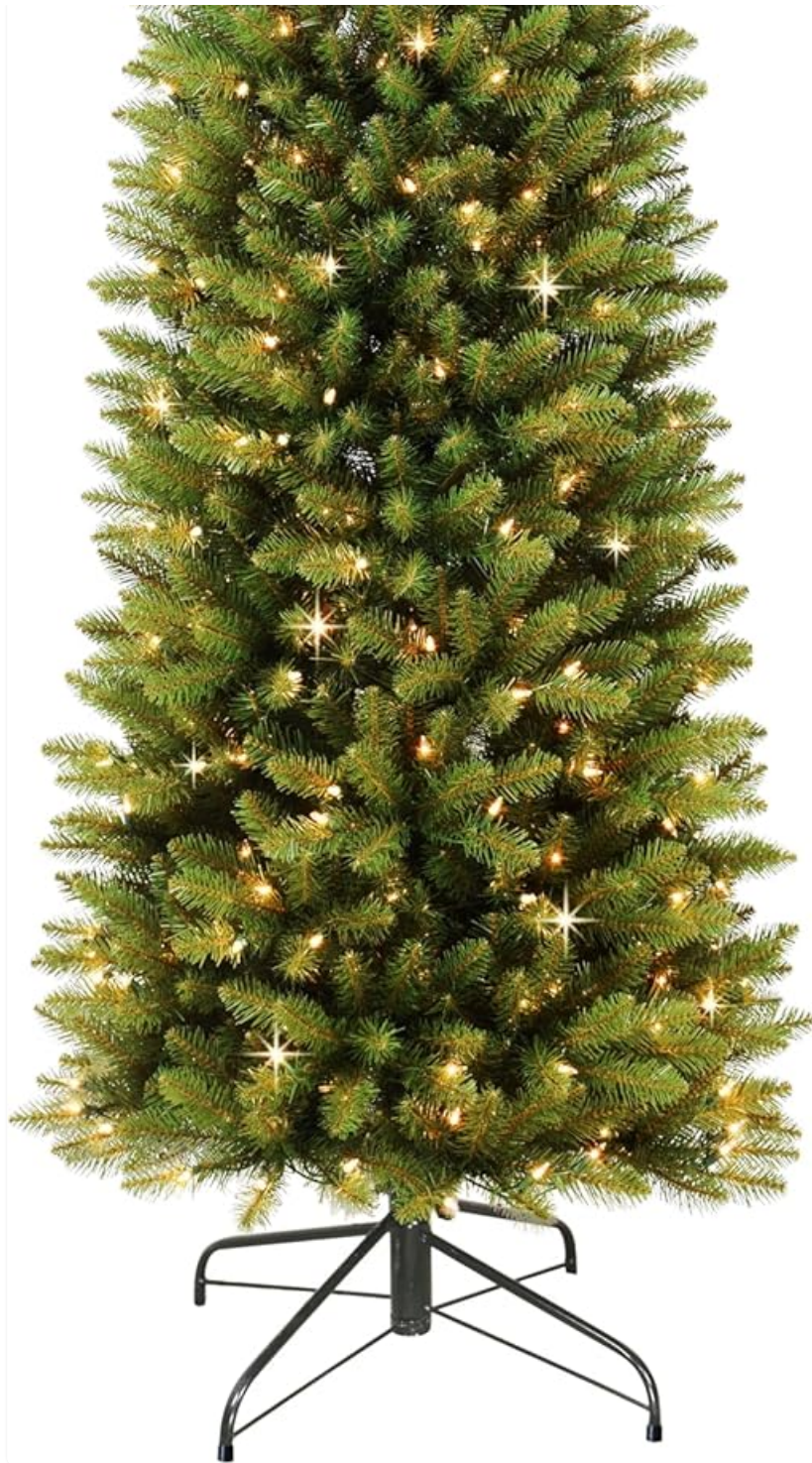
Image: The Puleo International 7.5ft Pre-Lit Slim Fraser Fir Christmas Tree, fully assembled and lit.