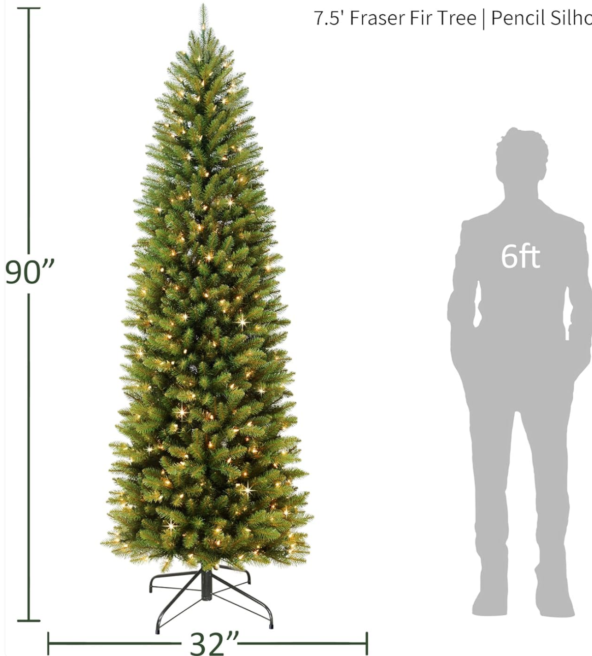
Image: Visual representation of the tree's dimensions (90 inches height, 32 inches width).

7.5' Fraser Fir Tree | Pencil Silhouette