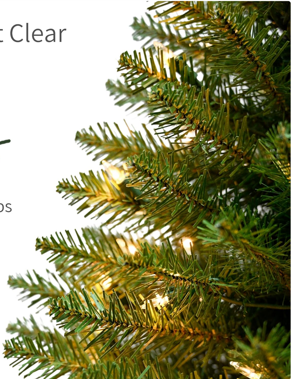
Image: Close-up view of the pre-lit clear lights integrated into the tree branches.