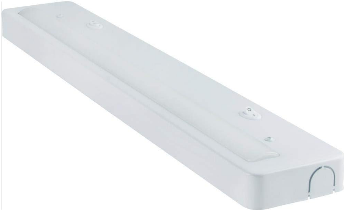
Image: The Enbrighten 12-inch LED Under Cabinet Light Fixture, showing its compact and sleek design.