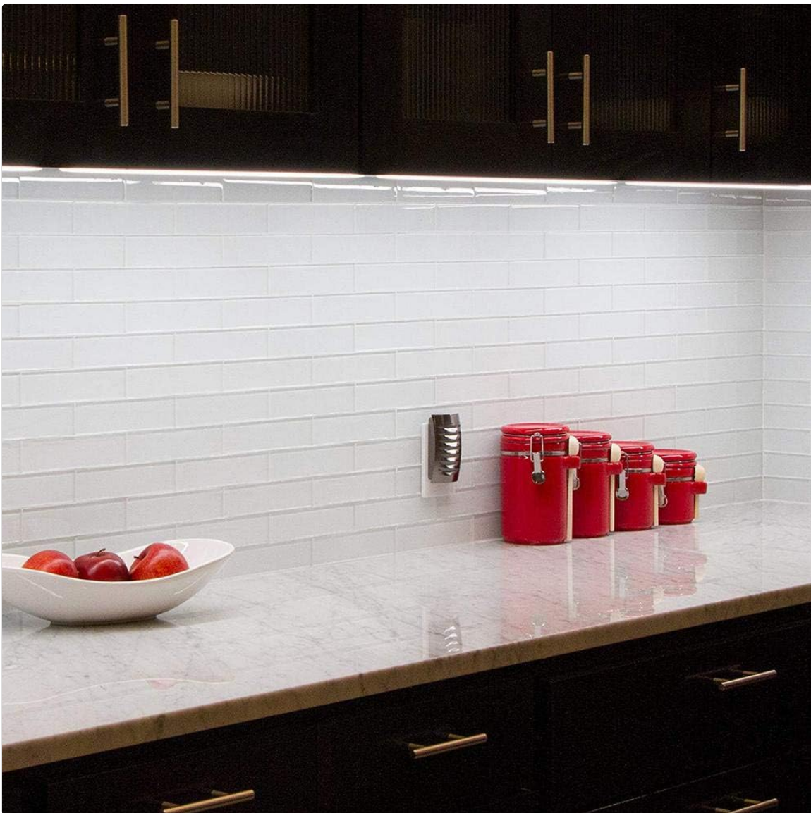
Image: The Enbrighten LED light fixture seamlessly installed under a kitchen cabinet, providing bright and even illumination to the countertop and backsplash.

This fixture is compatible with most in-wall dimmers (front phase dimmability). If connected to a compatible dimmer switch, you can adjust the brightness level from the wall switch.