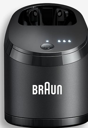
5-in-1 SmartCare Center