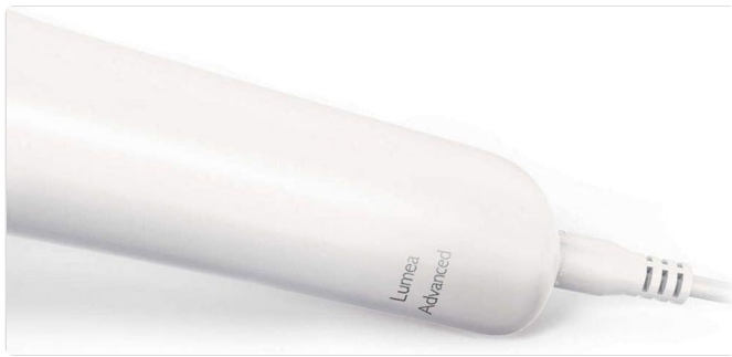
Image: A detailed view of the power cord connecting to the base of the Philips Lumea device.