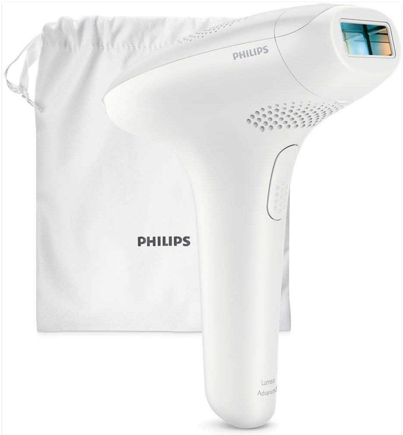
Image: The Philips Lumea IPL device shown alongside its white storage pouch, indicating typical package contents.