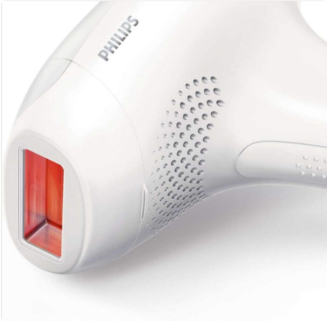
Image: A close-up view of the device's treatment window, showing the light emission area and ventilation grilles.