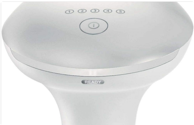
Image: The device displaying the illuminated 'READY' indicator, signifying it is prepared for a flash.