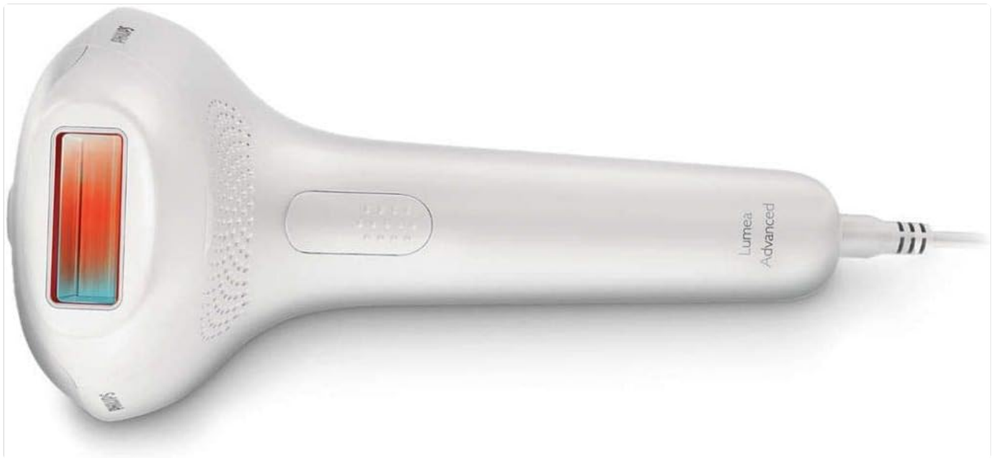
Image: An angled view of the Philips Lumea device, highlighting the treatment window where light pulses are emitted.