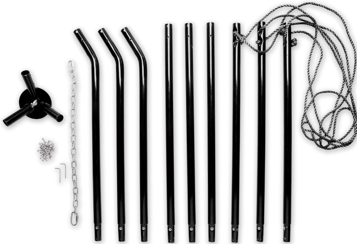
Image: All components included in the package.