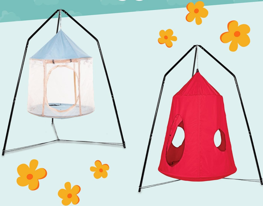
Image: Examples of HugglePods on the stand.