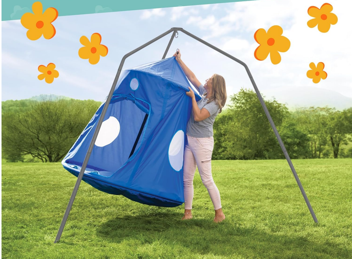
Image: Attaching a HugglePod to the stand.