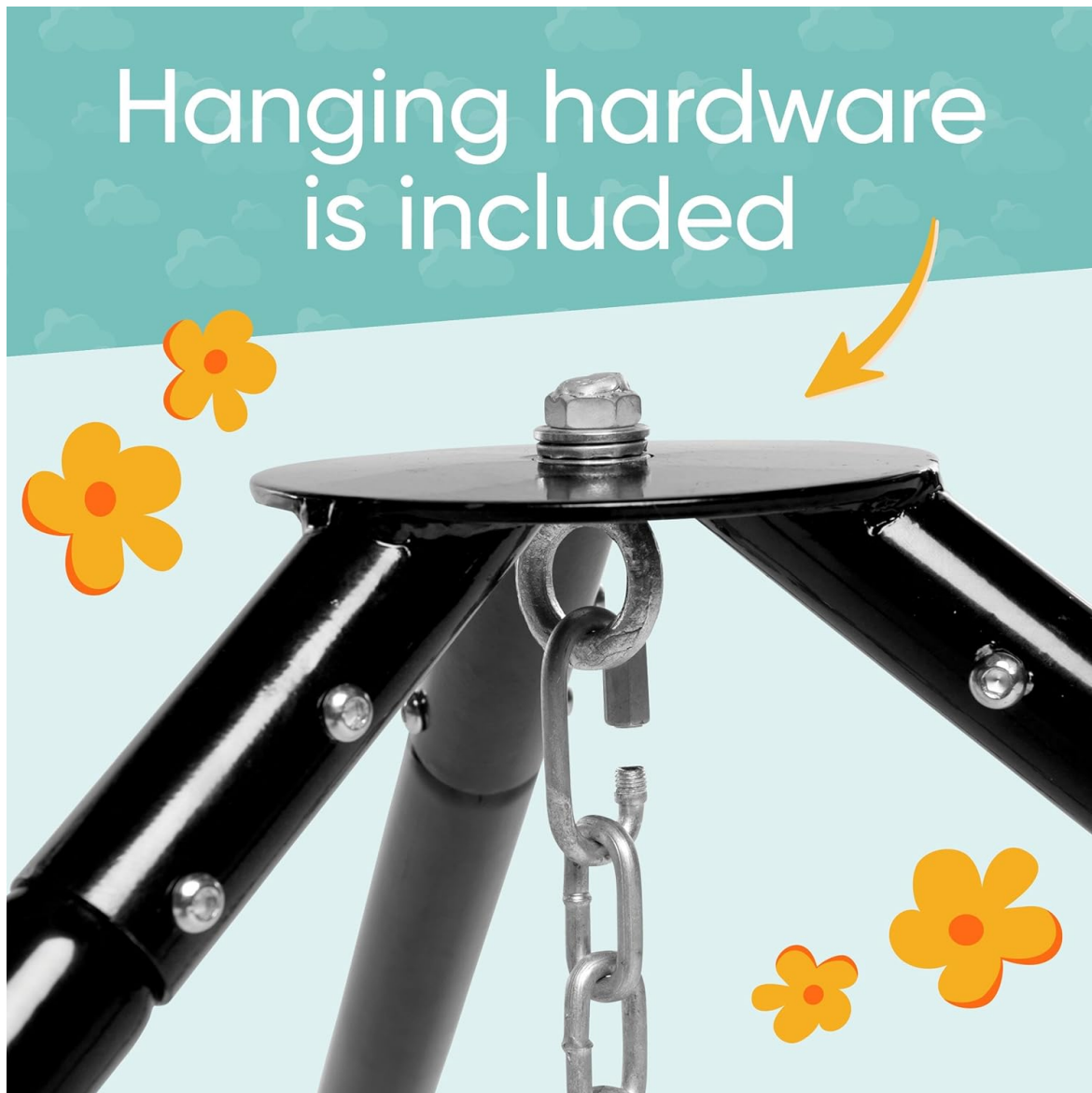
Image: Close-up of the hanging hardware installation.