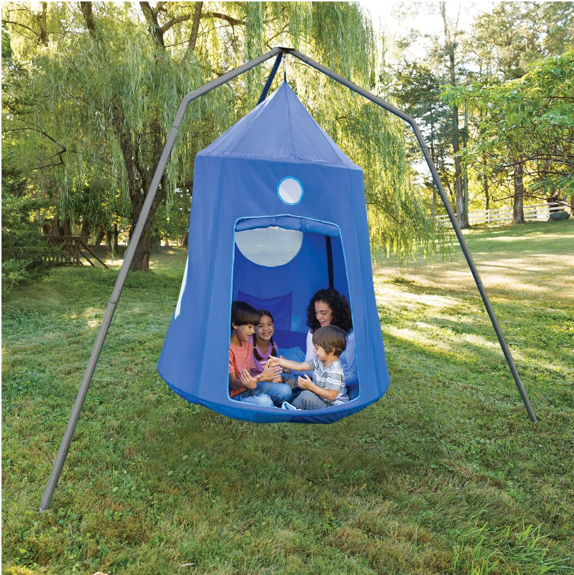
Image: Family enjoying a HugglePod on the stand.