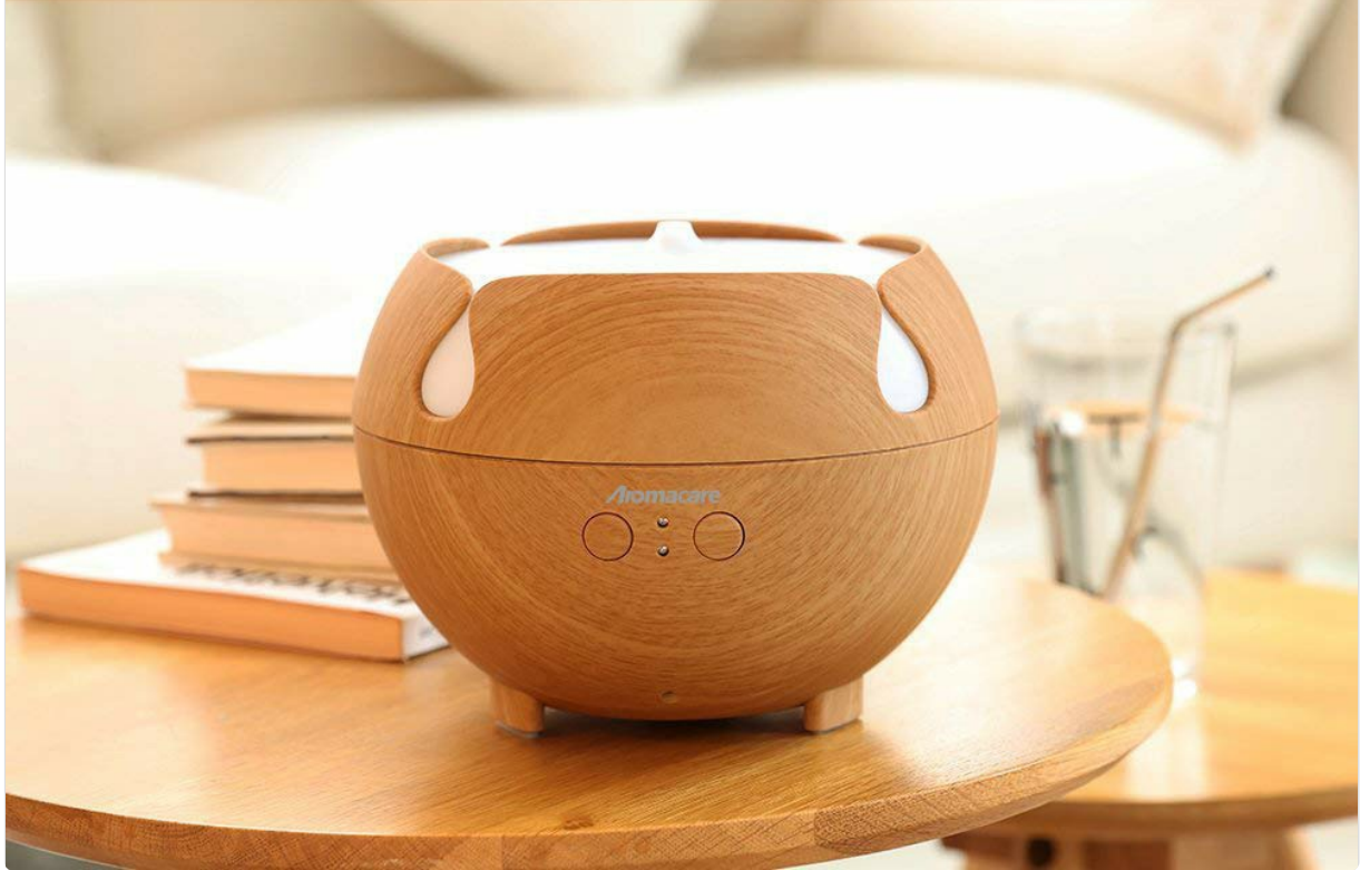
Image 6: The large capacity allows for longer misting times and effective humidification.