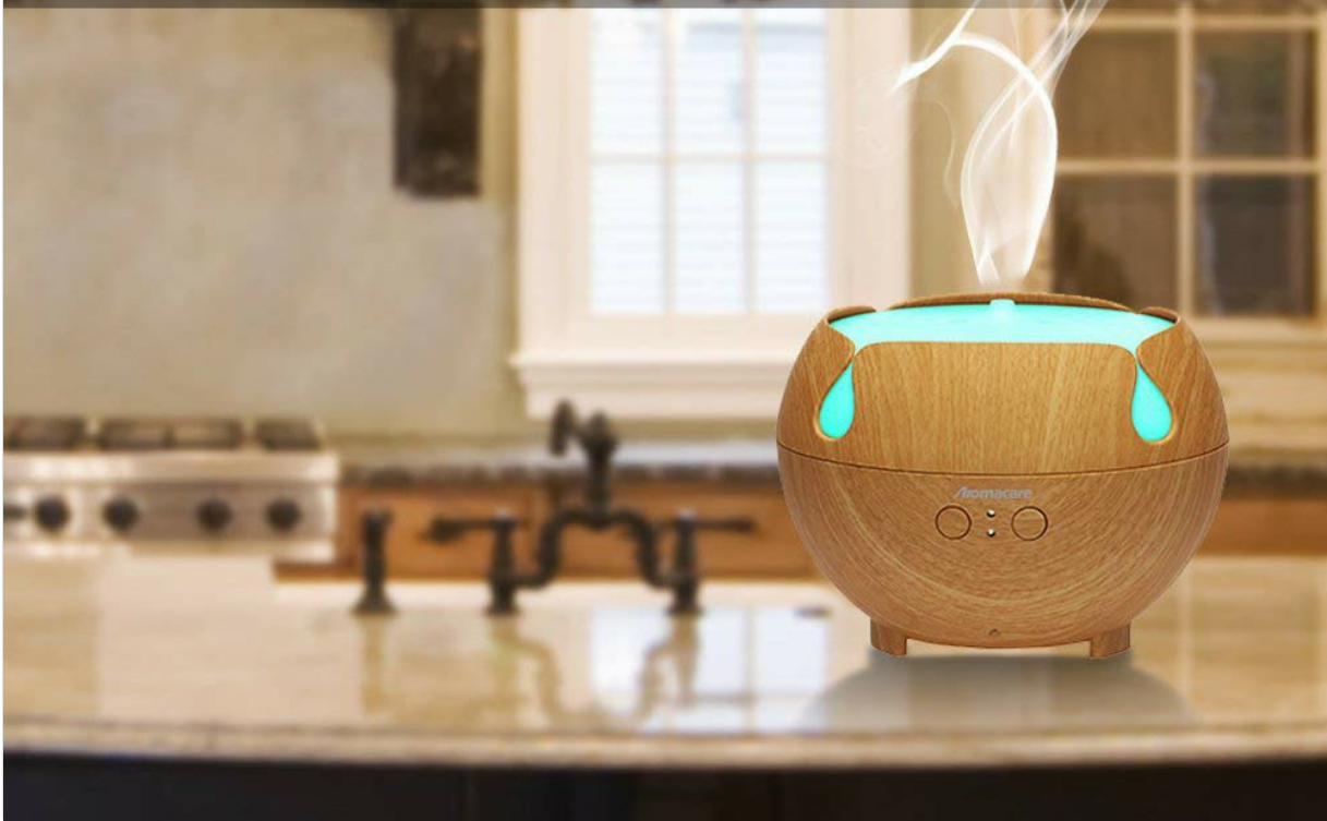
Image 1: Aromacare 600ML Essential Oil Diffuser in use, providing an elegant and healthy lifestyle.

Provide an elegant and healthy lifestyle