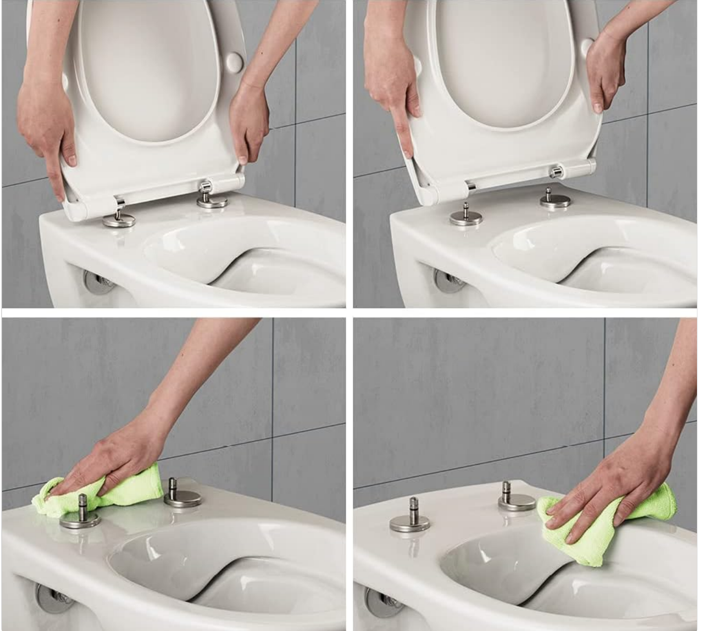
Image: Step-by-step visual guide demonstrating the "Quick Up & Clean" function, showing how to detach the toilet seat from its hinges for easy cleaning and reattachment.