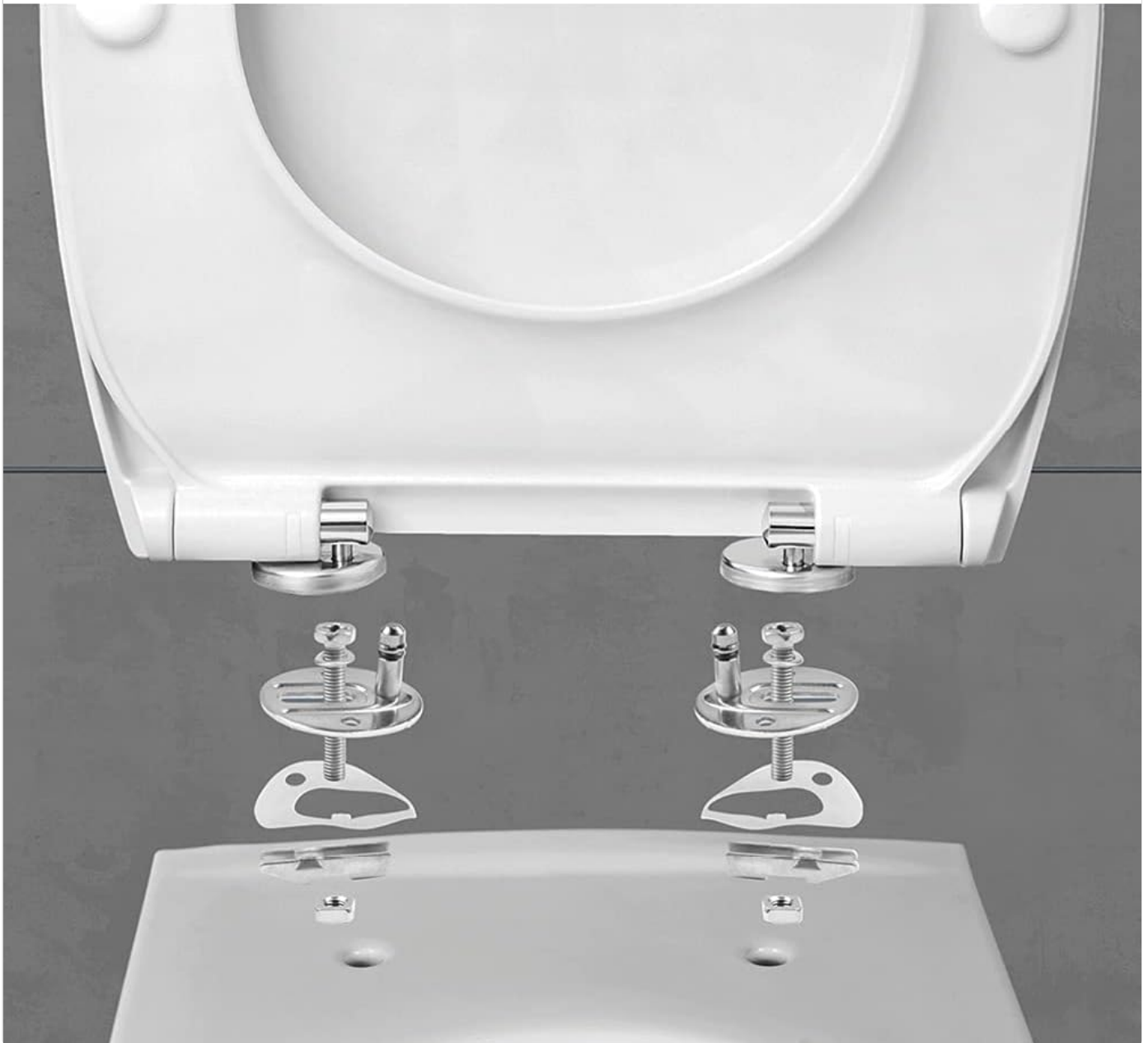
Image: Illustration of the "Montage von oben" (mounting from above) feature, showing how the hinges are secured directly from the top of the toilet bowl.