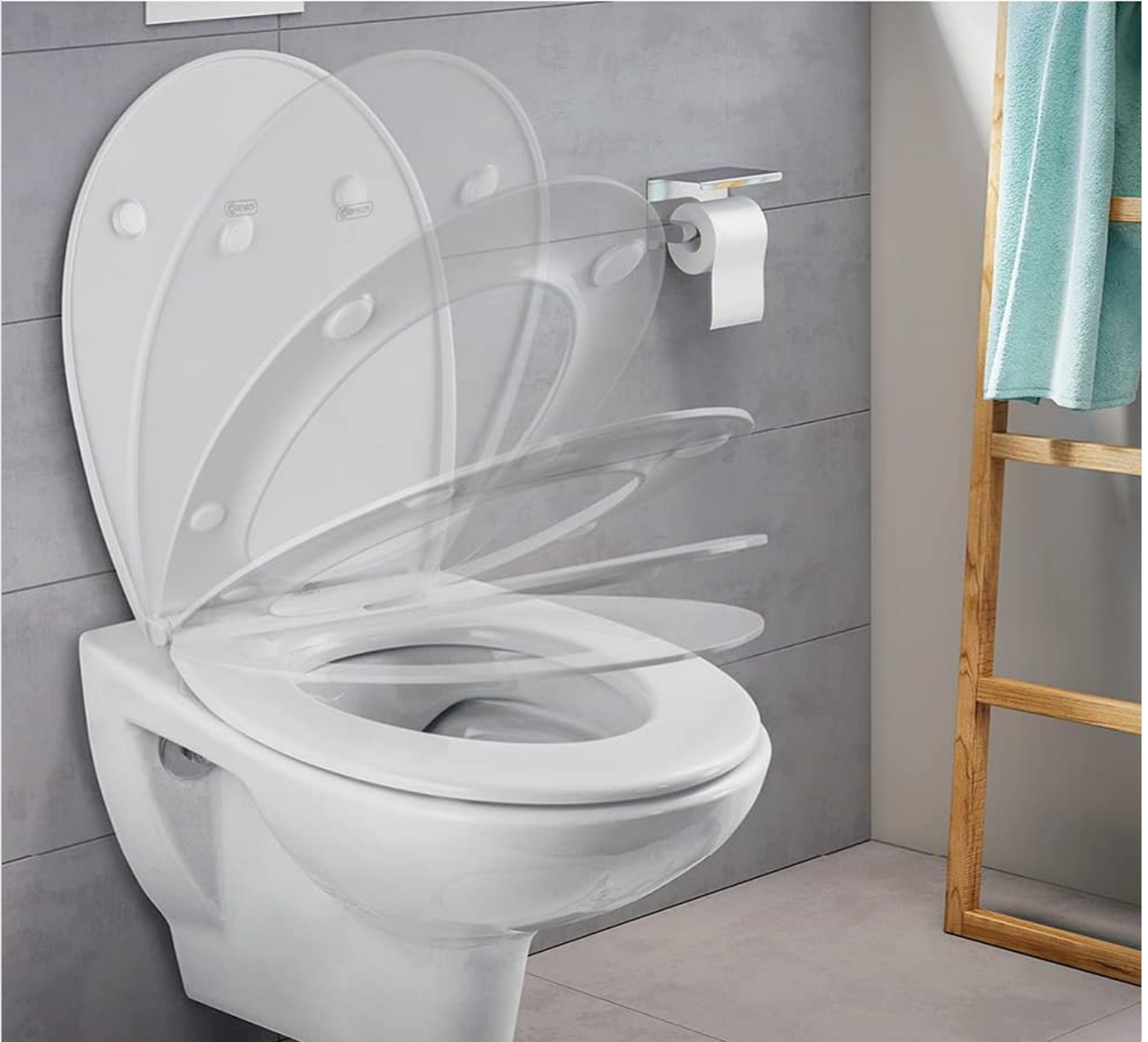
Image: Visual representation of the "Absenkautomatik" (slow-close mechanism), depicting the toilet seat and lid gently lowering.