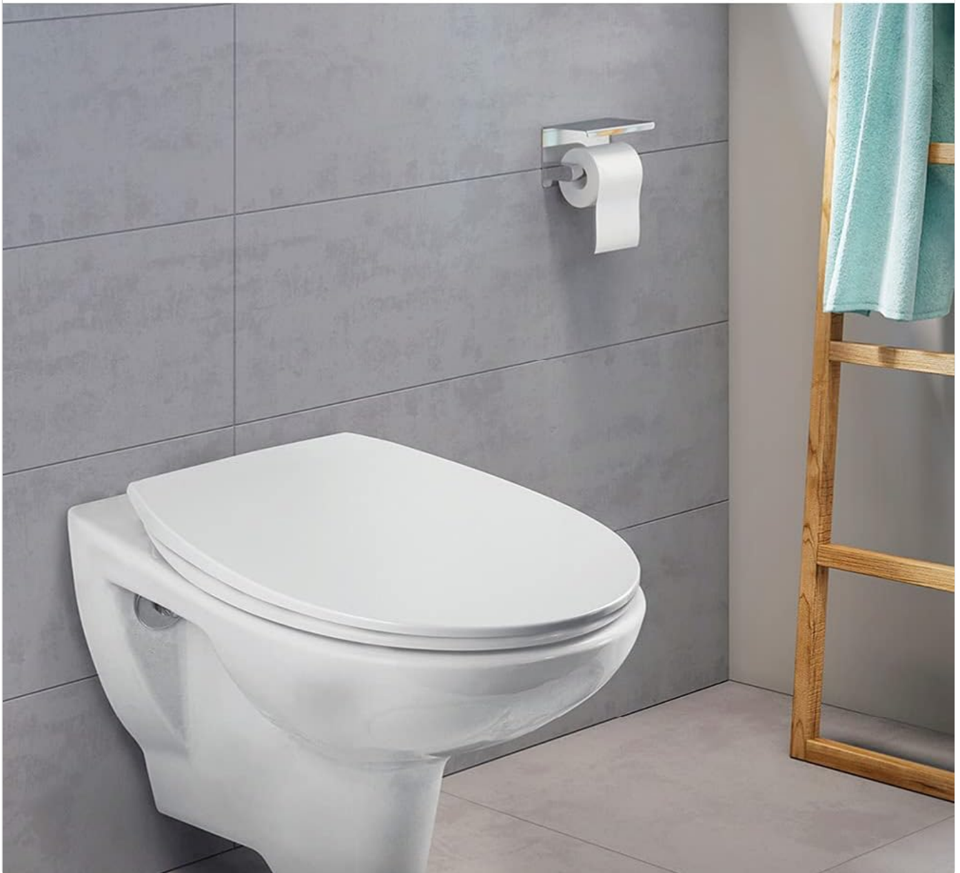
Image: A clean bathroom setting featuring the Cornat toilet seat, emphasizing its antibacterial material for enhanced hygiene.