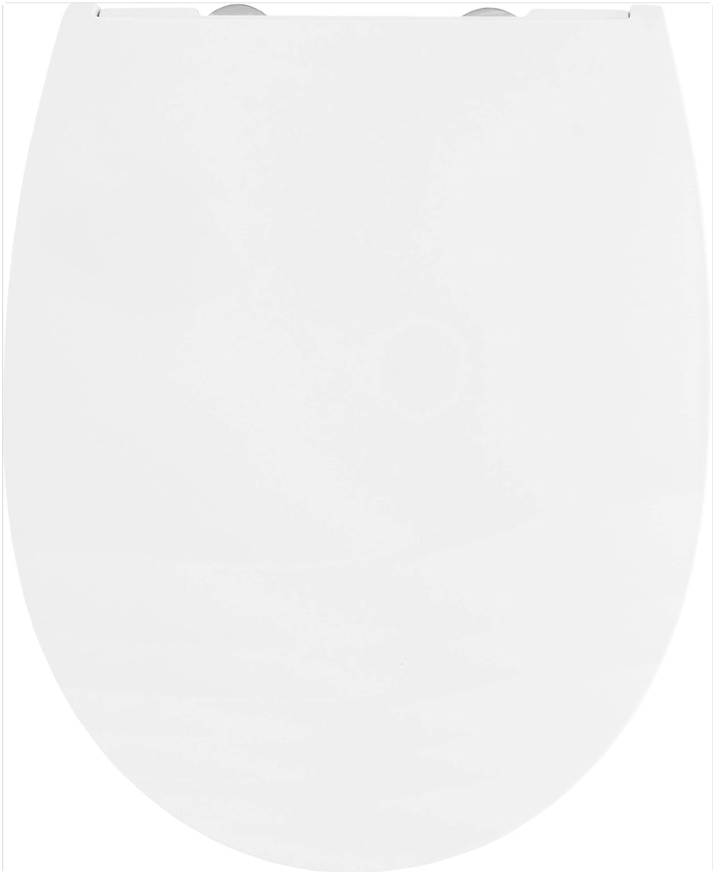
Image: Top-down view of the Cornat Premium 4 Toilet Seat, showcasing its clean, white design and integrated hinges.