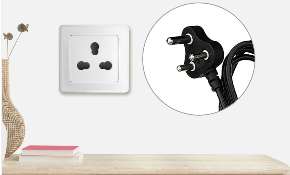
Image: Close-up of the 16A 3-pin plug, indicating the type of socket required for safe operation.