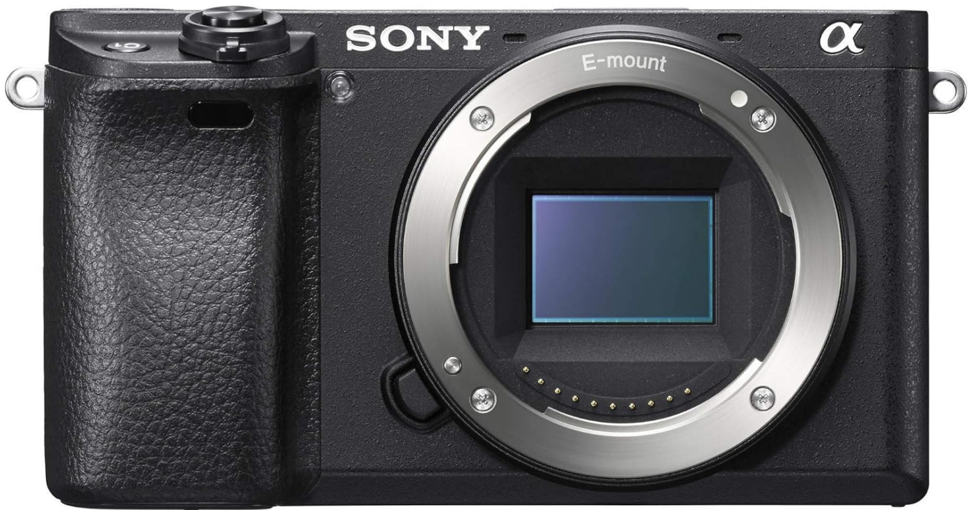
Front view of the Sony Alpha a6500 camera body, showcasing the E-mount lens attachment system. The silver E-mount ring is prominent, indicating where compatible lenses are attached.