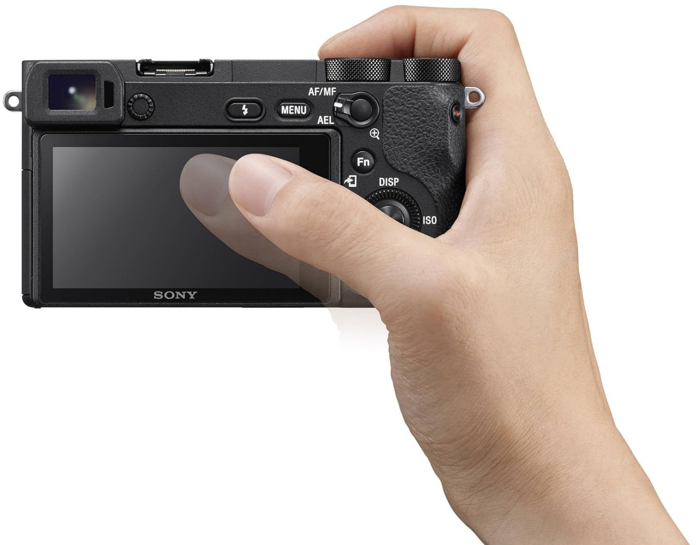
A hand demonstrating interaction with the touchscreen of the Sony Alpha a6500. This image illustrates the ease of selecting focus points or navigating menus directly on the LCD.