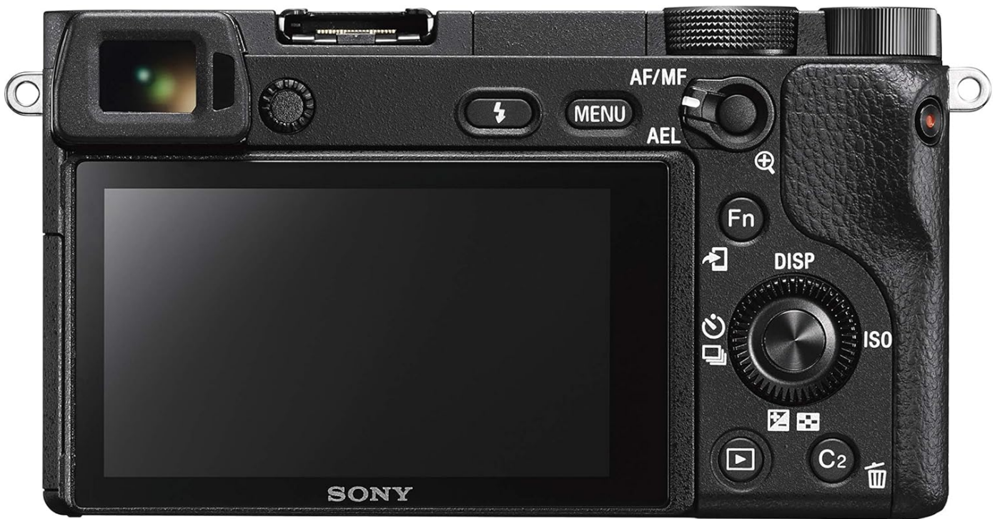
Rear view of the Sony Alpha a6500, displaying the LCD screen and various control buttons. Key controls like AF/MF, AEL, Menu, Fn, DISP, and ISO are visible around the screen.