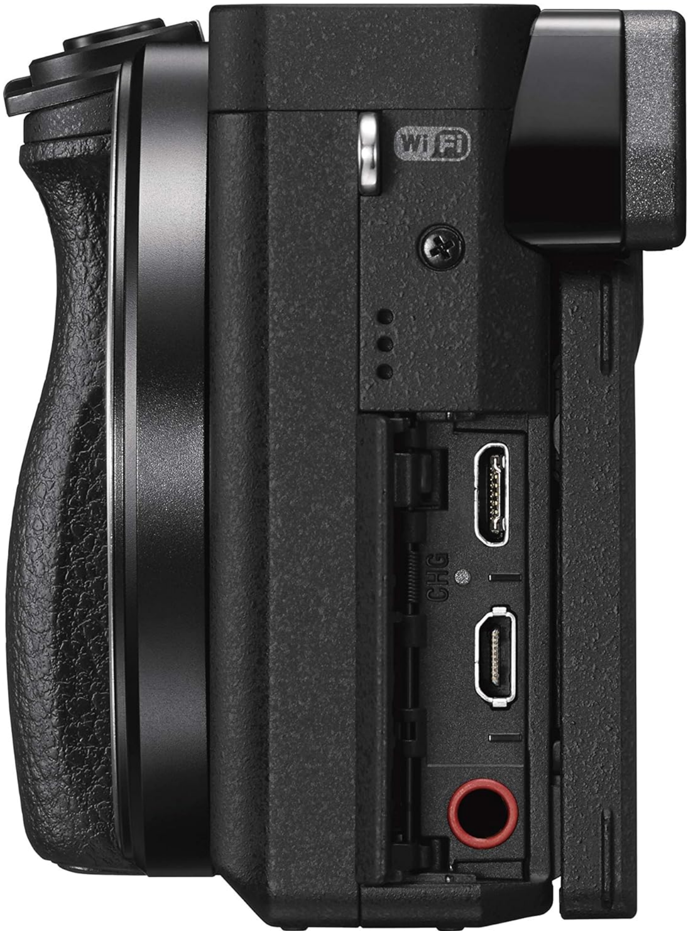
Side view of the Sony Alpha a6500, revealing the connectivity ports. These include the Micro USB port for charging and data transfer, and the HDMI port for video output.