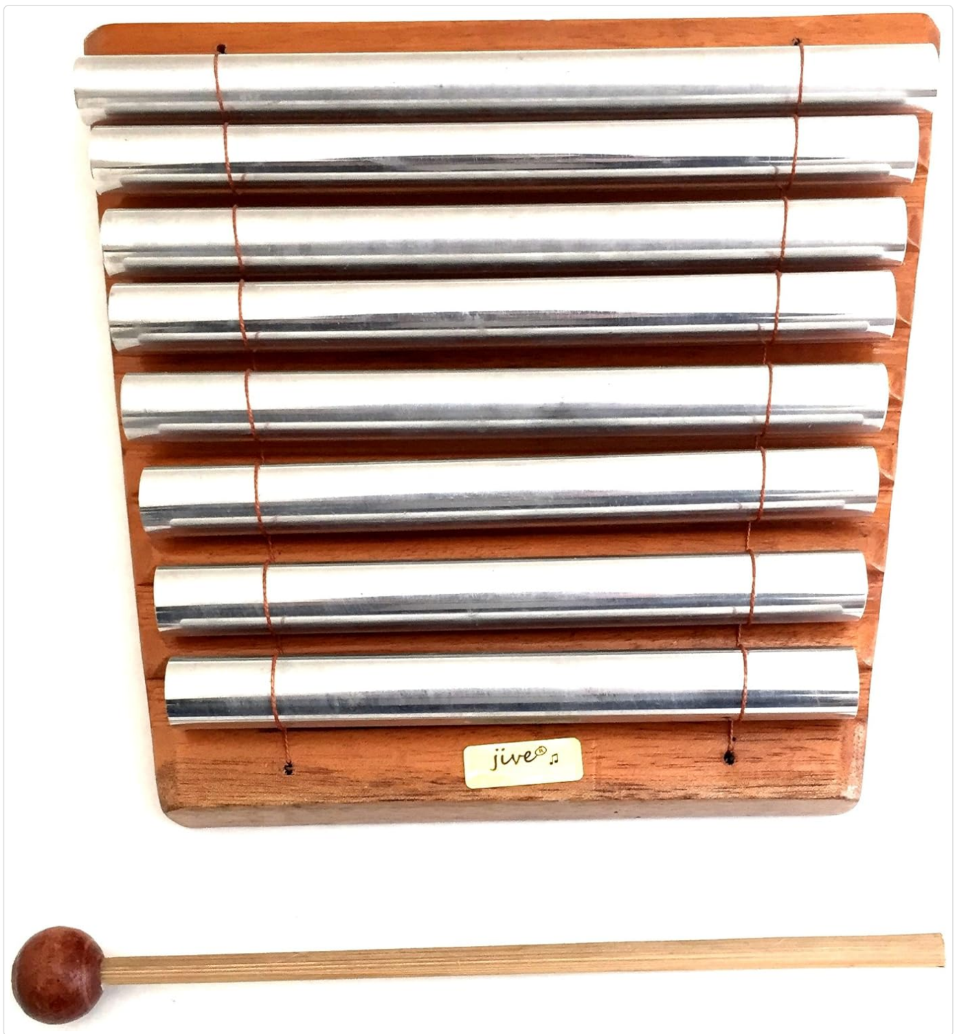
Image: Rear view of the Jive 8-Bar Meditation Chime, illustrating the wooden base and the stringing of the aluminum bars, with the Jive logo visible.